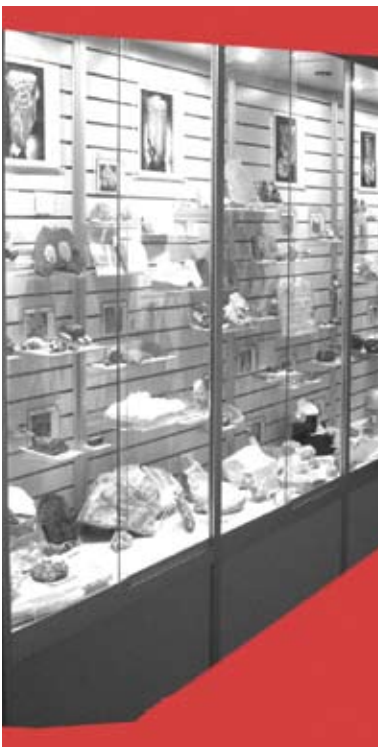
International Wildlife displays at Mt. Aetna Camp, Maryland, United States of America

A series of a half dozen checklists of the wildlife (from birds and dragonflies to fungi and trees) found at the camp are also available for those wishing to walk the camp trails. And there are some free short article brochures on creation/evolution to help explain "the other side of the coin". On most Saturday afternoons anywhere from a dozen to several dozens of young and old enjoy wandering the various rooms, listening to interesting stories and about natural history curiosities and marveling at God's handiworks. One recent visitor commented "I've lived in the area for nearly 50 years and never knew this place was here!" Another said, "I like this place better than the Smithsonian because here I don't have to filter out man's godless ideas." Numerous school groups and kid's clubs take advantage of the opportunity and make it a field trip full of fun and learning all in one.