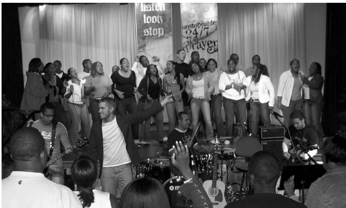
division: North America Musicians from Sea of Glass and One Accord together in worship at the 2005 GODencounters Retreat, UNSTOPPABLE 24/7 Prayer.

Though difficult, one of the most important tasks in ministering to Seventh-day Adventist youth will be equipping their parents for parenting. Nothing will shape the faith and attitudes of young people more than their parents’ self-esteem, parenting styles, moral stances and faith. Youth ministries can offer events and programs that strengthen family well-being, marriage relationships, family communication, discipline, faith-sharing and moral values.