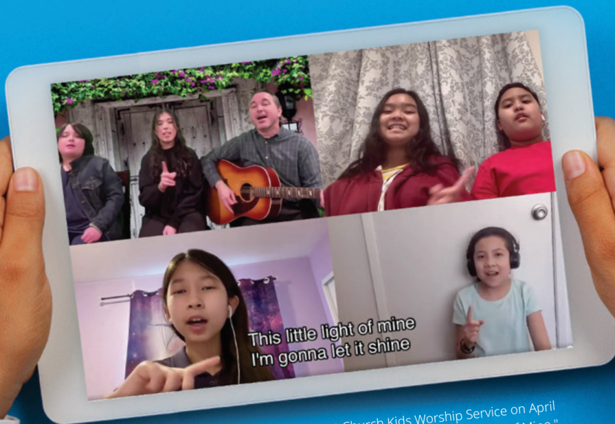
During the Corona Seventh-day Adventist Church Kids Worship Service on April 17, 2021, children and parents lead song service with "This Little Light of Mine."

V irtual pancake breakfasts, Vacation Bible School, Lego video stories and Bible studies, family skits, and outdoor learning segments are just the tip of the iceberg for the virtual program at Corona Seventh-day Adventist Church in California. This church, already producing a quarterly multigenerational Sabbath School experience before the COVID-19 pandemic, expanded its program into a full, weekly online worship experience. And the beauty of each program produced is not only the creativity employed in the various segments. It's also about seeing the interaction between some of the youngest congregants (think toddlers), their siblings, parents, and even grandparents.