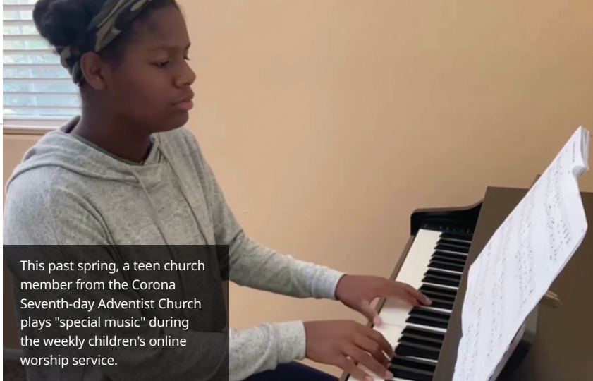
This past spring, a teen church member from the Corona Seventh-day Adventist Church plays "special music" during the weekly children's online worship service.

When we are in person and do things together, the adults will come up to