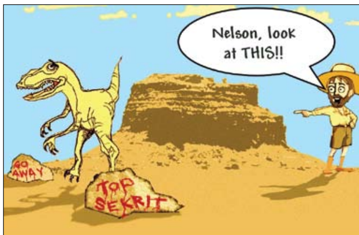
Then by sheer luck, scientists from the Geoscience Research Institute discovered the Secret Raptor , changing Adventist beliefs forever.