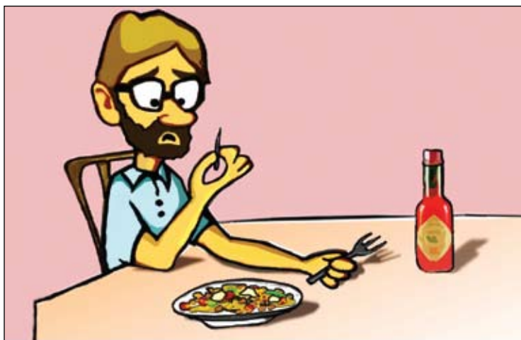
Wallace began to suspect foul play when he found yet another needle in his haystacks.