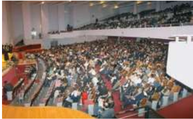
The Portuguese camp meeting in October 2006 was held in an auditorium at Hunter College in New York.