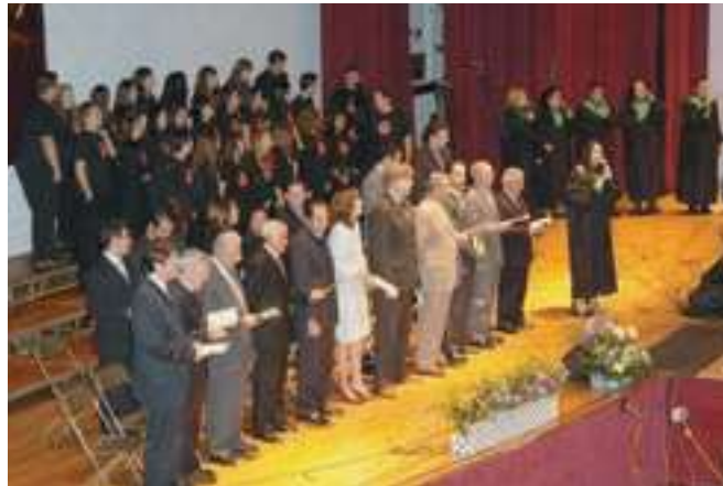
A youth choir from Rio de Janeiro, Brazil, participated along with the platform personnel during the worship service.

choir of over 300 performers concluded the event.