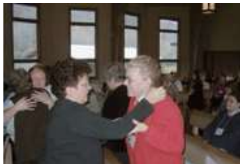
Attendees to the 2006 New York Conference Women's Retreat take time to greet one another and meet new people.