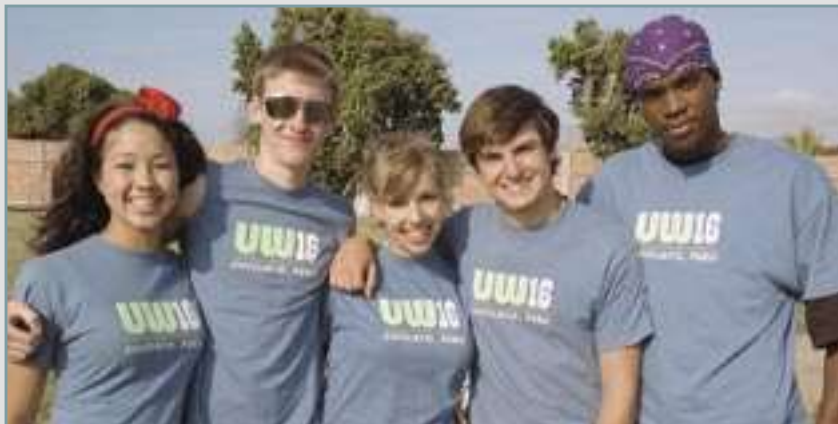
Five Atlantic Union teens helped build five much-needed church buildings in Peru in 2006. Maranatha Volunteers International orchestrates this teens-only project every summer.

The experienced leadership team from Maranatha Volunteers International, and a time-tested system allows young adults, 14-18 years old, to independently take a step toward spirituality and mission on their own terms. And the results might surprise you.