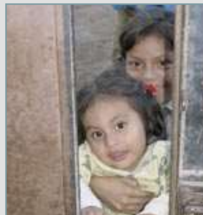
Curious children peek in at their new friends.