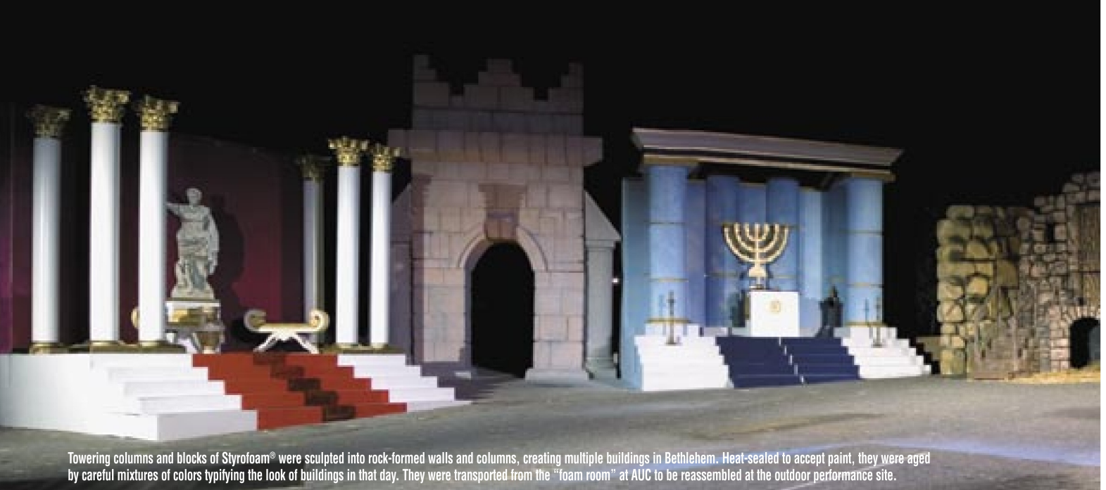
Towering columns and blocks of Styrofoam® were sculpted into rock-formed walls and columns, creating multiple buildings in Bethlehem. Heat-sealed to accept paint, they were aged by careful mixtures of colors typifying the look of buildings in that day. They were transported from the "foam room" at AUC to be reassembled at the outdoor performance site.