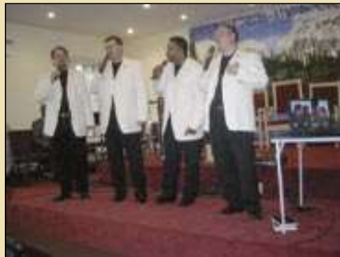
A day of celebration with the Kings Herald Quartet.