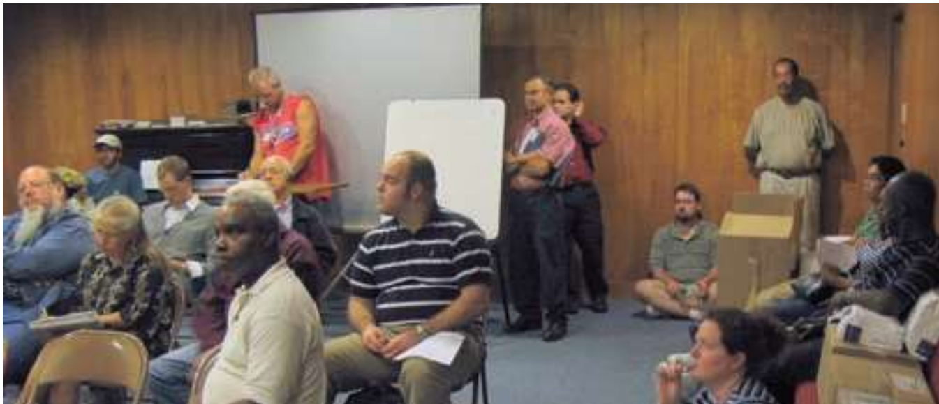
Pastors and lay members unite in preparing for a series of evangelistic meetings in Rochester, New York.