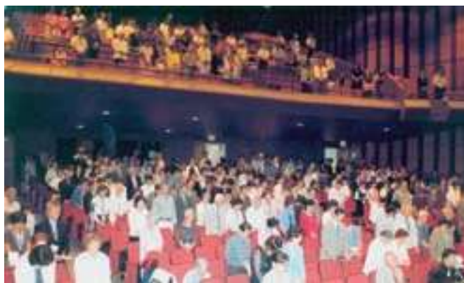
According to many who attended, the youth section of the camp meeting was not only the best youth camp meeting we've ever had, but also the best attended since the inception of the United Korean camp meeting 29 years ago.