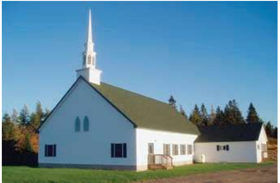
The Three Angels Seventh-day Adventist Church is a miracle to the Lubec church members who were told they had to close the doors of the original church when ceiling beams starting caving in.

The most unforgettable miracle though, is that now