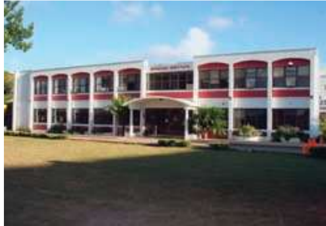
The Bermuda Institute administration was pleased and thankful to receive $115,200 from the Bank of Bermuda Foundation. This grant will enable the school to purchase 72 computers for the classrooms from grades K-12.

for the classrooms from grades K-12. The students and teachers are especially appreciative and excited, as this grant will greatly enhance student learning in the classroom and make students more accountable for their own learning. An order to Dell Corporation was immediately placed and the computers arrived before school closed for the Christmas break. What a Christmas present!