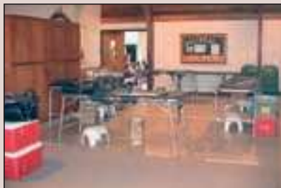
Red Cross personnel set up operations in the fellowship hall and in two of the Sabbath School rooms for our scheduled bi-monthly Blood Drive.

We received a request to hold the elections at our facilities because it