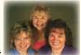
Audience of One MUSICIANS