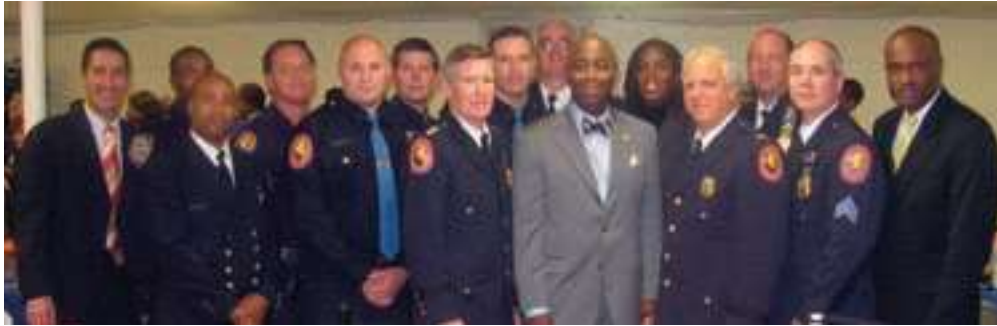
Bethany church honored many officials during its 9 th Annual Police Community Adoption Program.

On October 27, 2007, the Bethany church in Westbury, New York, celebrated its 9 th Annual Police Community Adoption Program.