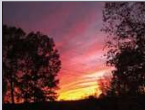
The sunset views that can be seen from the sunroom are breathtaking.

In addition to being blessed with a larger place in which to worship, the group now has a mini-van that they can use in their outreach programs. God has been blessing us in so many ways.