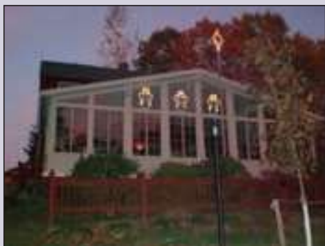
Construction on a sun/worship room for the members of the South Berwick Fellowship group was recently completed.