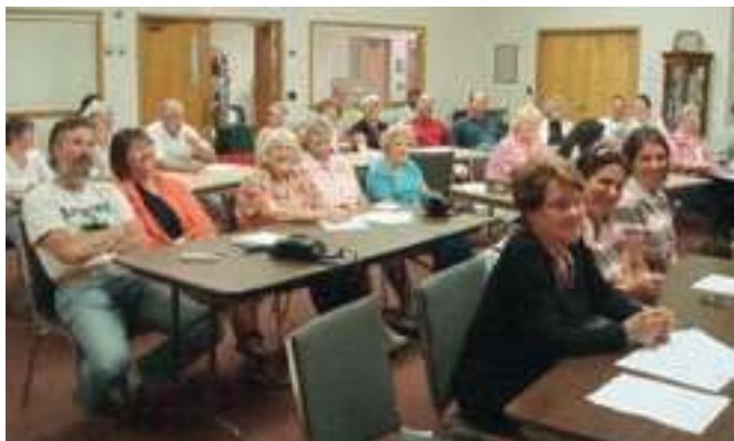
More than 63 visitors attended the “LifeStyle Matters—Coping with Stress” four-week series sponsored by the Burrillville, Johnston, and Wickford churches. They enjoyed delicious and nutritious food and wonderful fellowship.