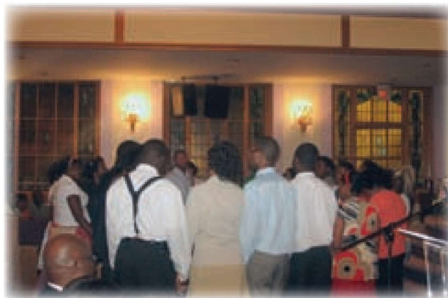
At City Tabernacle church the youth gathered to rekindle their bond with Jesus Christ.

August 16, sermons, music, and technology for the evangelistic series were facilitated entirely by youth. Twenty-four young people (ages 13 to 28) from 10 of the area churches presented powerful messages that engaged both young and old in an intimate, interactive, and immediate way.