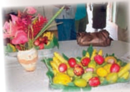
The local fruit is not only beautiful in color, but refreshing to eat.