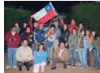
Church members from the Los Alamos, Chile, church came to say goodbye to us at 6:00 a.m.