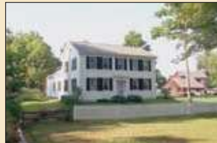
The camp meeting was held at the site of the William Miller Home and Chapel in Whitehead, New York.