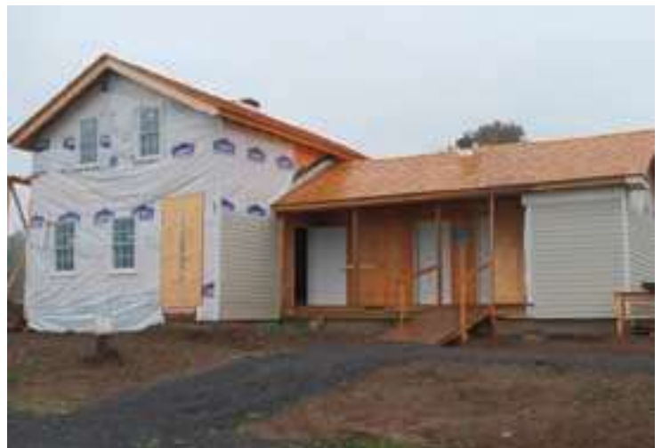
Phase One of the visitors' center at the Hiram Edson barn was dedicated on September 6.

caretakers quarters to be completed. By God's grace and with the generous support and prayers of many individuals, the theological birthplace of Seventh-day Adventist Church will have a completed center where people can learn about the sanctuary and why it is important in their lives.①