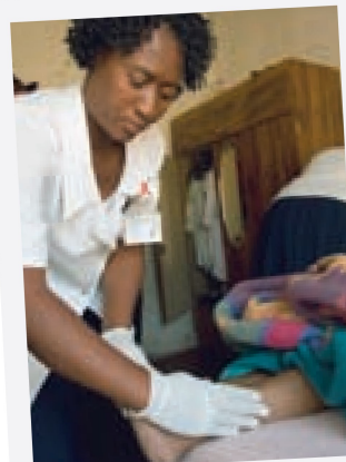
Caregivers travel many miles by foot to provide services for the sick and to let them know that someone cares.