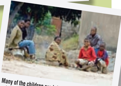
Many of the children are left to take care of themselves after their parents die of AIDS.