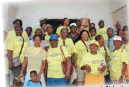
Mount Sinai church members spent seven days in St. Lucia serving the community.