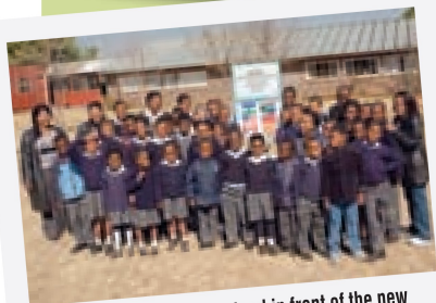
Students and teachers stand in front of the new sign placed in front of the school.