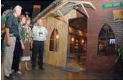
La "Iglesia de un día" presentada en la convención de ASI en Tampa, Florida, la semana pasada.

Las estructuras, que pueden ser completadas en solo seis horas, proveen la estructura exterior y el techo, y entonces los miembros locales se ocupan de terminar las paredes con los materiales que tengan a mano y puedan adquirir, como por ejemplo ladrillos o bambú. En julio,