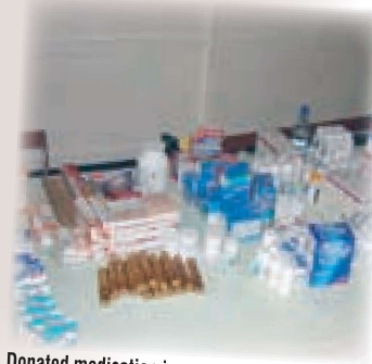
Donated medication is arranged for distribution.