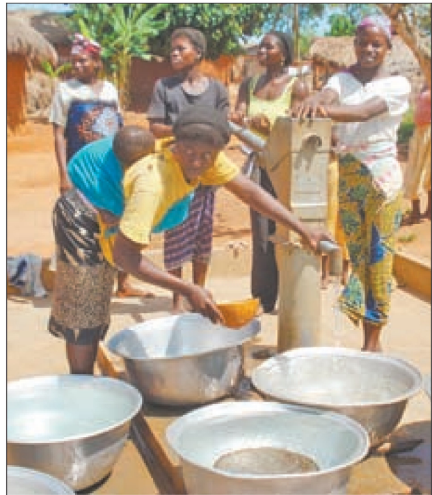
Women gather water for home use at a water fountain in Ghana.

Students and faculty at Atlantic Union College (AUC) traveled to Ghana from May 21 to June 21 to complete mission work. Nine students participated, staying at a central hotel with faculty, and each was