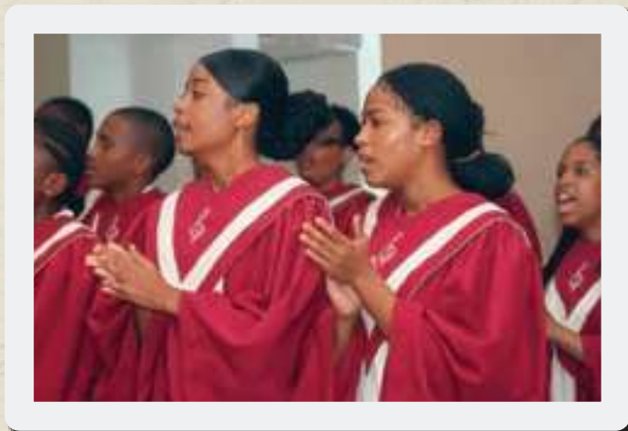
Bermuda Institute choir members sing for Bermuda Institute day at a Midland Heights church service.