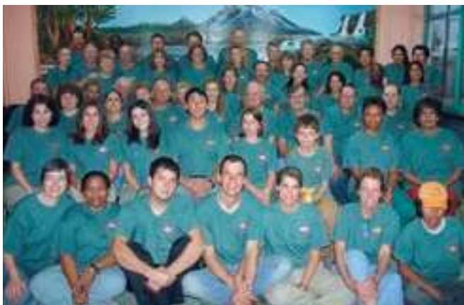
Fifty volunteers prepared to construct a new church, provide dental and medical care, conduct evangelistic meetings, and a Vacation Bible School program for the children in Los Alamos, Chile.

www.sneconline.org . Click on "Schools."