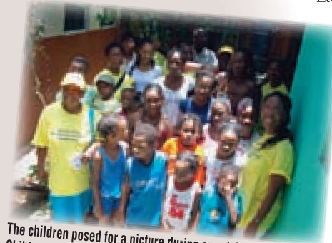
The children posed for a picture during our visit to the Children's Home.