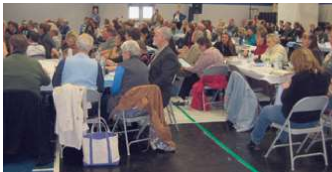
Church Works 2009 is an official meeting held by the Northern New England Conference for pastors and a mission-focused leadership team from each church or district.

As pastors and members shoulder their responsibilities to reach every person, the entire conference becomes a mighty team, working side-by-side . . .