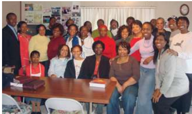
Twenty-one students were assembled at The Voice in the Wilderness for training to use the health message as God intended it to be used.

The training is organized to run as a 12-month program, where classes are held one weekend per month for 12 consecutive months. Classes include anatomy and physiology, gardening, canning, greenhouse—how to grow your own organic food at home, screening/blood analysis, nutrition/vegetarian cooking, herbology—studying of herbs and their use in the prevention and treatment of diseases, reading assignments, participating in a 10-day cleanse program, an internship at the wilderness, body/mind/spirit relationship training, home remedies, hydrotherapy, and more. To qualify, one has to have a personal relationship with Jesus Christ, have a burning desire to see others saved, and have a God-given passion for becoming a trained medical missionary.