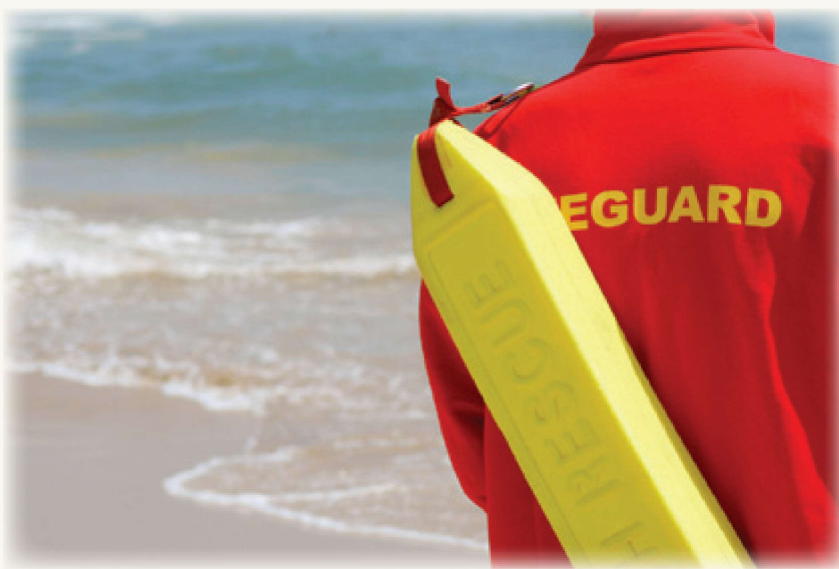
Lifeguards are constantly scanning the waters to insure that every swimmer is safe.

The author of the book GETTING IT RIGHT (p. 69) shares some ideas on what the characteristics of those who