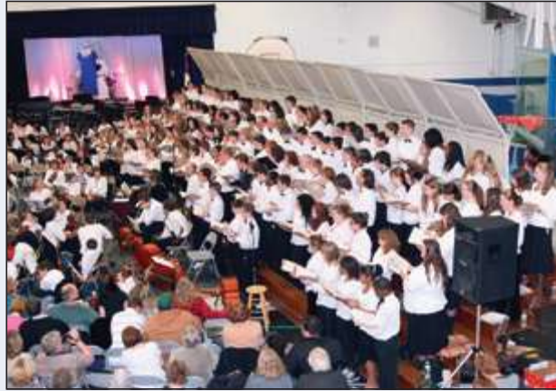
About 300 students attended the 29 th annual music clinic at Pine Tree Academy.