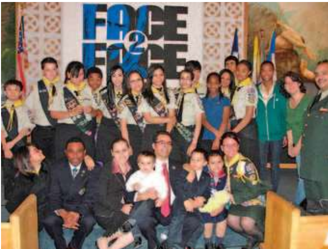
Greater New York Conference Adventist Youth and Pathfinder coordinators in upstate New York, along with the local church directors, sponsored a Hope and Health Rally on April 24 at the Middletown Seventh-day Adventist Church.