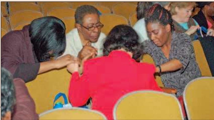
A special prayer and sharing time took place during the afternoon program at the one-day retreat sponsored by the Southern New England Conference.

Photos of the one-day retreat can be viewed online at: www.sneconline.org . Click Dept./Ministries and look for the Women's Ministries link.