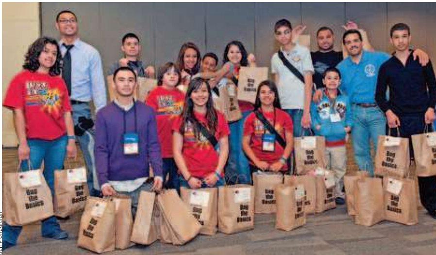
Children prepared bags to be distributed to people in need during the “Just Claim It 2” Youth Prayer Conference.