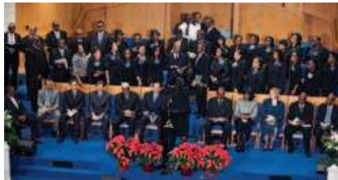
The North Bronx Seventh-day Adventist Church Choir.