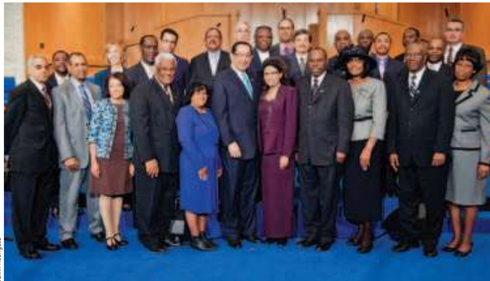
Greater New York Conference administrators and departmental directors with representatives from the Atlantic Union Conference.