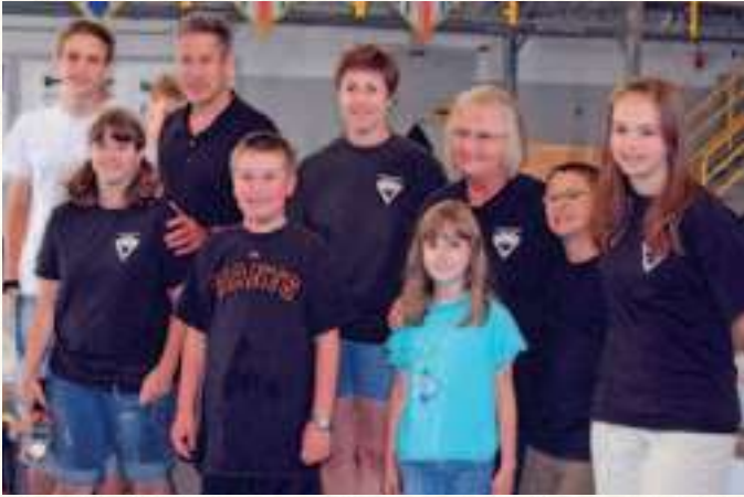
The Central Vermont Regiment Pathfinder Club assisted in stuffing care boxes that were sent to the troops in Afghanistan.