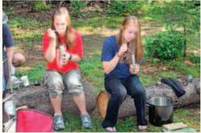
The Pathfinders spent one weekend living in similar conditions as the troops. They built their own lean-tos and ate Meals Ready to Eat.

sending. To me it seems that your letters always come just when everyone needs a pick-me-up. Your last letters arrived here just after we lost two of our soldiers in action. Your kind words, Scripture quotes, and reminder of the good things of home, I believe, helped everyone through that trying time. I cannot tell you how much they helped.