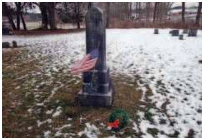
Tioga County church members placed wreaths on the graves of veterans at the Broadway Cemetery.

Wreaths Across America was formed as an extension of the Arlington Wreath Project. The Arlington Wreath program was started by Morrill Worcester (Worcester Wreath) in 1992