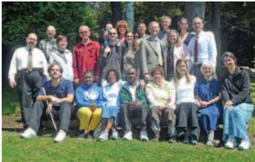
Twenty-one deaf campers enjoyed the fourth annual DEAF Camp hosted by the Southern New England Conference and held at Camp Cherokee in New York.

Many do not realize that deaf people are the largest unreached population worldwide. American Sign Language (ASL) is the third most used language in North America, where there are approximately two million deaf people. Yet, just two percent of deaf people claim to know Jesus as their Savior.*