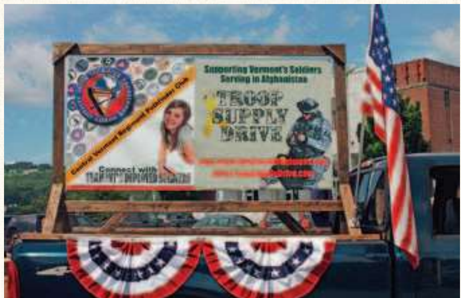
This banner was used in a parade to promote the Central Vermont Regiment Pathfinder Club's project of sending cards and letters to the troops and the VFW's project of sending care boxes to the troops in Afghanistan.

Now stop for a minute and do the math—1,500 soldiers are each receiving a letter and a card each month for approximately 10 months. That's 3,000 pieces of mail each month and a total of 30,000 pieces of mail for the deployment period. It's amazing what God