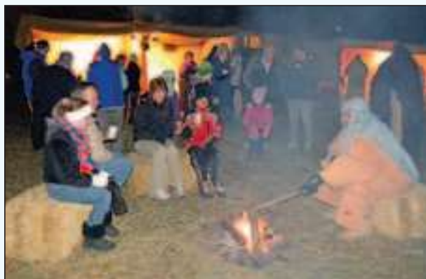
Visitors warm up by the fire before visiting the eight shops that are part of the Foxboro Seventh-day Adventist Church’s annual Christmas program.

The program, dubbed a Walk through Bethlehem/Live Nativity, was started in 1997 and with the exception of taking one year off and being snowed out another year, church members and friends have bundled up every year and enjoyed presenting what they know to the public.