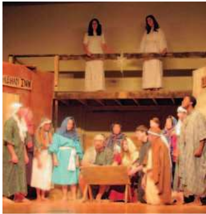
Union Springs Academy students reached out to the community by presenting “Bethlehem’s Big Night,” a play about the birth of Jesus.

As the students spent time practicing and imagin-