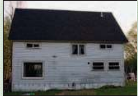
The Pathfinders helped to paint the home of a soldier who was deployed to Afghanistan before construction on his home could be completed.

"I want to take a moment to send a quick word of thanks to you and your Pathfinders for the great letters of encouragement that you have been