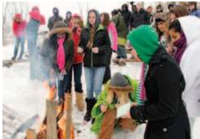
Union Springs Academy students walked in the snow to experience some of the conditions under which homeless people live.

sleep for the night. They also watched several short videos of Haiti. Some students indicated that ADRA Famine was difficult for them because they couldn't eat for 24 hours. They also were not allowed to bring their cell phones.