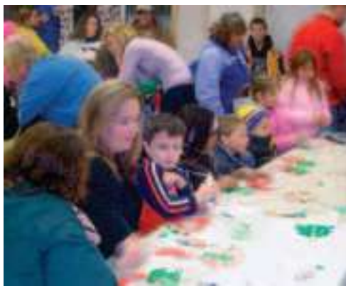
The Vacation Bible School team from the Perrysburg church provided crafts for the children. More than 60 children participated.

Members of the Perrysburg Seventh-day Adventist Church in Perrysburg, New York, were surprised one Monday morning in December 2010 to find an article with a big, bold, color photo in the middle of the front page of the local newspaper showing church members singing carols on a cold wintery evening. The recognition in the newspaper occurred as a result of the church's