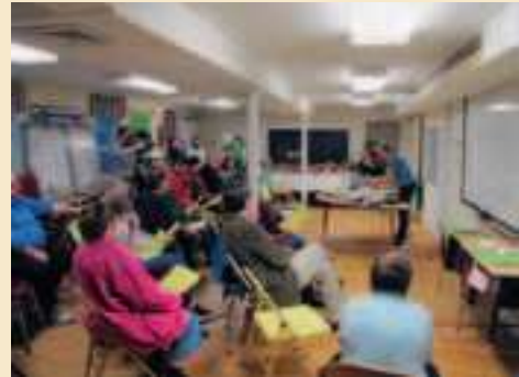
The St. Johnsbury church sponsored a four-part vegan cooking series. A camera crew from a local television station reported on two nights of the event.

Fourteen to 17 guests (all non-vegan) came each night and were surprised and delighted that vegan cooking could be so easy and taste so good. Creamy broccoli soup and oatmeal muffins were on the menu the first Monday night, and Special K loaf with mashed potatoes and garlic butter, the second. The News 7 crew from Lyndon State College came to cover this culinary extravaganza on night one, and returned on night three to report on (and taste) tomato bisque soup, Greek salad, and banana date cookies. The resulting two news spots were friendly and interesting.