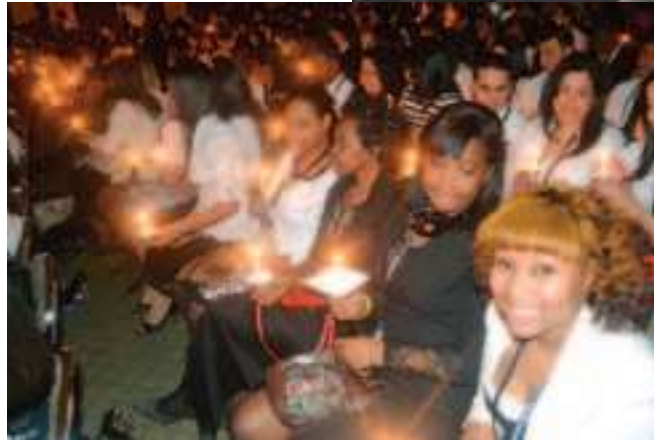
About 510 candidates were dedicated before beginning their year-long training in nine areas of ministry.

There were many highlights during the congress. One of the most vivid occurred in the halls of the hotel during free time. Groups of young people could be heard and seen singing and praying throughout the hotel lobby and halls. This was a spontaneous action and was