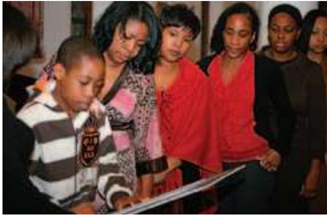
Restoration Ministries charter members sign the official book that records all members who were present for the church organization service.

Restoration Ministries Seventh-day Adventist Church in Southampton, Bermuda, was organized on January 22 as the eleventh church in the Bermuda Conference. They began as a group of young adults who were concerned about a growing number of missing members. By early 2004 they started to meet regularly to discuss how they could make a difference. The consensus was to start a ministry to reach out to these missing members and those simply looking for the love of God. After much discussion, organizing, and prayer, Restoration opened its doors as a ministry for the first time on October 23, 2004. On January 15 the Bermuda Conference assigned Ulric