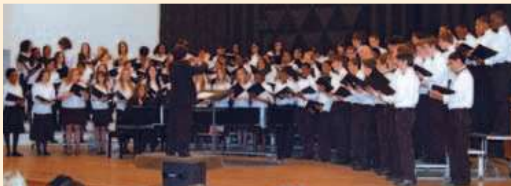
Following three and a half days of rehearsing, the 110 academy students who attended the music clinic presented a concert on Saturday night in Machlan Auditorium on the campus of Atlantic Union College.