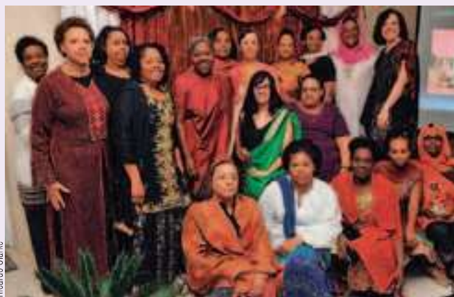
Celebrating their cultural diversity, the Bermuda Conference Women's Ministries Department hosted an event called "Women Around the World."

The third stop was at the Warwick Seventh-day Adventist Church, where India was the country of focus. Guests were greeted at the door by smiling members dressed in Indian attire and they were treated