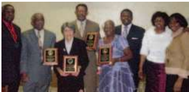
Pictured are some of the seniors who were honored at the first senior banquet hosted at the Mt. Sinai church. Thirty-two seniors were honored.

The senior members of Mt. Sinai Seventh-day Adventist Church in Queens Village, New York, were honored at the church's first annual senior banquet. The church's seniors are champions who advocate and support causes for the greater good of others. Honored were 32 men and women who reminisced about the