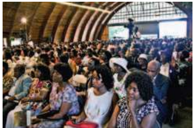
The pavilion at Camp Victory Lake in Hyde Park, New York, was filled to capacity for the afternoon ordination service.