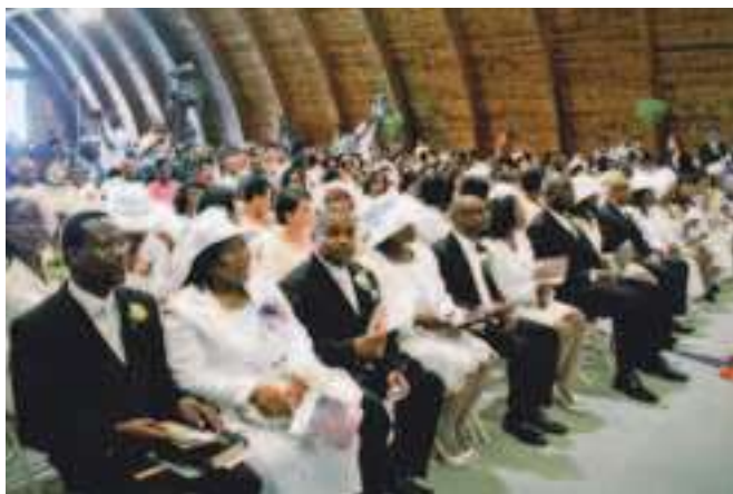
The five candidates for ordination seated with their spouses during the ordination service.

retary, reminded the candidates that “Ordination is not about position, but mission! It is not about fame, but faithfulness!”