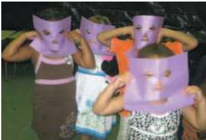
The children were involved in different types of activities to make the time interesting and fun.

—Gerard Zavaski, member, Cape Cod church