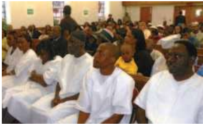
As a result of individual decisions to follow Jesus all the way in baptism, a total of 16 newly-baptized members were added to the Wakefield church.