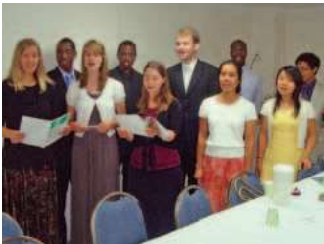
Ten members of the Light America Mission Youth Challenge team gave a mini-concert on July 9. The team of literature evangelists working with the Review and Herald Publishing Association and the Southern New England Conference, were in Rhode Island for 10 weeks.