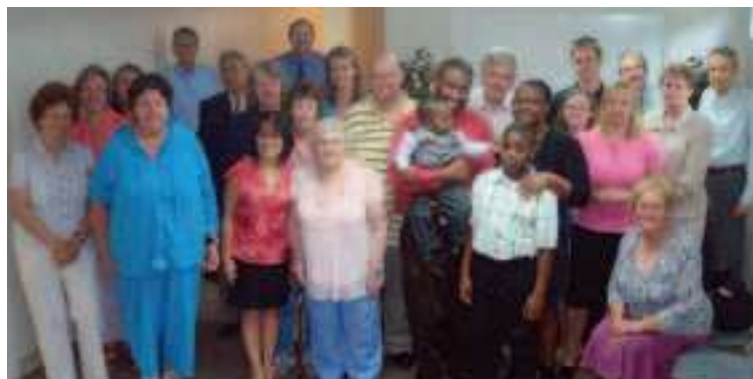
Some of the members and friends of the Wickford church stand in a newly-remodeled and enlarged room in the basement.

to be done were between $145,000 and $160,000. The church had about $15,000 available. Insurance would help, but it wouldn't cover the $15,000 to $30,000 expense of a new septic system (the flood had accelerated deterioration of the existing system). Neither did it cover the cost of preventing future flooding ($15,000 was one of the reasonable bids). The insurance also includes a $25,000 deductible. So the church needed to raise between $40,000 and $55,000—an impossible goal, it seemed.