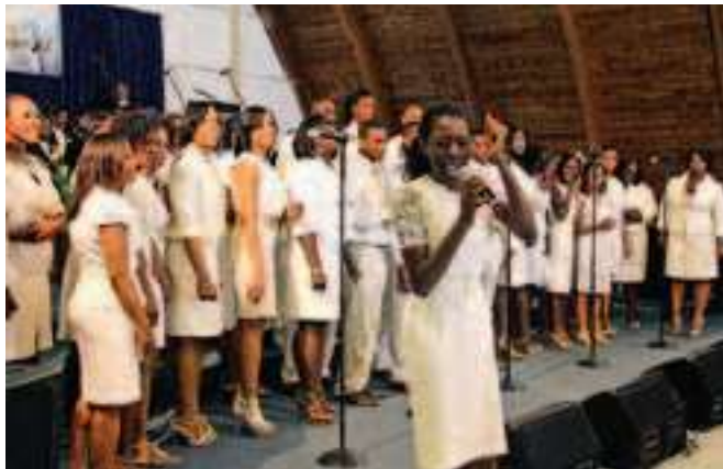
The group Divine Praise from the Lebanon Seventh-day Adventist Church sang during the ordination service.