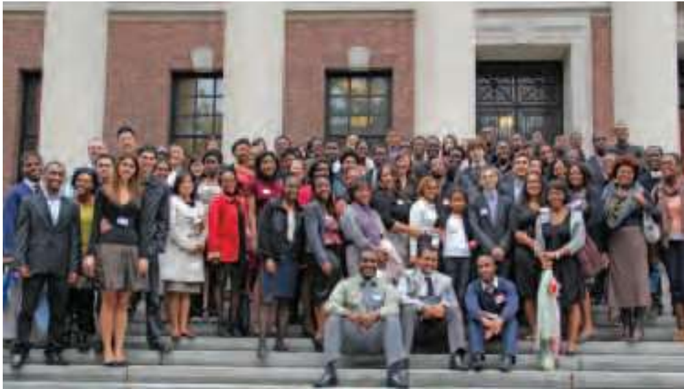
Students from more than 30 universities in the greater Boston area attended the second annual Collegiate Summit hosted by Campus Hope Fellowship, a ministry of the Boston Temple church.

Students from more than 30 universities in the greater Boston area attended the second annual Collegiate Summit on the campus of Harvard University in Cambridge, Massachusetts, on the first weekend in October 2011. The event began with Friday-night vespers, and concluded with an evening social at Boston Temple church on Saturday night.