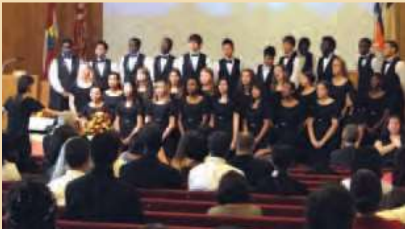
The Union Springs Academy Choir sang during the worship service at the Bay Knoll church as part of the annual Adventist heritage commemoration.