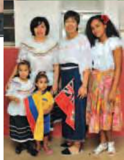
These individuals were among those dressed in native attire who participated in the parade of nations.