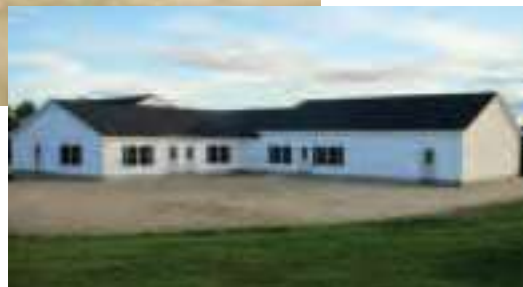
The exterior of the building is complete and work has commenced on the interior. The plans are to complete the project by spring 2012.

vice lives and needed to be replaced simultaneously.