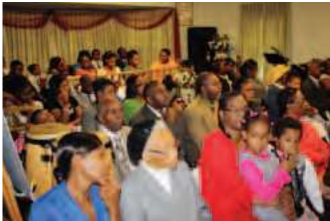
Attendance for the weekend numbered in the hundreds, with every seat taken and standing-room only.