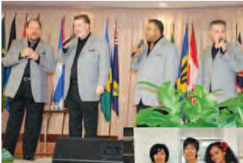
The King’s Heralds Quartet sang in concert during the Fall Fest event.

Citing John 12:24, the president issued his terse rallying cry to Christians facing Jesus’ imminent return: “Greatness is allow-