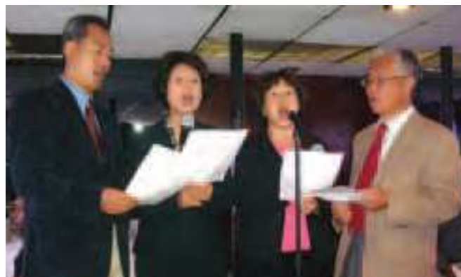
A Korean quartet was among the groups that provided entertainment on the cruise.

The hours went by swiftly with entertainment by