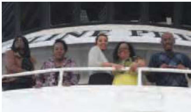
Members from the Greater New York Conference participate in a dinner cruise hosted by the Family Ministries department.