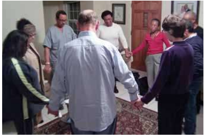
Warwick members meet in small groups and are trained to be effective group leaders.

The group is diverse in age, backgrounds, and gifts. Yet, immediately, they realized that if new believers were to experience family unity within the church, the group must experience it first. Members have traded personal barriers of accountability and discomfort, for dedication, to allow the Holy Spirit free reign in their lives. They have opened the doors