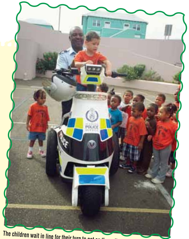
The children wait in line for their turn to get on the police tricar.