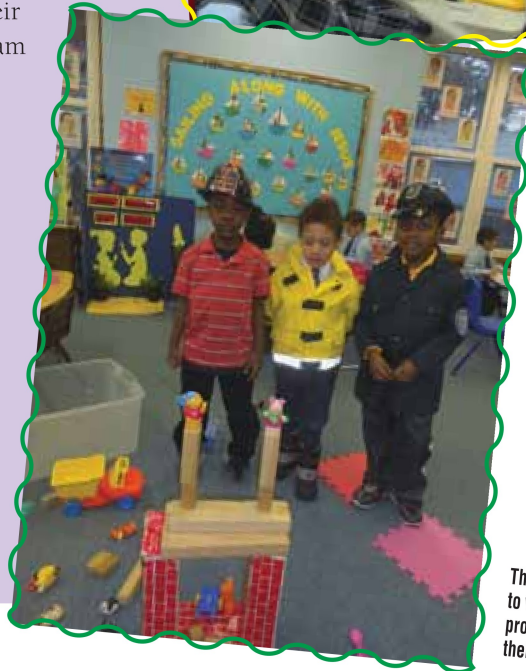
The children learn to work together to protect and build their community.