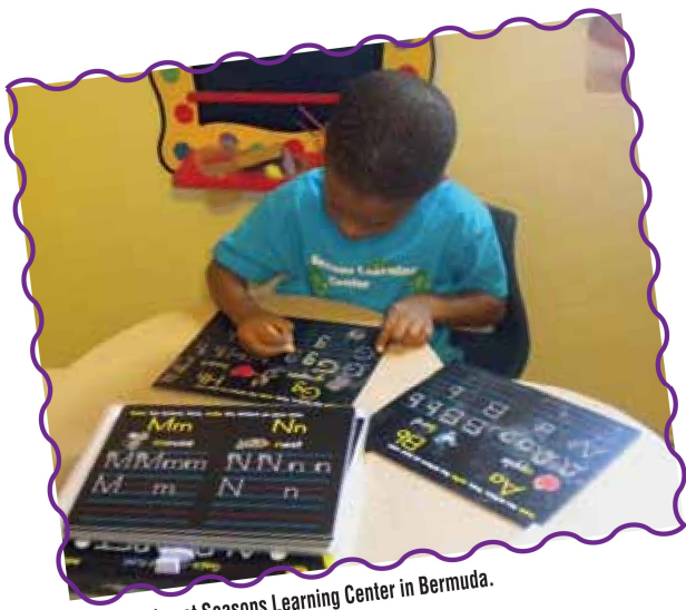
Busy learning at Seasons Learning Center in Bermuda.

These are just a few examples of the learning that is taking place in pre-kindergarten centers. The children are being taught in simple language that we all must be obedient to our parents and to God. They are also learning that, although they may be small, they matter and they too can make a difference to hasten Jesus' soon return. "It is during the first years of a child's life that his mind is most susceptible to impressions, either good or evil. During these years decided progress is made in either a right direction to a wrong one"—CHILD GUIDANCE, p. 193.