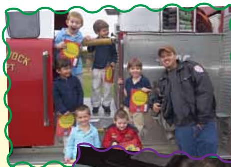
The children on the fire truck during their visit to the firehouse.