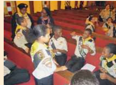
Worcester Doves of Peace Pathfinders take a break during the Bible Bowl event at the Worcester church.

At the end of the day, the Worcester Doves of Peace were victorious, winning the first place award. They learned to work