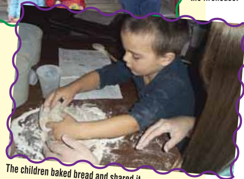
The children baked bread and shared it.