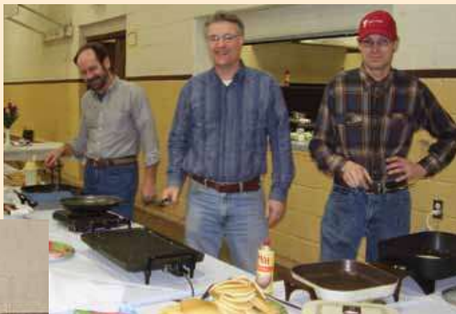
▲ The men who attended the Kingsbury church prayer breakfast took care of cooking the pancakes and vegetarian sausages.