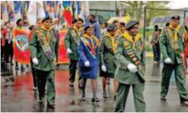
Pathfinders from five states in the Atlantic Union participated in the annual Northeastern Conference Pathfinder Parade, held this year in New Bedford, Massachusetts.

About 1,500 Pathfinders, Master Guides, and Adventurers converged in New Bedford, Massachusetts, on Sunday, April 21, for Northeastern Conference's annual Pathfinder/Adventurer Parade and Fair. The attendance made a rainy day come alive as bus loads of standard-bearing "sol-