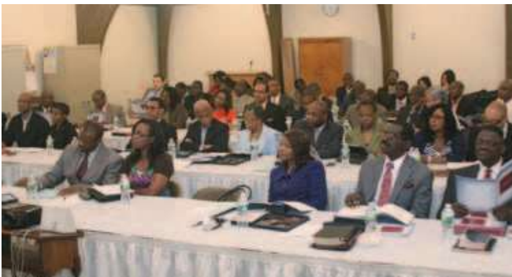
Pastors from the Greater New York and Northeastern conferences, along with their wives, and the office staff attended the Prepare Enrich one-day certification program.