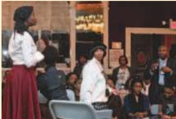
More than 149 students attended the fourth Medical Missionary Training session.

"The folks leading out in the training are not only academically quali-