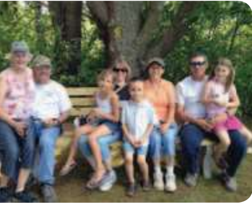
Some of the walk-a-thon participants are resting on one of the benches placed along the trail.

opportunity to hold individual or group walk-a-thons in one's own area. Some of the goals of this event were to spotlight the 15 mission