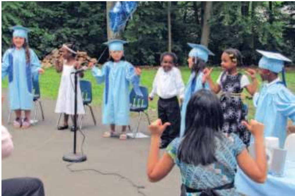
An important milestone for Laurel Oaks was the first kindergarten graduation and pre-kindergarten promotion.