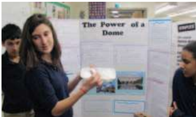
Students in all grade levels at Laurel Oaks school participated in the annual Science Fair.