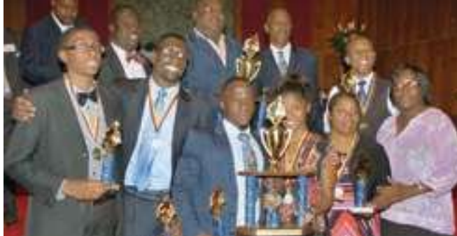
Bible Bowl Senior Division team winners.

All of the teams represented Northeastern Conference in exceptional fashion. Through the leadership of