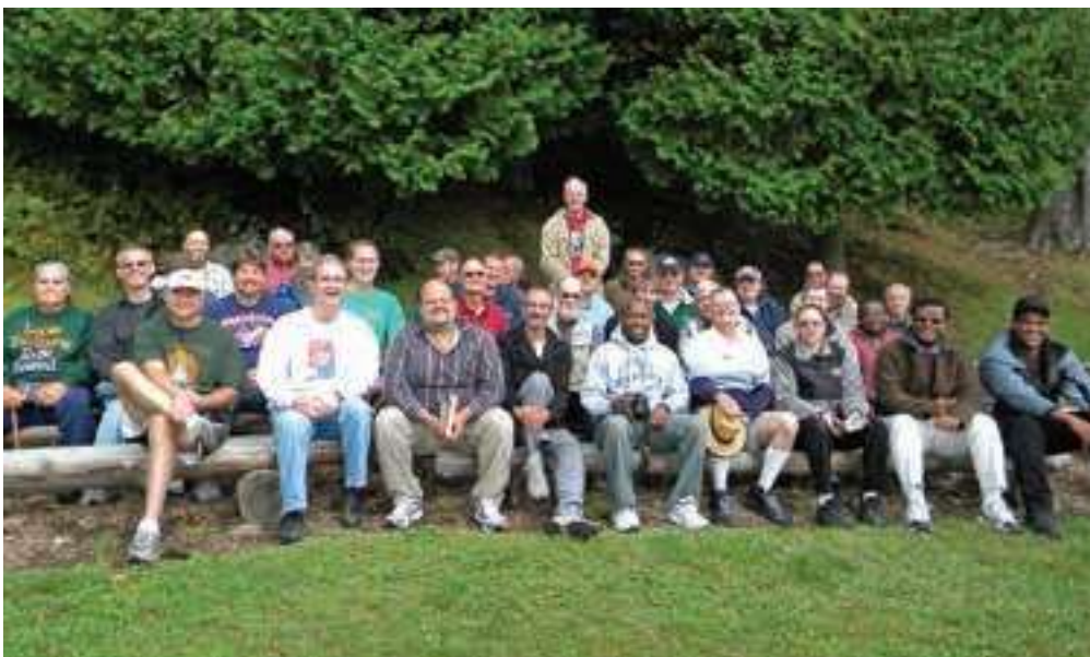
Men from around the New York Conference attended the men's retreat at Camp Cherokee in Saranac Lake, New York.