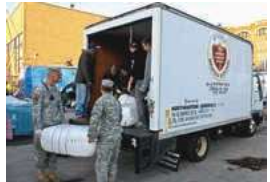
Academy students receiving assistance from the National Guard to load supplies onto an Adventist Community Services truck.