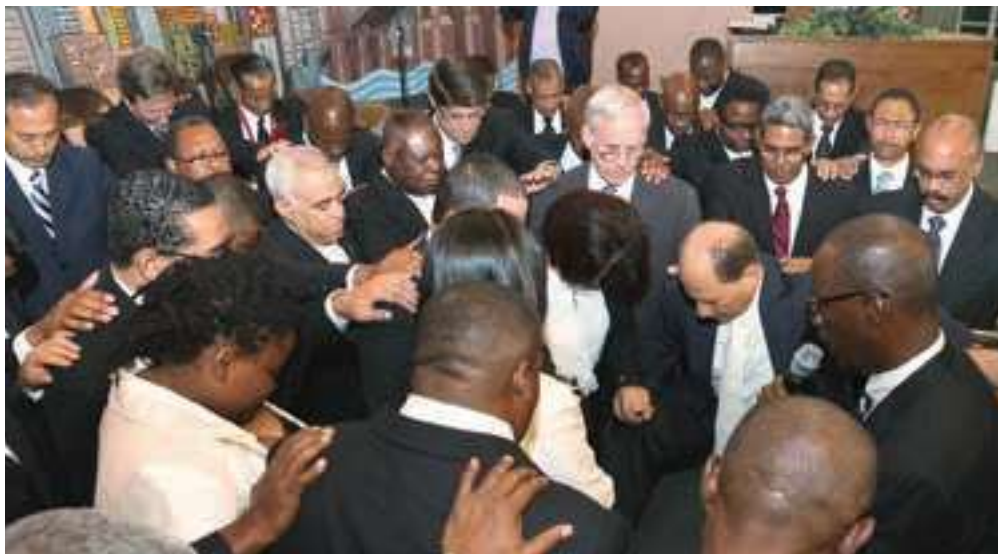
Pastors and church leaders lay hands on the three candidates as they offer a prayer dedicating them to service in the gospel ministry.