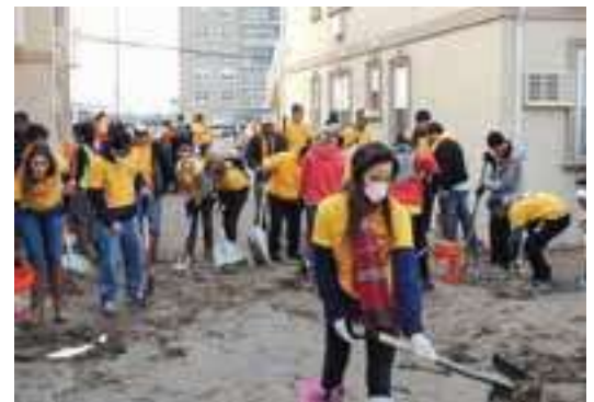
Members of the Adventist Youth Emergency Services Corps helping with the clean up.