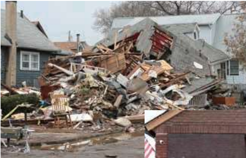
▲ Some homes were completely destroyed by Hurricane Sandy.

Reaching out to victims of Hurricane Sandy