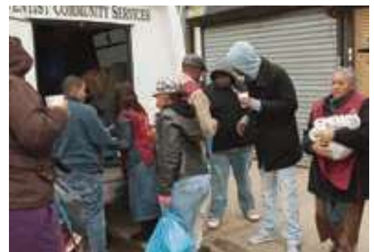
Greater New York Adventist Community Services van out on the streets distributing much needed items.