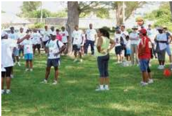
Walkers from Shelly Bay (East End) prepare to begin the 4.5 mile track to the Arboretum finish line.

The Let's Move Day event developed from an initiative by Michelle Obama to improve the health of children in the U.S. The North American Division set aside a day in September as Let's Move Day . Bermuda's event was a collaboration between the Seventh-day Adventist Church, the Bermuda Government Department of Health, the Well Bermuda Partners, and a number of local sponsors, including Barritt's, Lindo's, and Rubis.