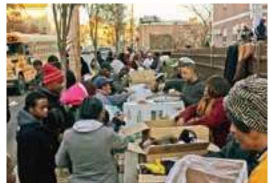
Northeastern Conference workers and volunteers distributing food, clothing, and other items.