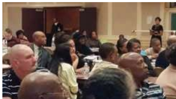
The Breath of Life and Jefferson Avenue churches hosted a prophecy seminar on Daniel and Revelation at a school in the local area.

—Communication Staff, Breath of Life church