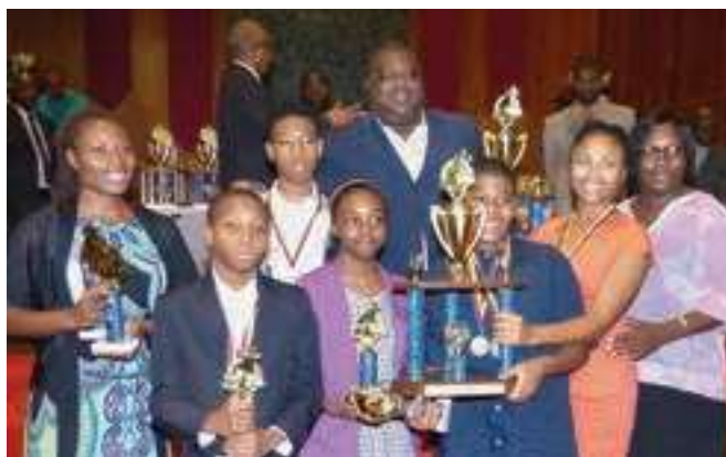
The Junior Division team was undefeated in all their games at the BAYDA Bible Bowl Nationals.

The annual event is a grand undertaking in which about 350 players, 33 teams, more than 40 coaches, and 10 conferences participate.