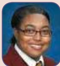
Xe'na Daé-Chauntaé Simons Bermuda Institute in Southampton, Bermuda