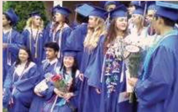
Union Springs Academy graduates following graduation on June 2.

During a vespers program on Sabbath evening, graduates also