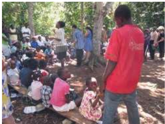
The children attend Vacation Bible School outdoors in Trou Chouchou.