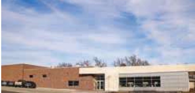
The exterior of AdventSource's new facility.

AdventSource employees, board members, and friends gathered on April 17 to celebrate the grand opening of AdventSource's new building located on the campus of Union College in Lincoln, Nebraska.