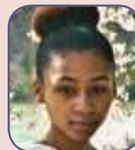
Victoria Williams Northeastern Academy in New York, New York