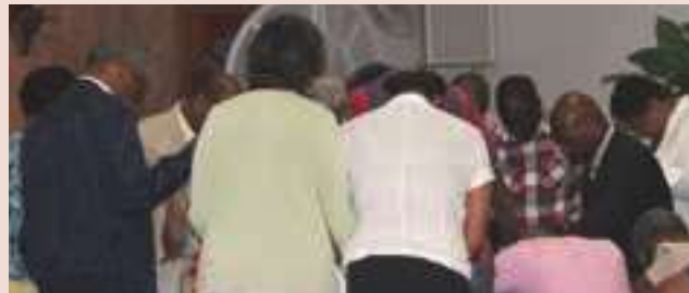
Members participate in an all night prayer session on behalf of Bermuda.

Members were encouraged by personal testimonies about answered prayer and God’s faithfulness. The group petitioned God on behalf of a member’s request while laying hands on that member who