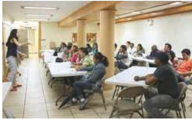
Students attending English as a Second Language classes at the Port Washington church.

As a part of their practicum students were told they could voluntarily participate in a lecture series at the Manhattan