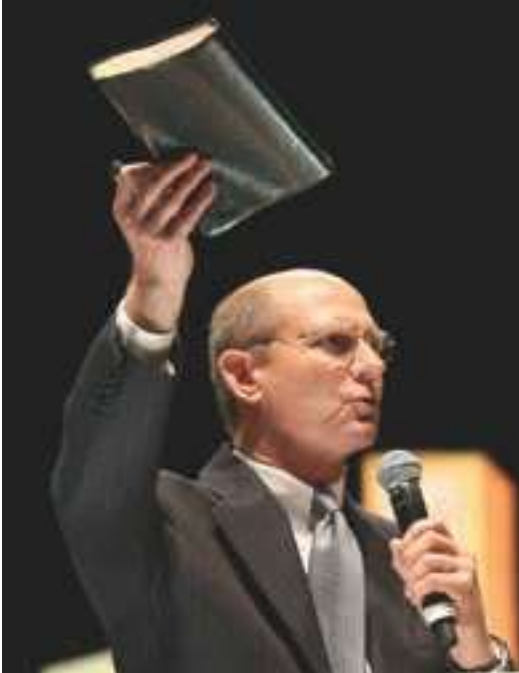
Ted Wilson, Seventh-day Adventist World Church president, speaking for the worship service.