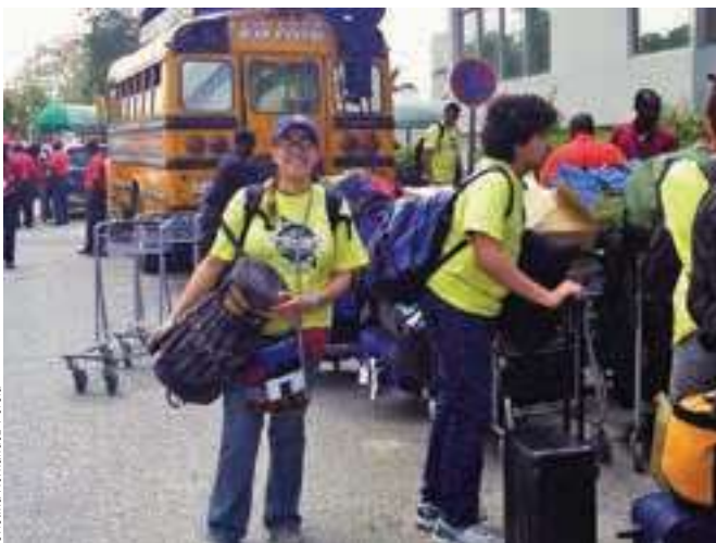
The Missionary Impossible team members arrive in Haiti.