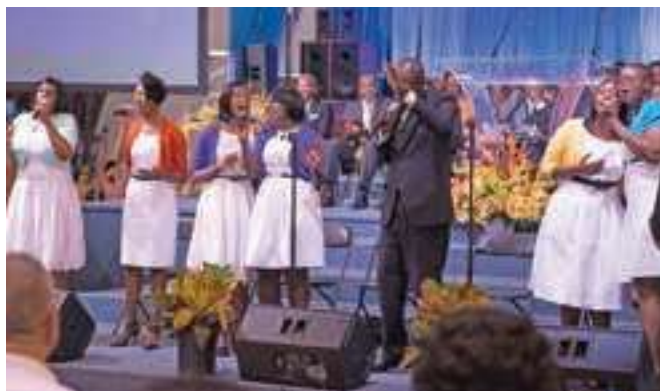
The camp meeting praise team.