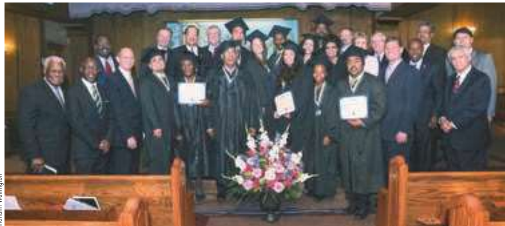
NETS graduates with administrators from the Bermuda, Greater New York, and Northeastern conferences, and the Atlantic Union, the North American Division, and the General Conference.