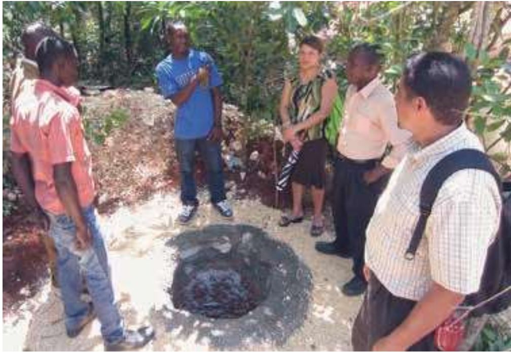
Churches in the Southern New England Conference donated money for the well that is being dug for a village in Trou Chouchou, Haiti.

Some youth shared that they were considering