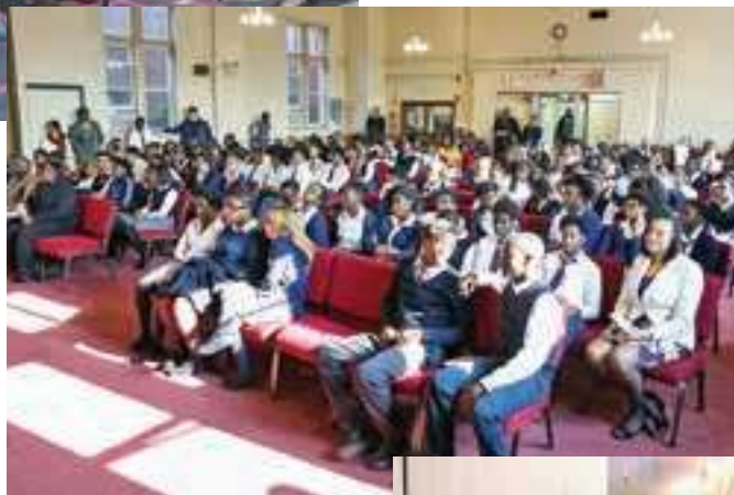
Greater New York Academy students attend an assembly and learn about the work ahead for the renovation of the school.

Academy, speaking about the December 3, 2013, groundbreaking ceremony held at the school. This event marked the beginning of what is estimated to be a 12- to 18-month renovation of the Greater New York Conference high school,