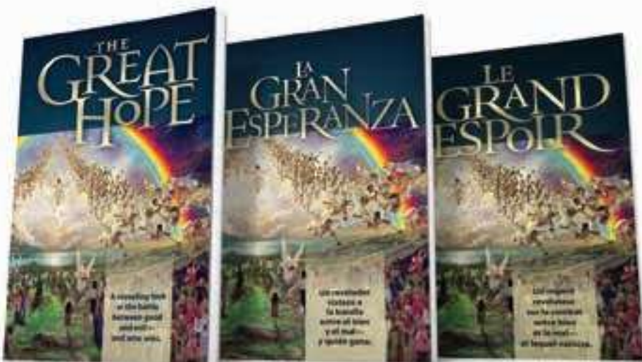
Of the 142 million copies of THE GREAT CONTROVERSY shared around the globe, 26 million were digital downloads.

Phil is the kind of guy who loves the outdoors more than sitting in a chair reading. “I never read a com-