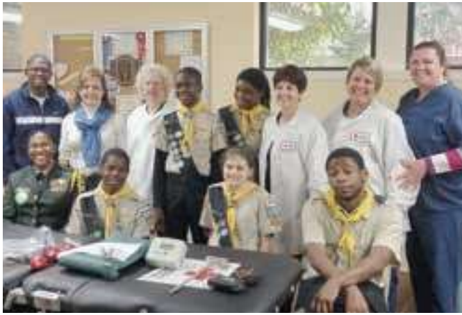
Framingham church members sponsored a blood drive, in collaboration with the American Red Cross, and Pathfinders helped to distribute information on wellness.

In December, the church showed appreciation to two police officers—the chief of police of Framingham and a police lieutenant of Ashland.