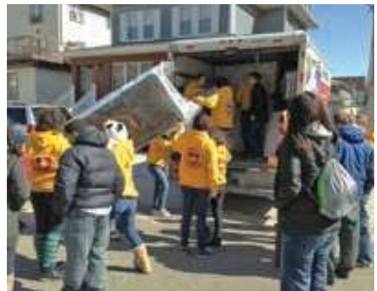
Adventist Youth help the Far Rockaway residents get back on their feet after Superstorm Sandy devastated the area.

VISITOR, social media using Facebook and Twitter, an NY13 App, e-newsletters, live broadcasts on Hope Channel and 3ABN, and live streaming with AUAM (Atlantic Union Adventist Media) and Praizevision.