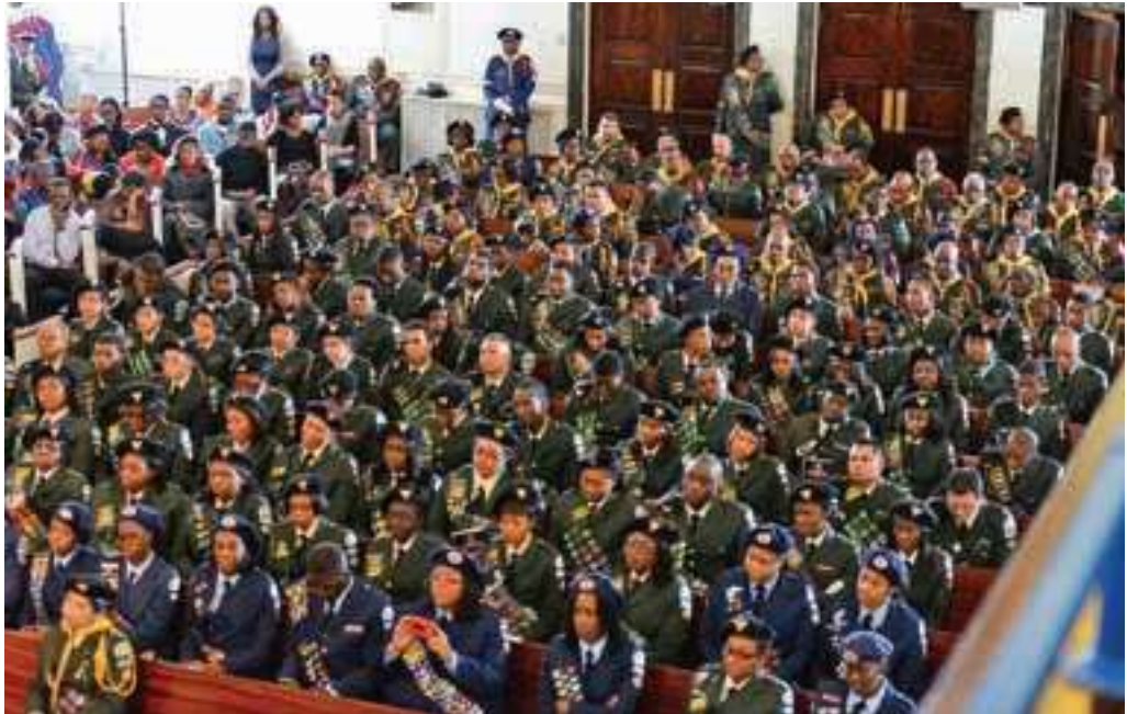
Investiture candidates fill the pews at the Youth Leadership Investiture Convocation in Hartford, Connecticut.