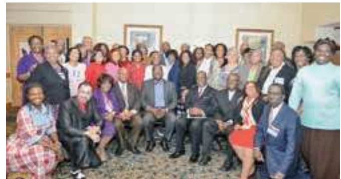
Northeastern Conference administrators, seated center, take time to pose for a photo with Bible workers who served during the NY13 evangelistic campaigns.