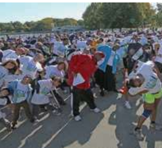
Adventists are preparing to walk in Flushing Meadows Park on Let's Move Day 2012.