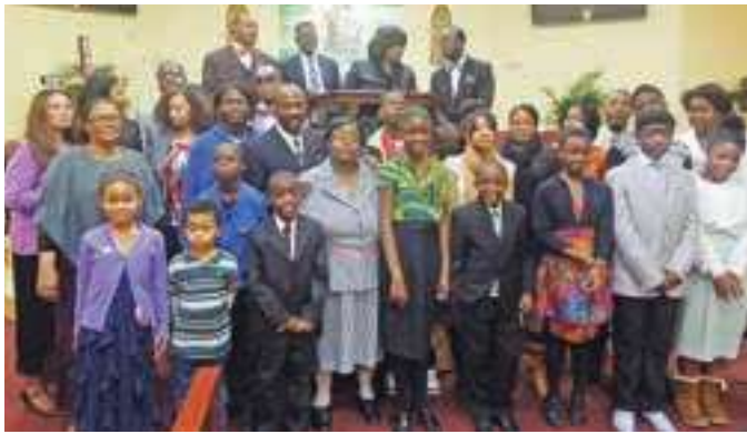
Solid Rock church celebrates its newest members who were baptized during The Gospel Renaissance Revival meetings.