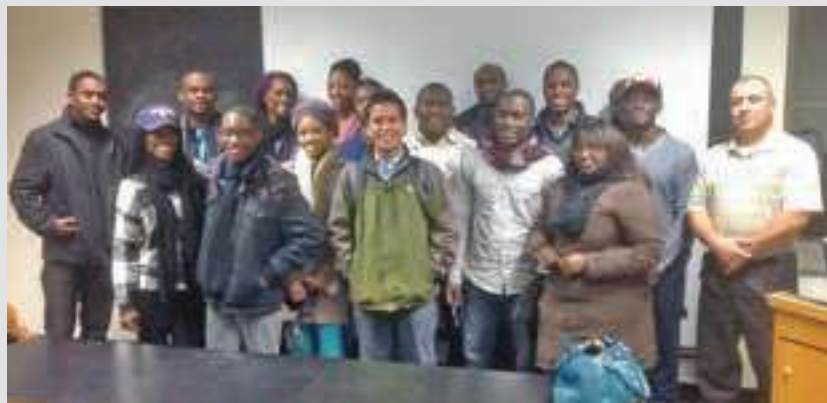
This Adventist Christian Fellowship group reaches out to their classmates on the Syracuse University campus.

Our topic of study that night was the importance of prayer and eight factors that can make our prayer life more effective. The ACF group is doing more than having worship services on Friday night; they are