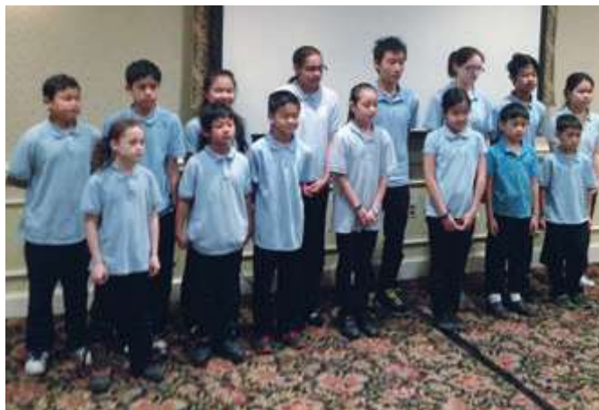
Karen students attend Utica International Seventh-day Adventist School, the first school in New York Conference established to educate Karen students.

Her mother remarried, her new husband was not