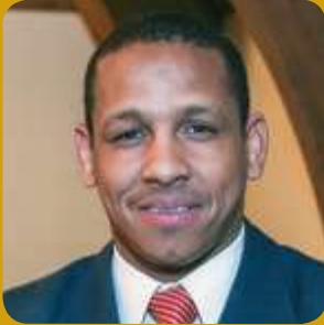
Bianel Lara Publishing