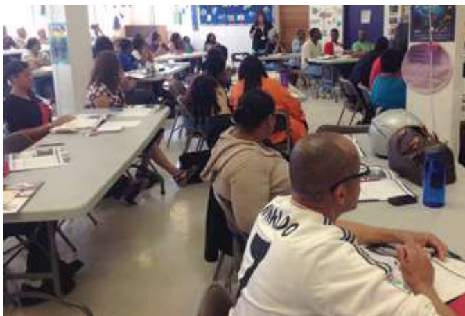
Members from around the Bermuda Conference, along with people from the community, take part in the SCARS training at Devonshire church.