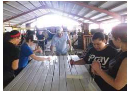
Missionary Impossible volunteers prime an exterior panel before putting it on the frame.

God and telling Him, "If it's your will, I will preach even if it's not on a pulpit." He gave me the chance to witness for Him and I knew I couldn't turn down that privilege.