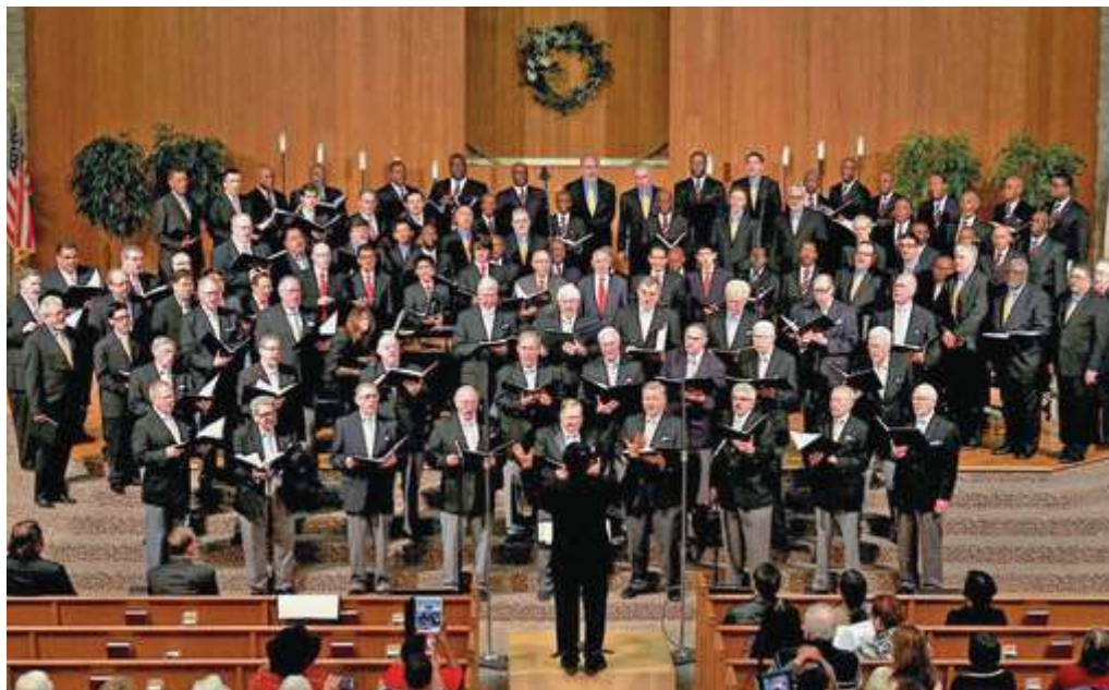
Five Christian choruses, including the Hanson Place Men's Chorale, participate in the Spring Men's Chorus Festival at the Hinsdale church in Illinois.

While it must have been a blessing to witness and be part of more than 109 men praising their Creator and Savior, beyond the shadow of a doubt, this will in no way compare to singing in that great chorus