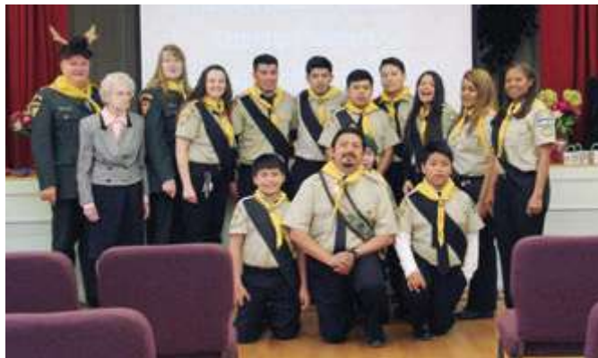
The Portland Alpha and Omega Pathfinder Club has eight members and lots of supporters.