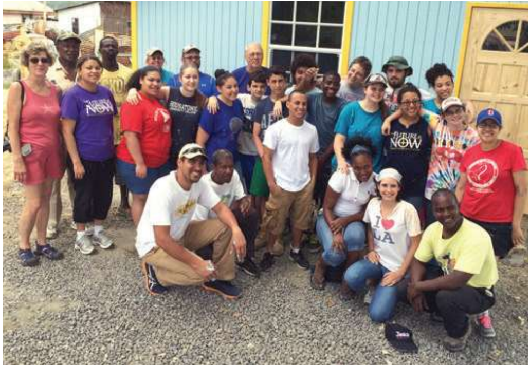
The Missionary Impossible group from Southern New England Conference built a house for a family that was displaced by fire three years ago.

Personally, I found that my biggest blessing came from preaching, because I felt uncomfortable and had to trust that God would guide me to do His will above my own. It wasn't until I was standing at the pulpit that I realized He had planned every step of this trip for me. I wasn't supposed to preach, but I remember praying to