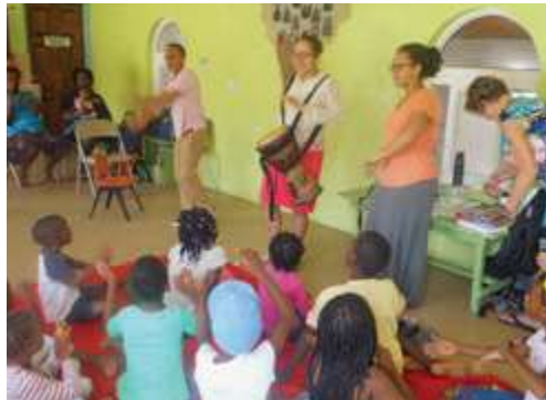
The youth lead out by singing songs at the Vacation Bible School held during their mission trip to Portsmouth, Dominica.