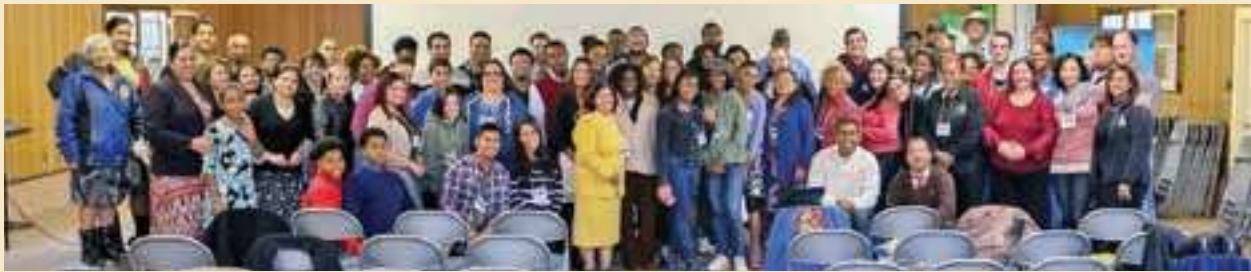
Participants at the Youth Bible Prophecy Training Weekend pause for a group photo.

The Greater New York Conference Youth Ministries Department held its first-ever Youth Bible Prophecy Training October 10-11, and organizers say it was a tremendous success. By 5:00 p.m. on Friday afternoon, the participants were already checking in at Camp Berkshire in Wingdale, New York, for this historic event. The par-