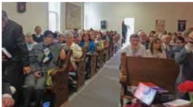
The Bordoville church in Vermont is filled to capacity for the 150 anniversary celebration.

On the Sabbath of the celebration though, the weather was warm enough that no heat was needed. The crowd present for the celebration overflowed the limited seating in the church and filled a tent that had been set up on the lawn, participating in the service via speakers