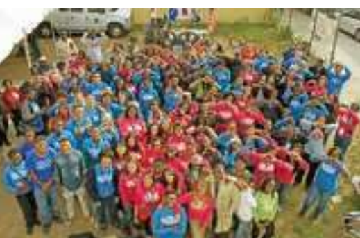
From top: Greater New York Conference Adventist Community Services workers and volunteers distribute much-needed items; Northeastern Conference workers and volunteers distribute food, clothing, and more; Youth from AYES (Adventist Youth Emergency Services Corps) help with the clean-up; and academy students from the Atlantic Union Conference offer mission service in Coney Island.

compassion rally, the Greater New York Conference Mission Trip group, and the Northeastern Conference iServe Movement. I am grateful to God for youth and young adults who have decided to model a now global movement of compassion by saying “We are the eyes, heart, hands, and feet of Jesus in New York City and its surroundings. That is awesome!”