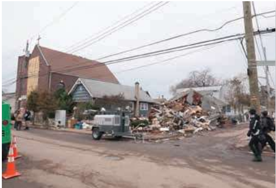
Hurricane Sandy left devastation in many places along the Eastern seaboard, including New York City.

Ministries director, said, "Our Atlantic Union Adventist youth and young adults were always there for New York City and the affected areas. They were mobilized to set up shelters across the city the night before the storm hit and have literally not left the area since. When television crews left the disaster area, as did the donations, and many of the volunteers, our youth and young adults stayed and continued to show compassion, embracing the affected communities through