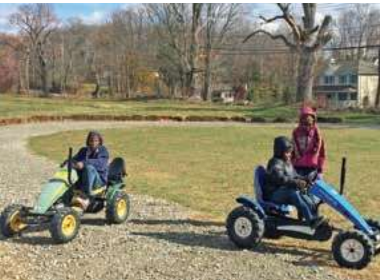
The children from the Spring Valley New Horizon Adventurer Club spend an afternoon on the farm riding pedal carts.