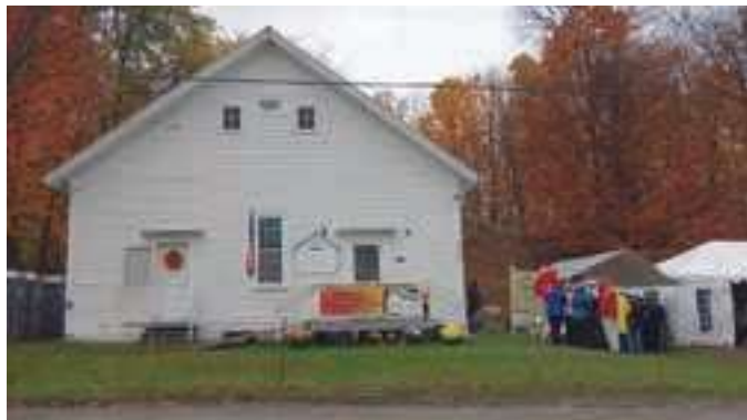
Members and friends commemorate the 150th anniversary of the Bordoville church in Vermont, the oldest known church that was built as an Adventist church.

The logistics planning was difficult, since there was no way of knowing how many people would attend. They