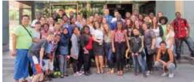
The American Youth Leadership Program participants pause for a photo during their visit to the Face TV television station.

The major focus of the presentation was a global topic of our choice that we