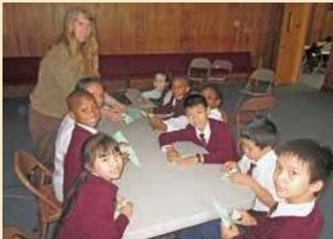
Students from all the classrooms at Bayknoll school meet at tables in the hallways to work in teams during game time.

The program is working well for everyone. Students love the sense of community that is achieved when everyone works together to