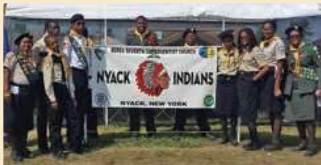
Some of the members of Berea church's Nyack Indian Pathfinder Club from Nyack, New York.

The Nyack Indians Pathfinder Club was able to represent their church, along with about 46,000 other Pathfinders from around the world. The Pathfinder club hosted four Pathfinders from England and one Pathfinder from Jamaica, West Indies, during the camporee. The Pathfinders learned