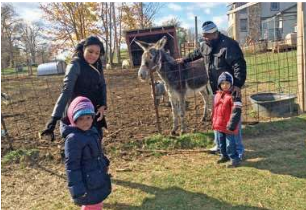
The children from the Spring Valley New Horizon Adventurer Club visit the animals at the Wright Family Farm in Warwick, New York.

The adults began to complain as well, but you had to admire the spirit of the children. They made the most of the trip and had a blast. Though the wind threatened to blow them away and their bodies shivered, they ran, they jumped, and they laughed. Despite the limited activities, they played, ate cake, and carried on as joy-