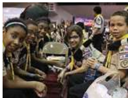
Connecticut Valley Pathfinder team