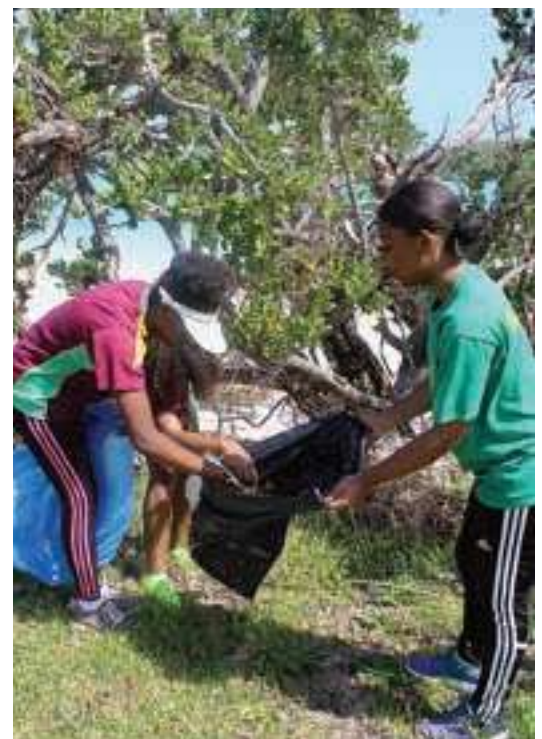
Adventist youth from public schools, as well as Bermuda Institute, took a day off from school and work to engage in various Compassion projects. Pictured are three Bermuda Institute students working to clear debris from Clearwater Beach and Cooper's Island Nature Reserve.