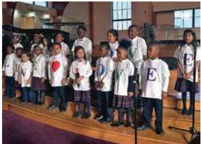
South Bay Junior Academy students participate in the Early Childhood Education Day program.