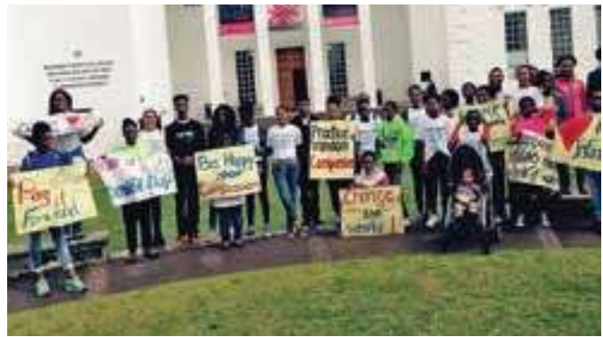
Young people stand holding signs in front of Bermuda City Hall and Arts Center in Hamilton.

The rain came and went and smiles never left the faces of the young people as they shared flowers and cards of encouragement with the people from Somerset on the western end of the island to St. George’s on the eastern end of the island. They sang songs with seniors and offered prayer with strangers. The youth helped to attract pedestrians to the health screening table in the Washington Mall, a major shopping and business complex in Hamilton, the capital city of Bermuda. At the table, professionals conducted health assessments and encouraged people to live healthier lives.