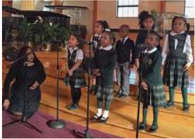
Hanson Place students participate in the Early Childhood Education Day program.

Early childhood programs are often a means for churches to generate additional revenue. Alvarez also sees this as a ministry and a prime opportunity for a much loftier goal. “It is evangelism in its simplest