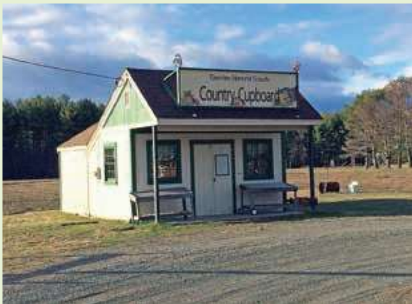
Riverview school in Norridgewock, Maine, has been producing vegetables on the Country Cupboard Farm and running a roadside farm stand.

Country Cupboard Farm is a name more and more people in Maine are recognizing and connecting to Adventist education. Riverview school in Norridgewock, Maine, has a fair amount of farmland that belongs to the school, and for many years they have been producing some vegetables and running a roadside farm stand.