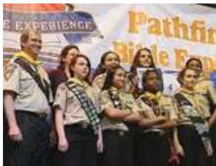
Merrimack Valley Pathfinder team