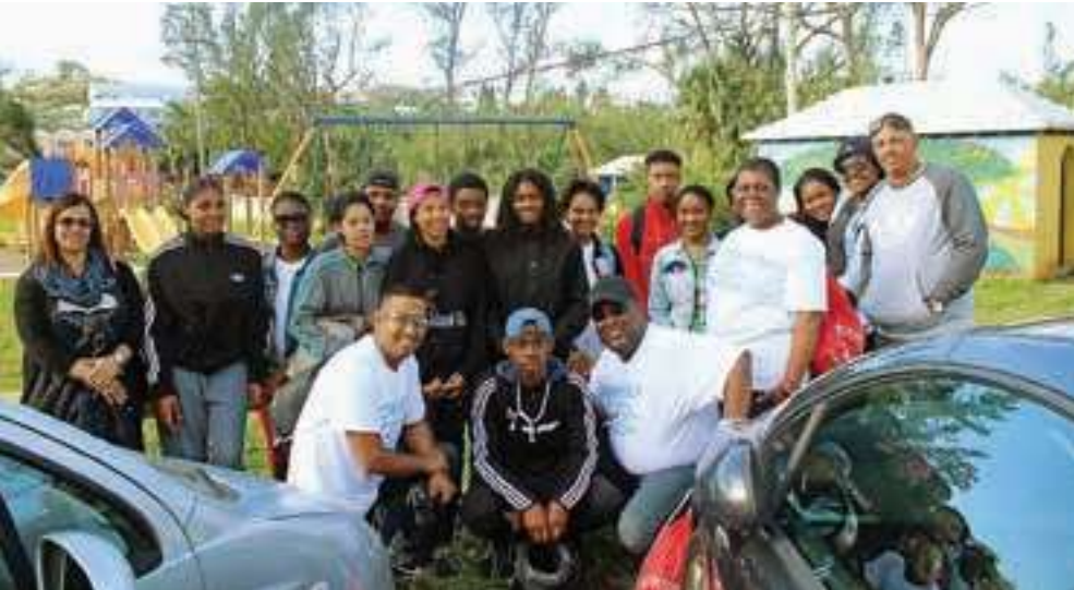
Students and staff from Bermuda Institute and church members from Adventist churches in Bermuda teamed up with guests who flew to the island to take part in Compassion 2015. The group pictured visited the Victor Scott Primary School, one of two school project sites, to read to students, give teacher support, and organize storage rooms.

T he Bermuda Conference celebrated its third annual Compassion event on the weekend of March 27-28. Thirty people from the Atlantic Union Conference left their homes on the east coast of the United States and traveled to Bermuda to accompany more than 230 local youth and young adults in spreading compassion throughout the island.