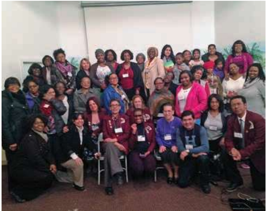
Members from 22 Greater New York Conference churches participated in a meeting to learn how to have a vibrant Vacation Bible School.