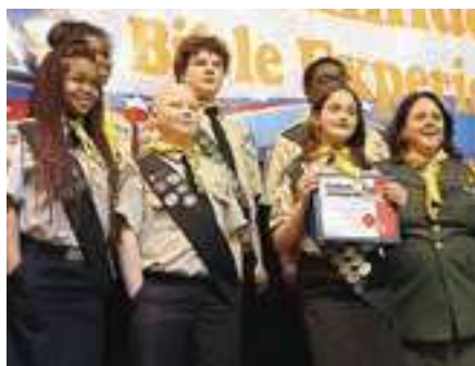
Rockville-Tolland Pathfinder team