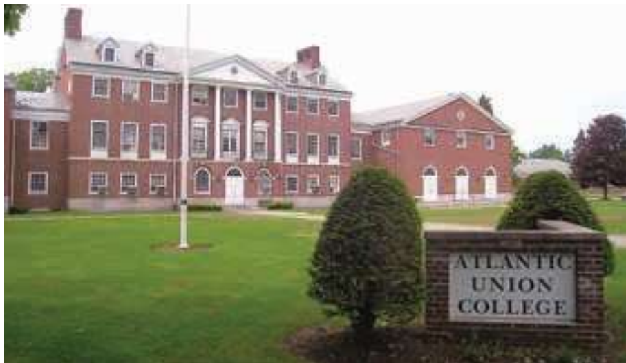
Haskell Hall, the administration building, on the campus of Atlantic Union College

The national accreditation will allow eligible students for federal financial aid to use that award toward their tuition costs. As an alternative, the students attending Atlantic Union College and requiring financial assistance will be able to participate in the college's payment plan.