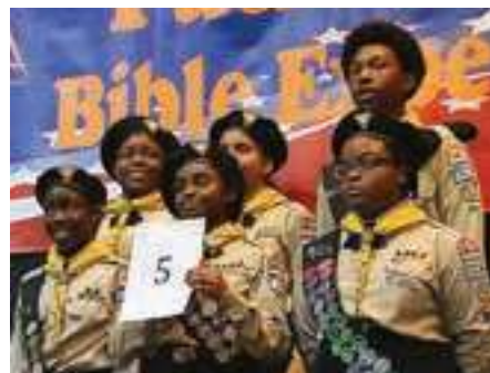
Worcester and Northboro Pathfinder teams