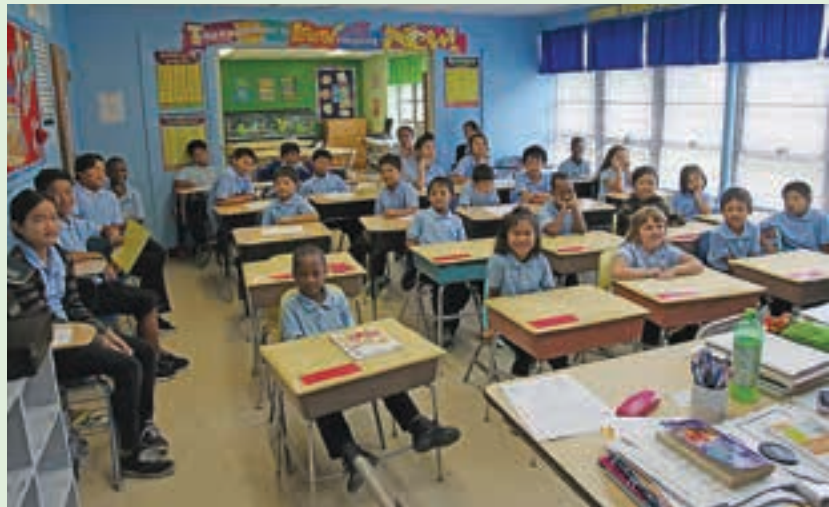
Students are thriving in Utica International church school's enhanced educational program.

Three years later, there is a thriving school with 30 students in attendance and a highly dedicated mission-minded teacher, aide, and volunteers. The church has rec-