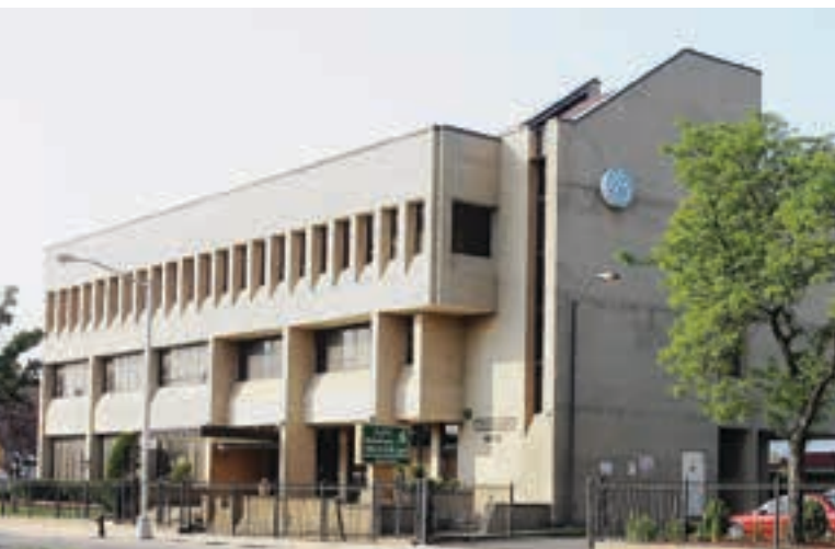
The Northeastern Conference office is located in Jamaica, New York.

—Communication department, Northeastern Conference