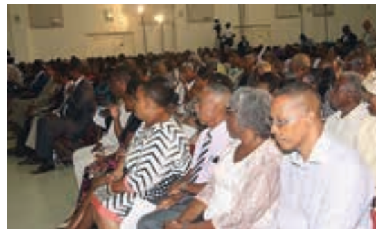
The Bermuda Institute auditorium is full for the worship service at camp meeting 2016.