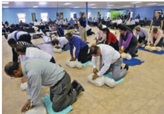
Pastors and educators practice cardiopulmonary resuscitation at Northeastern Conference's spring workers meeting.