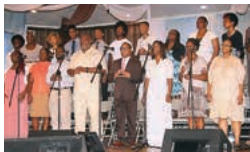
The Bermuda Conference camp meeting choir sings during the worship service.