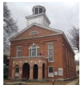
The Joy of Troy church has been added to the New York State and National Registers of Historic Places.