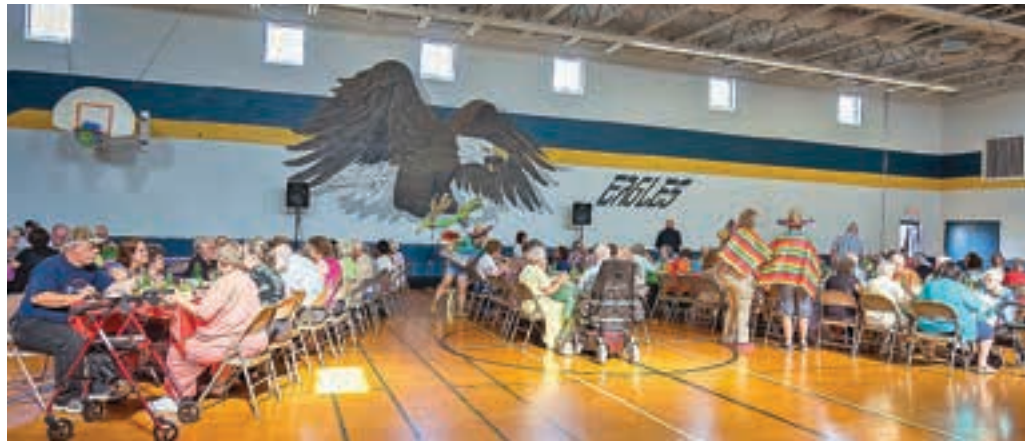
New York Conference retirees attend a banquet held in their honor.

Many people showed their support of the retirees by working hard to contribute to