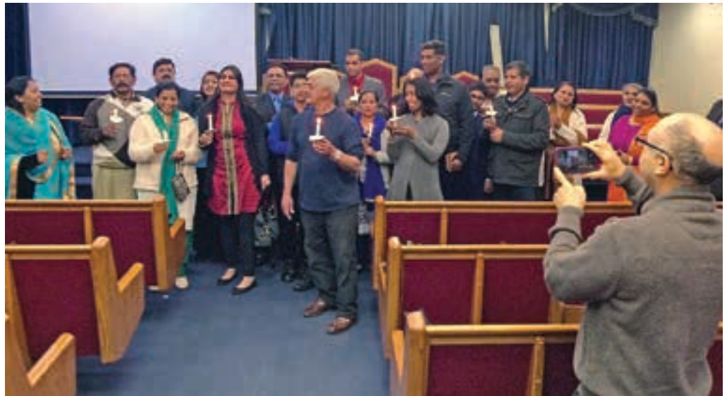
Members of the New York Southern Asia church hand off lit candles to the new Richmond Southern Asian church members.