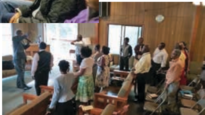
Members participate in the French-language Bible work training at Camp Winnekeag.