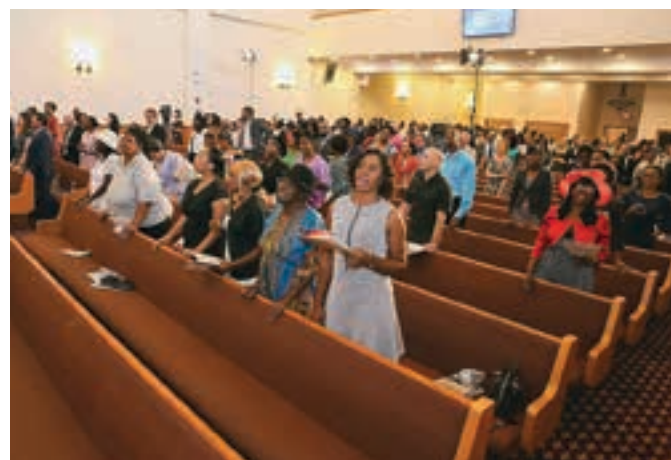
Members from area churches participate in the Religious Liberty Rally in New York City.