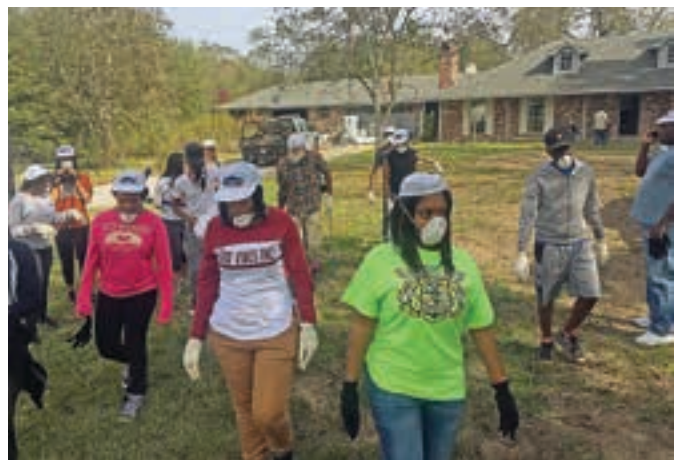
The students are on their way to work on church members’ homes.