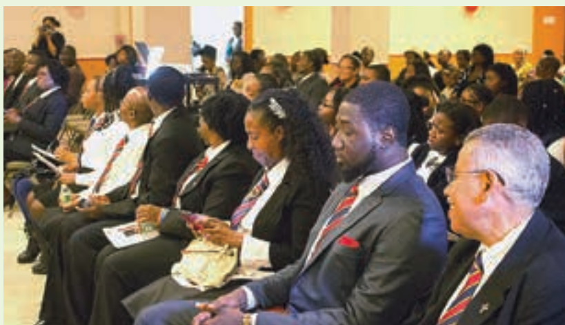
Staff, students, parents, and other guests celebrate the changing of the guard from Excelsior school/Northeastern Academy Brooklyn Campus to South Brooklyn Academy.

Over the years Excelsior school and NEABC have graduated