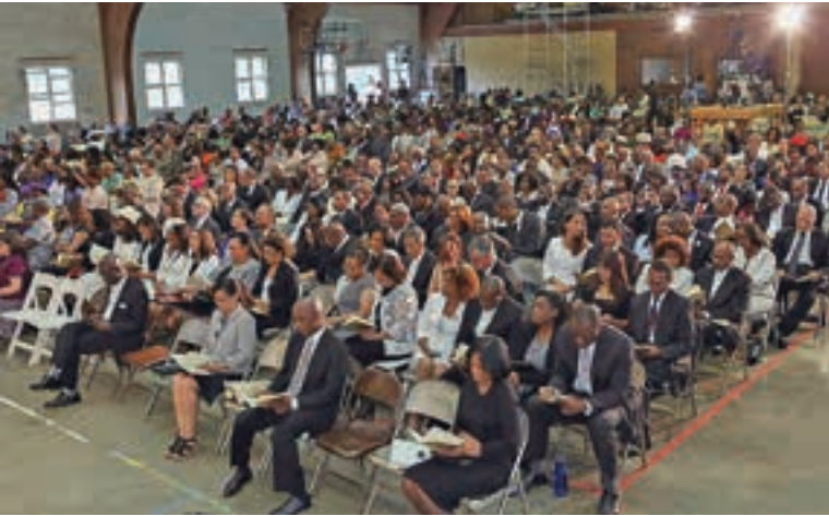
Many supporters attended the Greater New York Conference ordination service held during United Camp Meeting at Camp Berkshire.