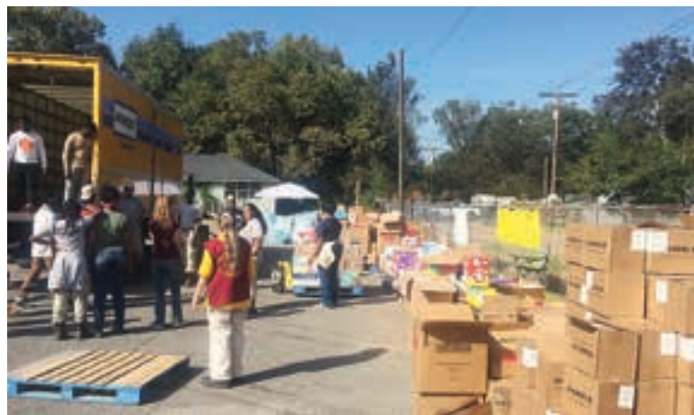
Students load a truck and prepare to distribute much-needed items to residents of the community.