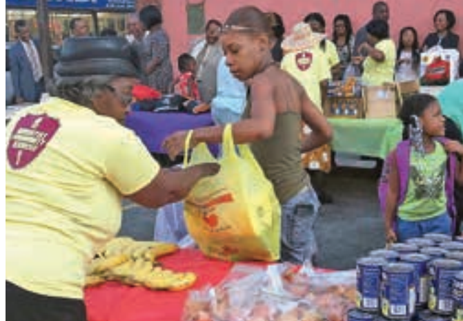
Families from around the Bronx community receive canned goods, Christian magazines, and other food items.