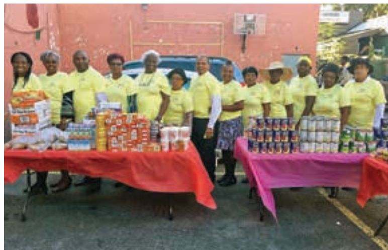
Members of Sharon church pose for a photo before working together at the Community Service food giveaway.

On the afternoon of Sabbath, September 3, the church's parking lot was lined with tables laden with food items for distribution to the needy in the community. The church's Education