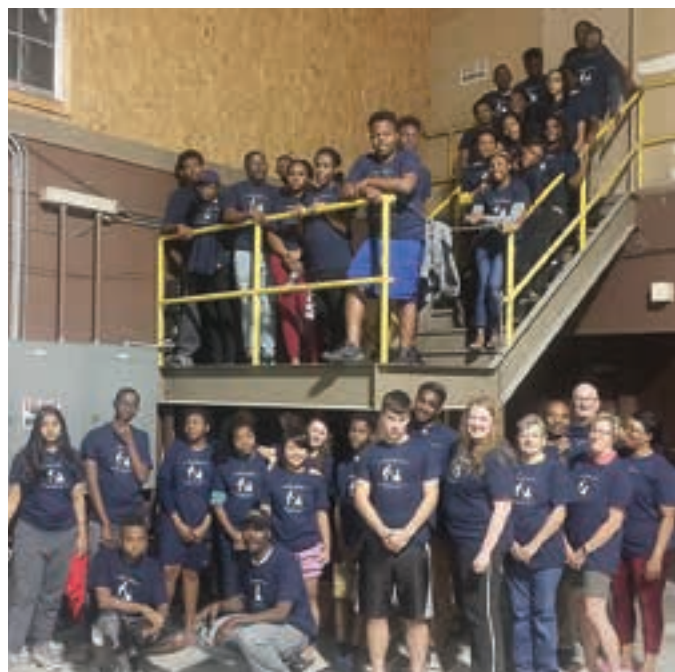
Students, volunteers, academy sponsors, and Atlantic Union personnel pose for a group picture before getting to work helping flood victims.

“Our pastor gave a sermon a few weeks after the flood and I was impressed with the fact that people don’t know what you need unless you ask for it,” remembers