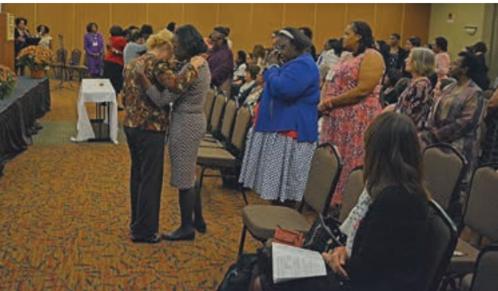
Women stand in line waiting for prayer during a special anointing service at the Southern New England Conference women's retreat.

—Communication staff, Atlantic Union Conference