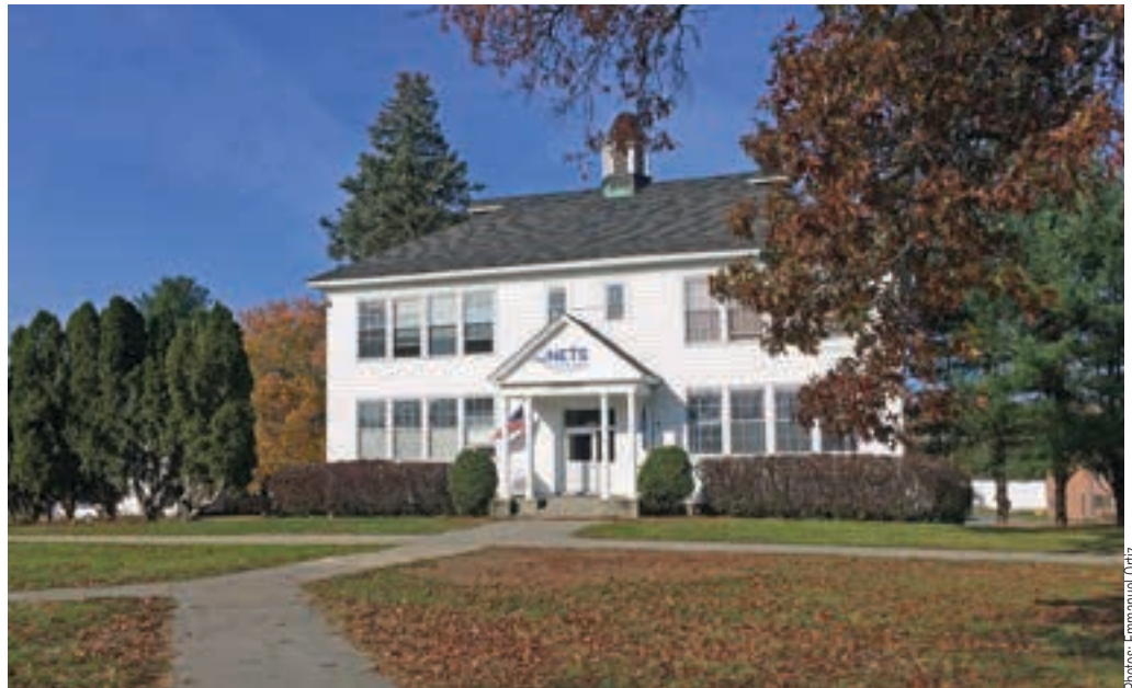
Classes for students attending the NETS Evangelism Center program are held in the Miles building on the campus of Atlantic Union College.