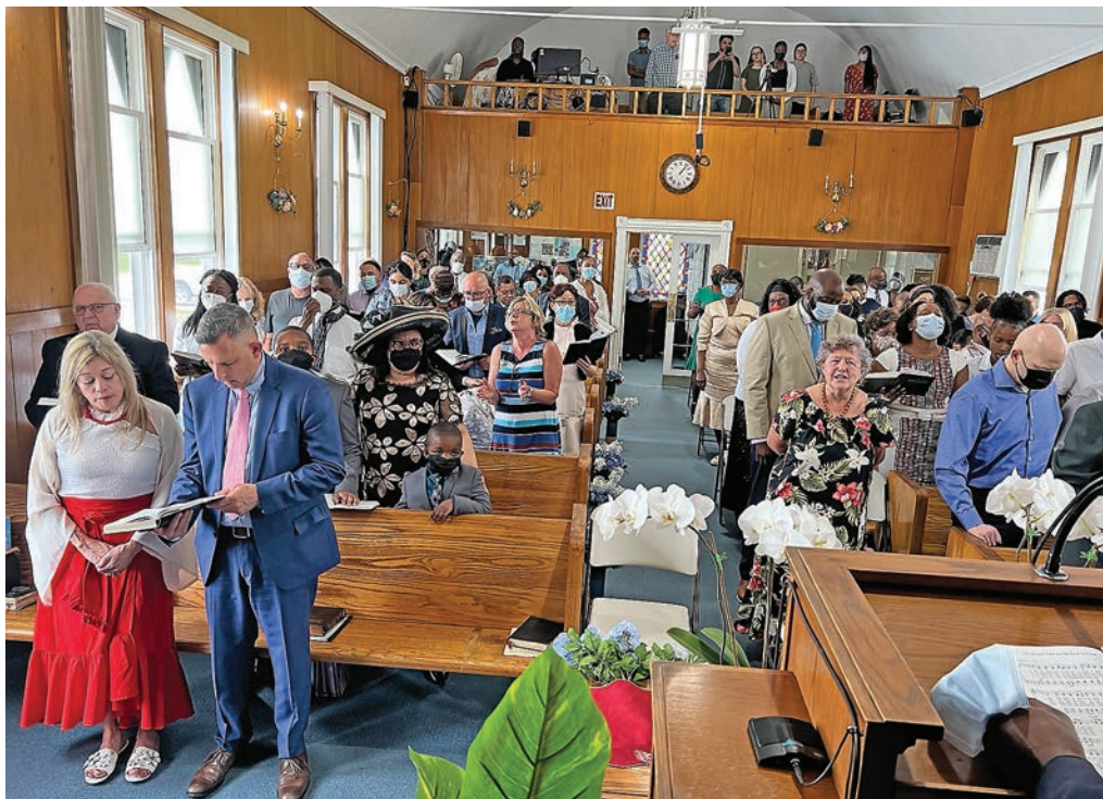
Members and friends of the Patchogue church commemorate the church's 100-year history.