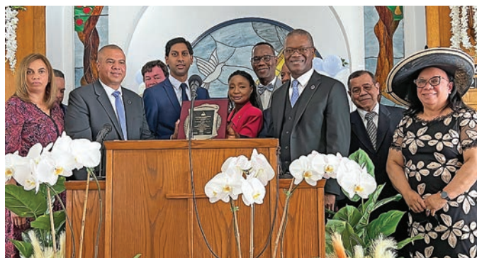
Representatives from the Greater New York Conference administration, the Atlantic Union Conference administration, pastors, and elders stand together in remembrance of Patchogue church's 100 th anniversary.

sage, has been brought to a knowledge of the truth by the prayer of faith and the tender spirit of the Master.