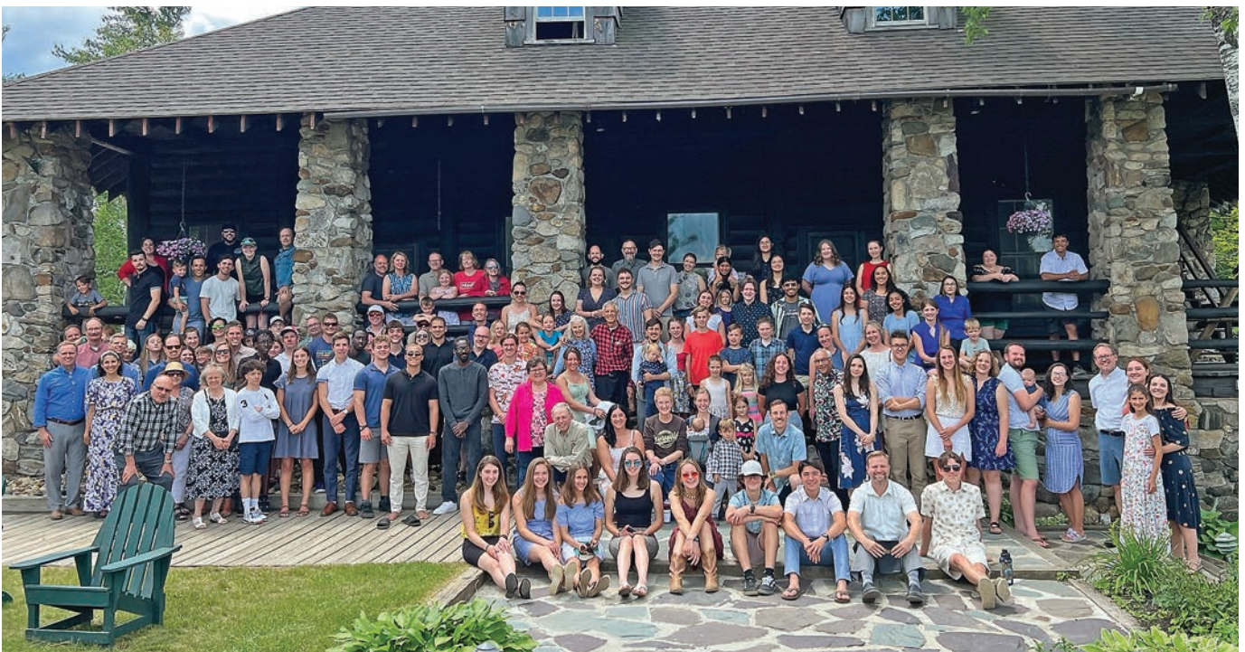
Camp Lawroweld present and former staff celebrate with their families the many years of camp ministry.