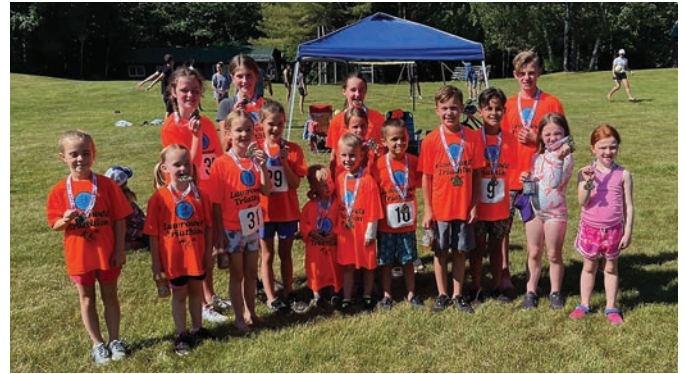
Future staffers at Camp Lawroweld show off their post-race medals.

That was 75 years ago, and there is no doubt that God is still leading. In celebration of His providence and provision, Camp Lawroweld hosted the first-ever staff reunion on June 24-26, with more than 135 people in