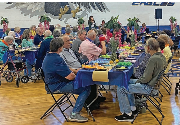
The Retiree’s Banquet celebrates the ministry of those who served in New York Conference as pastors, educators, and in other areas of service.

One of the best moments of the camp meeting experience this year took