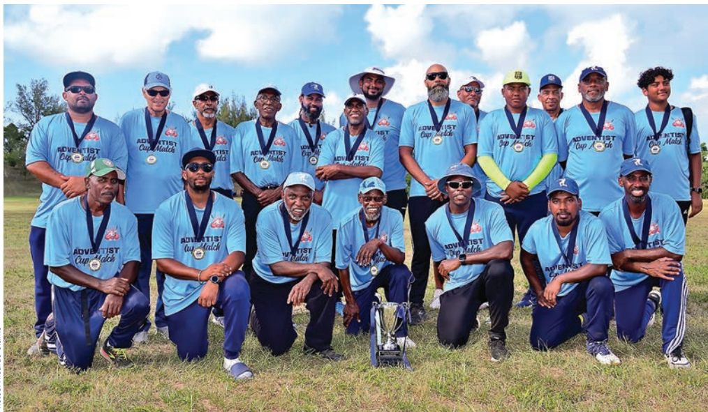
The St. George's team are the winners of the Adventist Cup Match cricket game.