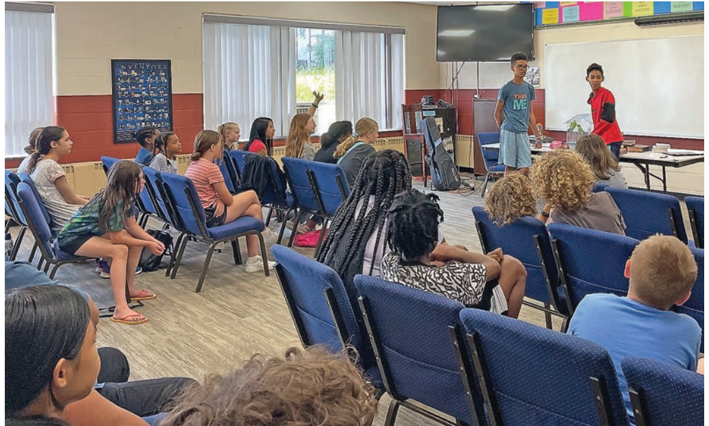
The junior class meets in the Union Springs Academy administration building for the morning session.