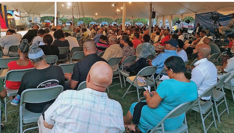
The "Signs of the Times" evangelistic series is the first open-air tent meeting held in Bermuda since 2006.