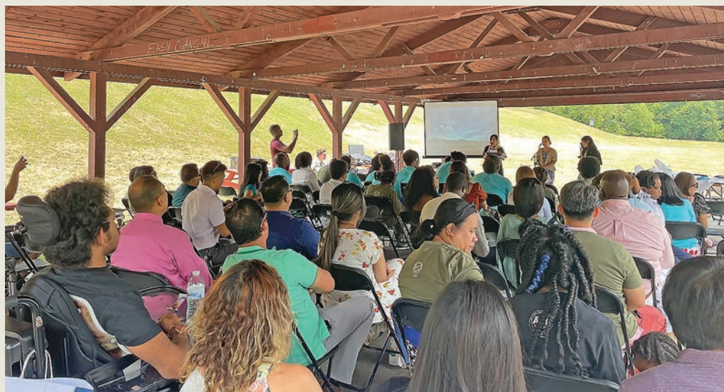
The Capital District hosts its first Youth Rally at Prospect Park in Troy, New York.