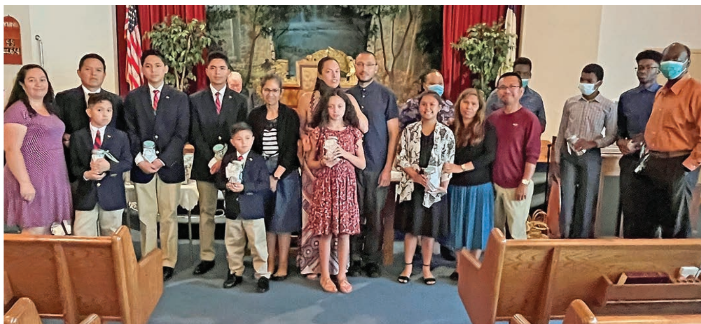
The Blessings jars were presented to each child at the Hudson church.