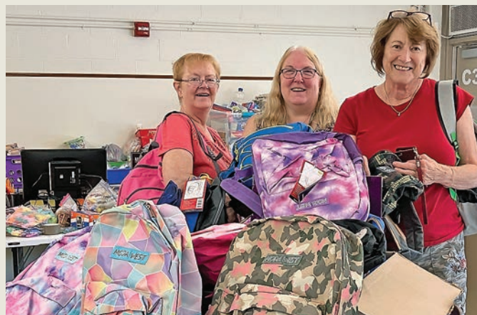
Wickford church members pause for a photo at Davisville Academy in North Kingstown, Rhode Island, after delivering backpacks filled with school supplies.