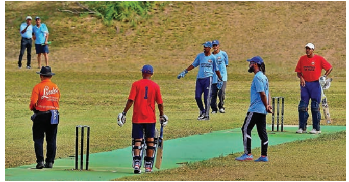
The Adventist Cup Match cricket game in progress, and Somerset is at bat.

Cricket is played with a bat and ball between two teams of 11 players: batters, bowlers, and wicket-keepers. Two umpires officiate the game. The object is for the bowler to take wickets. He does this if the batsman is bowled, caught, stumped, or run out. (Wickets are three wooden stumps stuck in the ground and spaced so that a