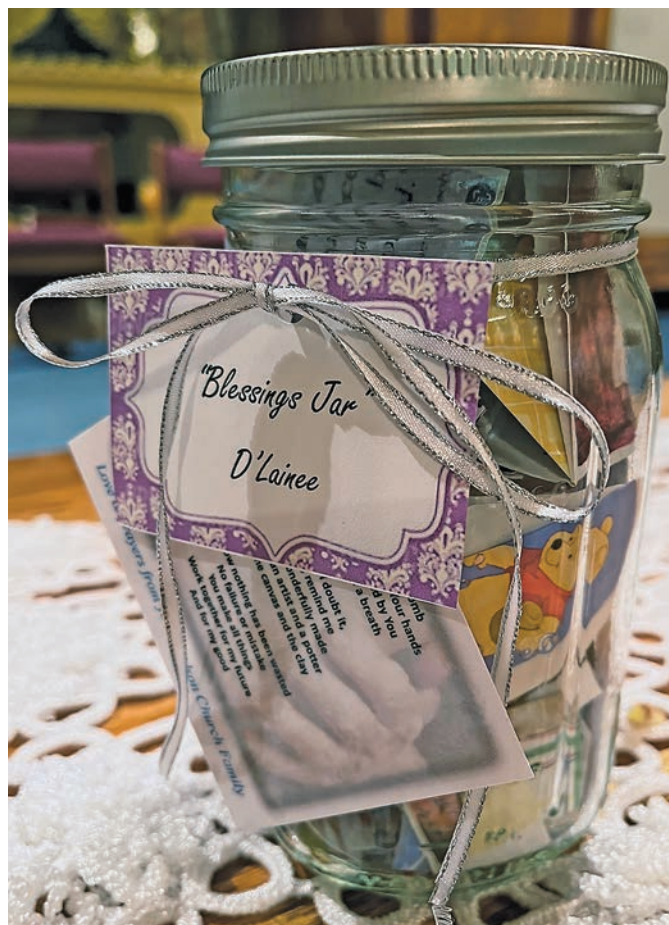
The Blessings jar distributed to the youth are filled with Bible scriptures, quotes from THE MESSIAH , cute sayings/messages of the day, pictures, and more.

The church family supports and prays for all its young people, but even more so now for those starting or returning to school amid the recent school turmoil. In addition, each child at church was presented with a Blessings Jar. The jar, a prettily decorated mason jar, was filled with Bible scriptures, quotes from THE MESSIAH , cute sayings/messages of