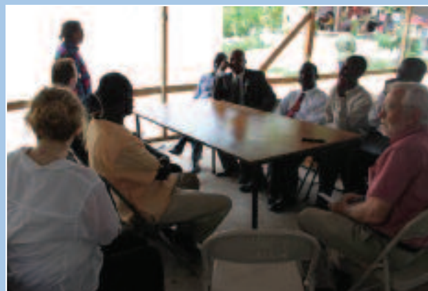
(Above) The project team listens to pastors of local churches in Port-au-Prince.