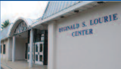
The Lourie Center's Rockville, Md., facility