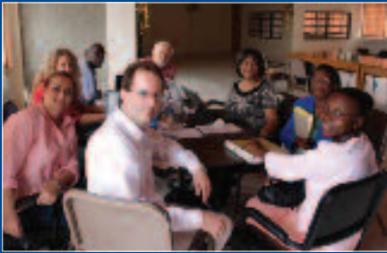
The Haiti Hope and Healing Project team meet in Haiti.