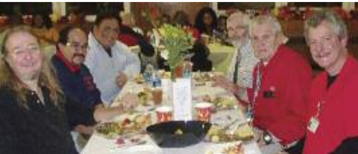
Displaced families enjoy an elaborate holiday dinner provided by New Jersey's Church of the Oranges.

To learn more about CFESC, call (862) 520-2026, email info@cfesc.org or visit facebook.com/CFESC .