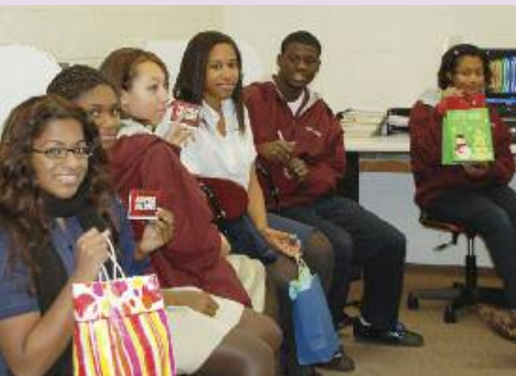
Students exchange gifts during a campus family meeting.