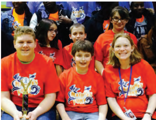
The team celebrates their third-place win at the regional competition that qualified them for the national event.