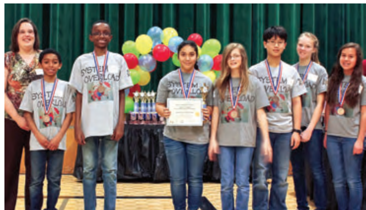
Shenandoah Valley Adventist Elementary School’s System Overload robotics team designs a device with real-world applications.

C.F. Richards’ LEGO Lightning Squad team of six won the champion’s award for designing a robot that can project LED lane markers on the highway to allow