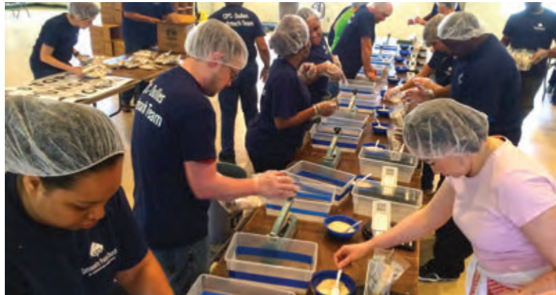
Church members and residents place dehydrated vegetables, soy and rice into bags before they get sealed.

Church members invited the community to participate in the packing. After the event, one participant, a homeless man who has been attending the church, said, "The church has given so much to help me out; I wanted to do this to give back."