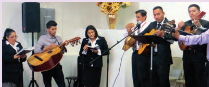
Musicians lead song service in the company's newly rented space in Columbia, Md.