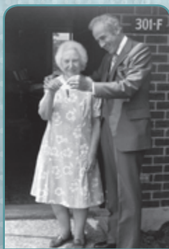
Sycamore Glen resident