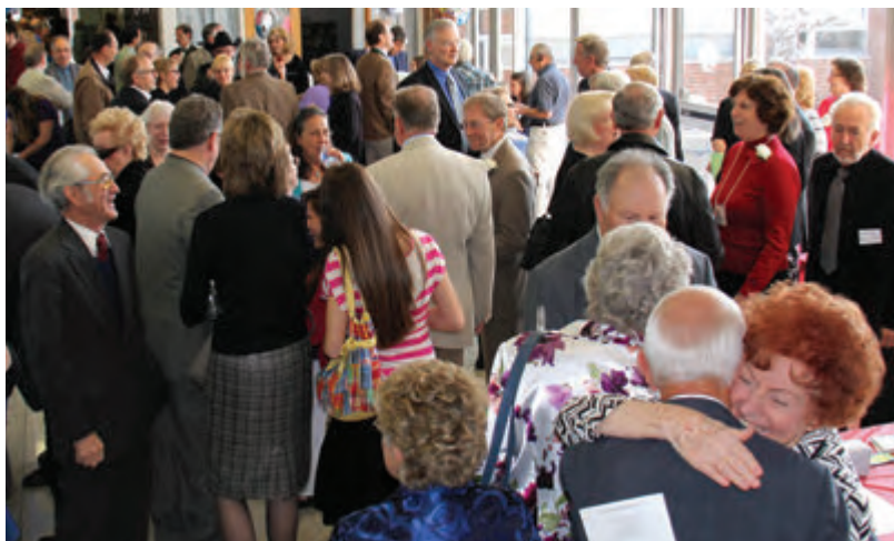
BMA alumni greet each as they register for the weekend. The 13 honor classes this year, along with Lake Ariel and Philadelphia Academy former faculty and staff, were 1944, 1949, 1954, 1959, 1964, 1969, 1974, 1979, 1984, 1989, 1994 and 2004.