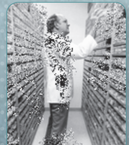
Apothecary pharmacist filling orders