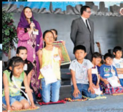
As a representation of life in biblical times, young attendees exhibit small prayer rugs they loomed.