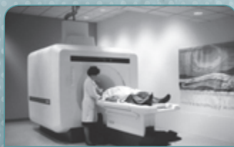
Patient getting PET scan