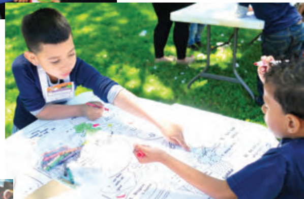
Children worship in their own space under the theme “God Cares, God Guides, God Provides.” They had a full Sabbath with music, stories, fun and crafts.