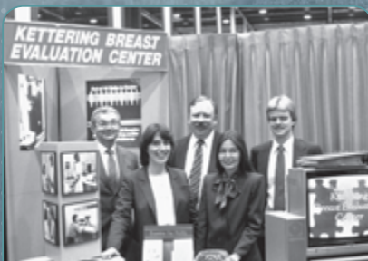
Kettering Breast Evaluation Center team