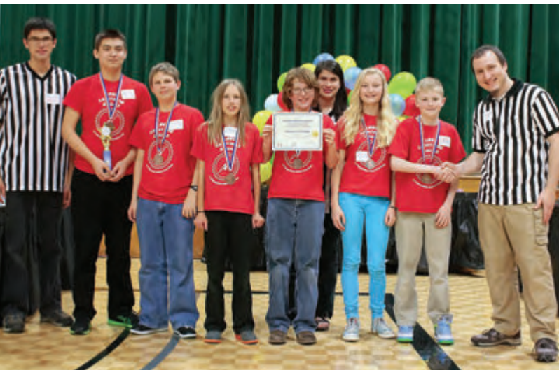
C.F. Richards Junior Academy’s LEGO Lightning Squad robotics team wins first-place at the Southern Union Region’s Adventist Robotics League (ARL) Tournament.