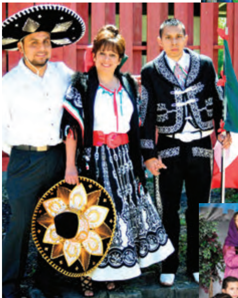
Above and left: Sabbath morning a parade of nations brought color to the weekend with church members from many countries proudly donning their national attire and displaying flags.