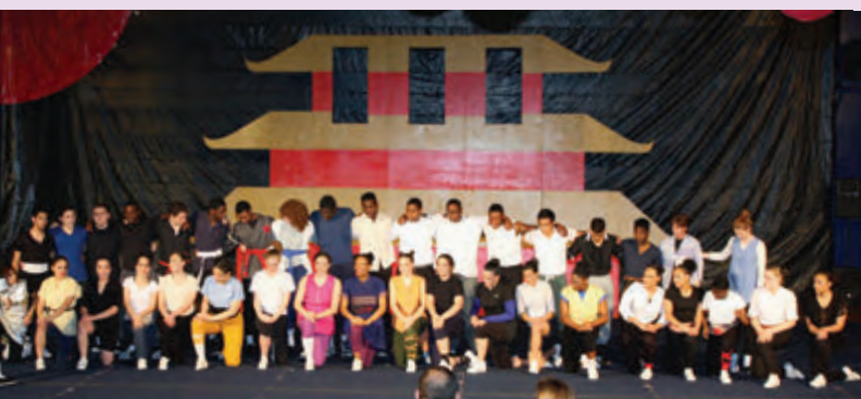
Academy Days visitors get treated to an Aerial Aires acrobatics performance.

“We are looking forward to a healthy enrollment,”