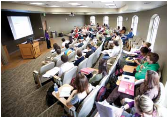
Students attend a lecture in one of Florida Hospital Hall's state-of-the-art classrooms.

With resources that support an easy transition from classroom to workplace, the School of Nursing can continue to produce quality nurses. And with more