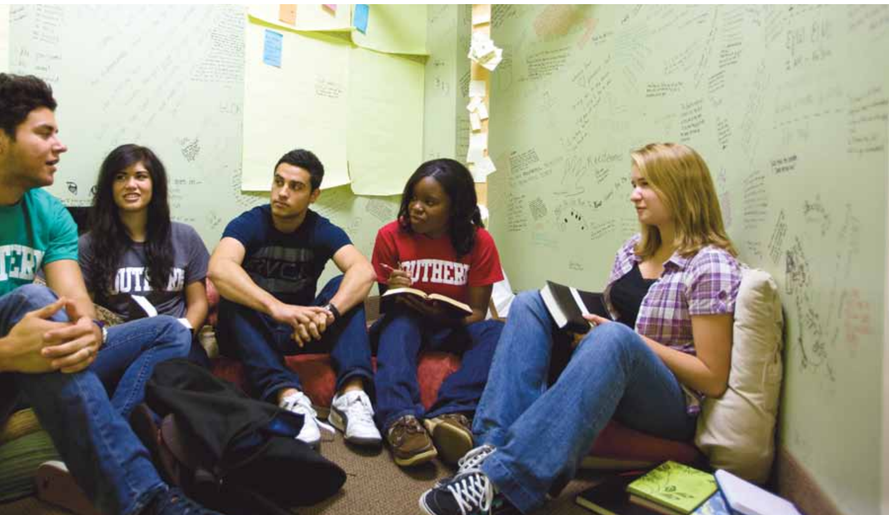
Southern's Life Groups all share one common goal: to make God relevant to students' lives.