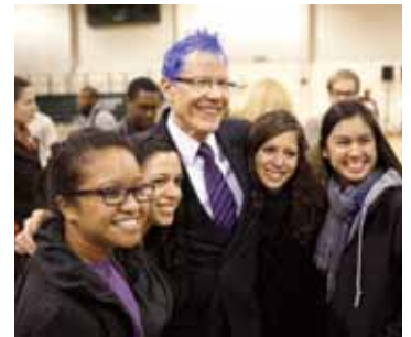
President Bietz’s temporary new look was incentive for students’ fund-raising effort.