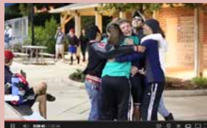
The 2013 Strawberry Festival film captures the ways students connect to each other and overcome challenges.