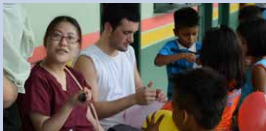
During Spring Break, a group of School of Nursing students set out for the jungles of the Amazon River to assist with health clinics and construction.