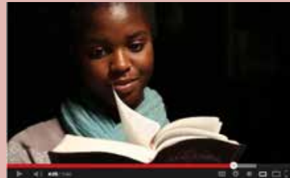
This video highlights how students have grown in their appreciation of God's special day. More than 1,300 churches were sent a copy to show during "Southern Sabbath" on March 16.

Find the video links at southern.edu/columns .