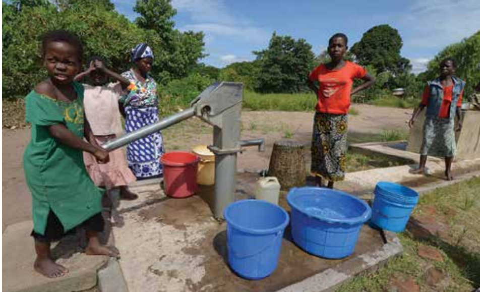
Long-term relationships between indigenous and non-indigenous groups are critical for developing mutual trust and the sharing of information and resources. The global community development degree teaches students how to build and nurture that connection.