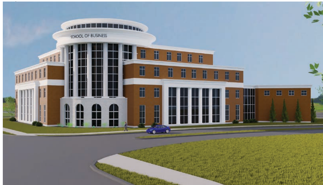
The new School of Business facility, visualized in this rendering, will expand opportunities for students.

For decades, the School of Business at Southern has equipped students with the tools needed to succeed professionally while inspiring them with the eternal purpose of sharing Christ in their chosen field. Southern is pleased to be launching the Business Leadership + Innovation Campaign, a $20 million effort aimed at empowering the next generation of business leaders.