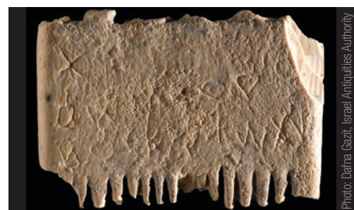
This small, ivory comb, found by Southern archaeologists, features the first written Canaanite sentence ever found.