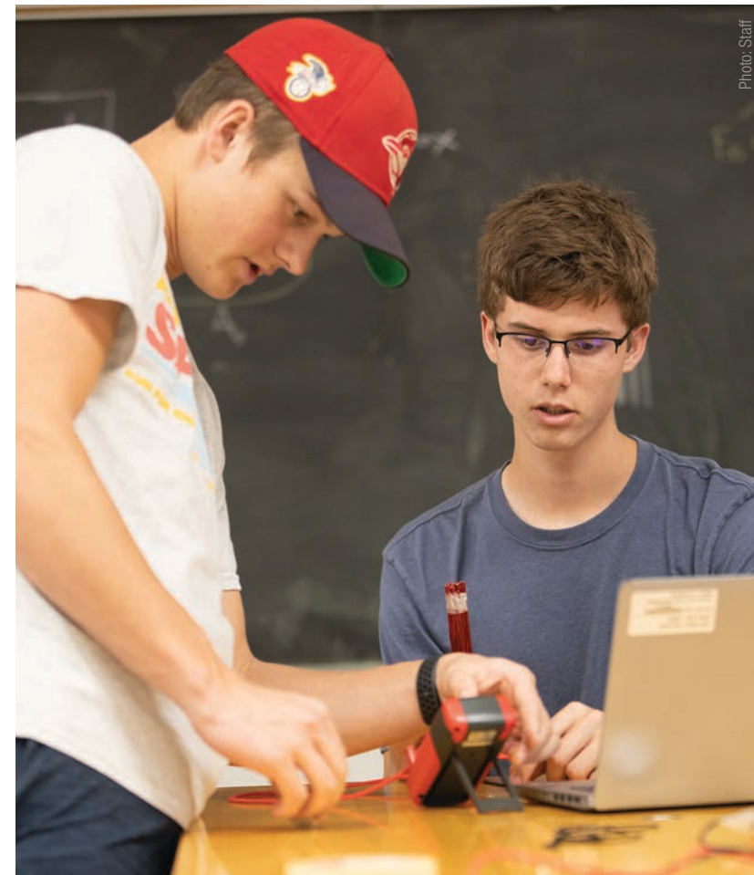
In this new degree program, students can pick from mechanical, electrical, and computer engineering emphases.

With classes beginning in Fall 2023, Southern is launching a new bachelor's degree in engineering. This program will build on the associate degree in engineering that the university has offered for many years and will be housed in the Physics and Engineering Department.