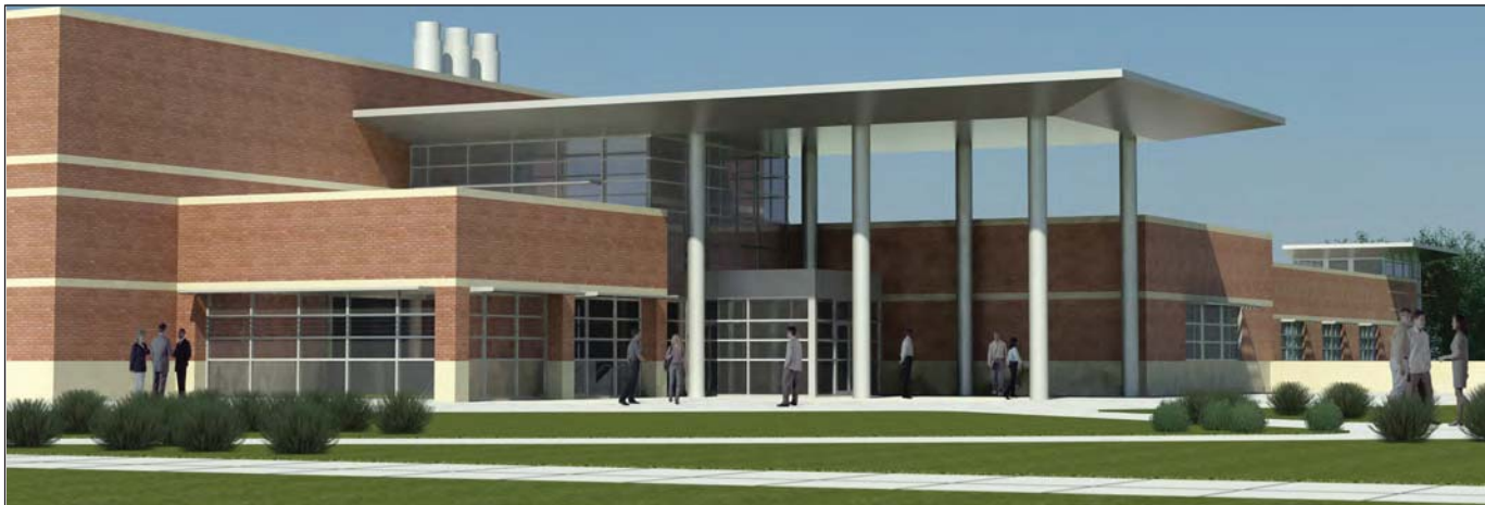
Illustration courtesy of Davis Design

Union alumni around the world—doctors, nurses, PAs, researchers, teachers and many more—will attest to the quality of the science education they received at Union College, not because of the facilities, but in spite of them. Union College is now working to pair its dedicated faculty with a new facility that will reflect and empower their excellence.