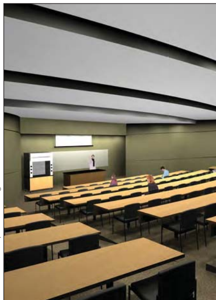
illustration: courtesy of Davis Design