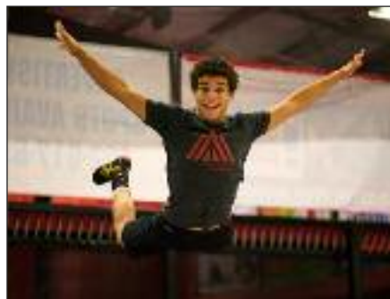
Gymnasts spent two days in clinics at Speedway Sporting Village (above).

Hundreds of gymnasts from Seventh-day Adventist colleges and high schools from across North America gathered at Union College in November for Acrofest 2015, an event packed with clinics, training, demonstrations and spiritual lessons.