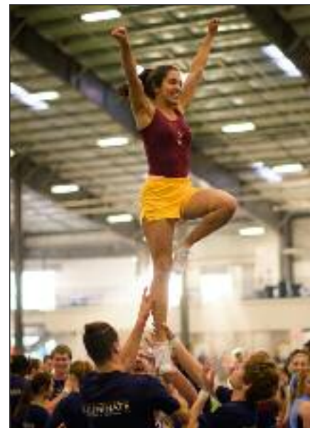
Nineteen teams performed in the grand finale at the Lied Center. (left and below).