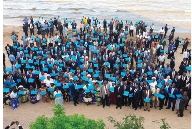
God First training of trainers in Malawi Union Conference was attended by union and conference officers, pastors from all the conferences, elders, treasurers, and stewardship leaders. Picture on right shows some delegates posing with certificates.