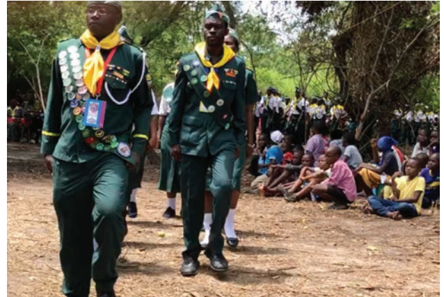
South-East Tanzania Conference youth (ECD) spent December 12-22, 2018 in the bush of Ruvu, Mlandizi Pwani, in Tanzania, studying stewardship lessons under the theme: "God First," translated in Swahili as "Mungu Kwanza" based on Matthew 6:33.