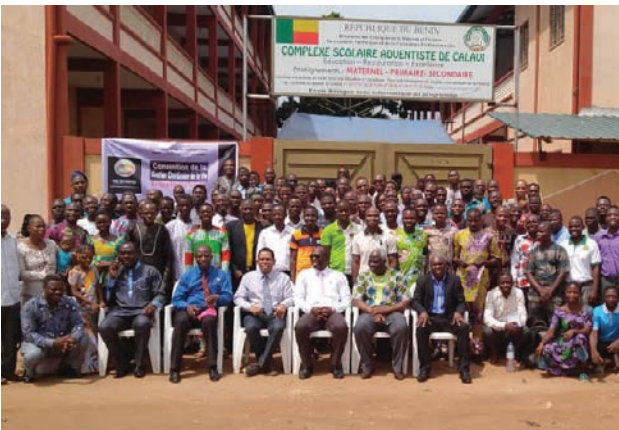
Stewardship training in Ouagadougou, Burkina Faso, February 21-27, 2019.