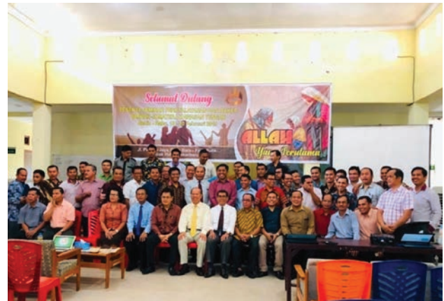
God First seminar in Kalay City of Upper Myanmar Mission/Myanmar Union Mission (left) and East Kalimantan Mission of WIUM (right)