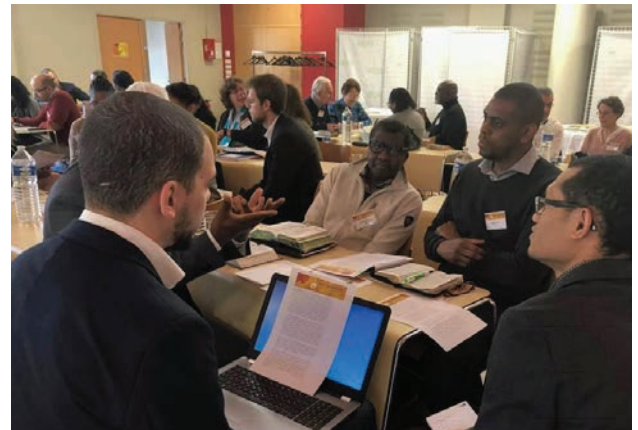
Stewardship convention for French-speaking territories, February 7-11, 2019.