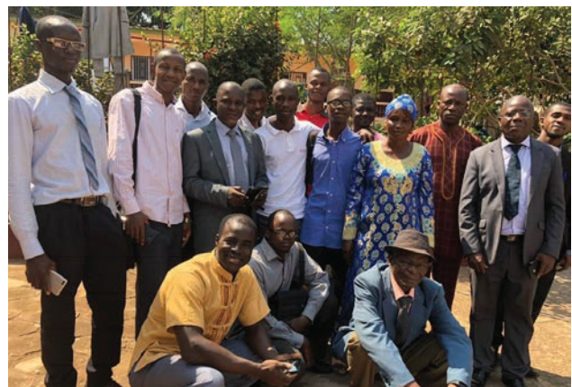
Stewardship pastors' convention in Conakry, Guinea.