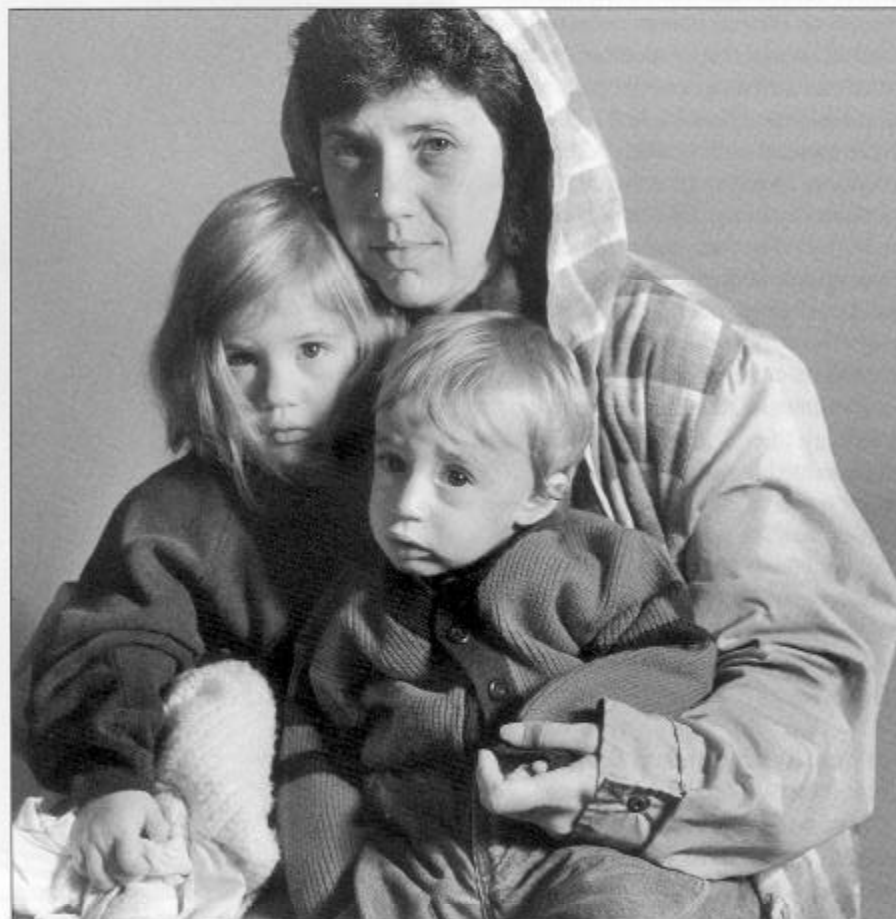
Sociologists study wealth and poverty to discover how social choice patterns affect income level.

While most sociologists focus on the effects of social group membership on human behavior, others center their research and theoretical thinking on how