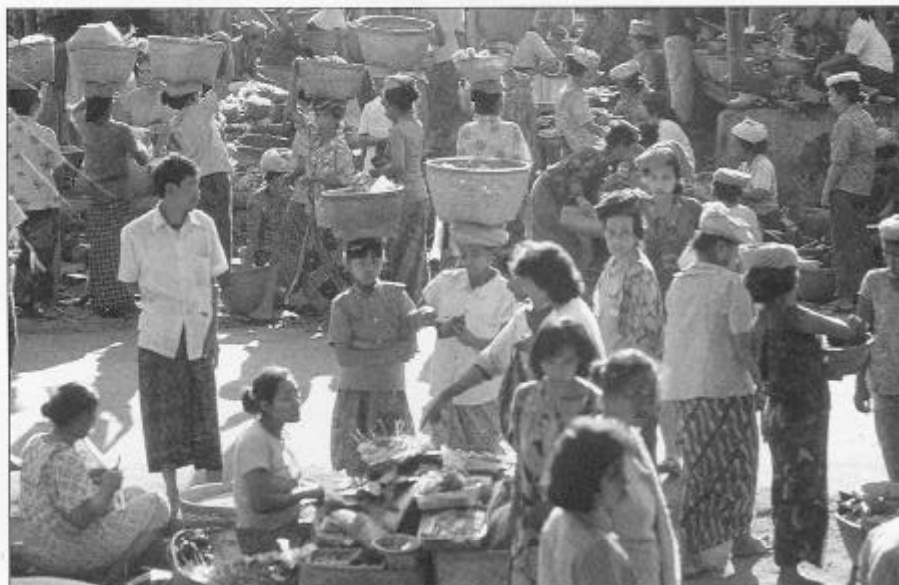
Sociologists focus on patterns of group interaction and how cultures affect human behavior.