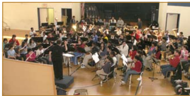
Bands from North Shore Junior Academy and Hinsdale Adventist Academy had intense rehearsals for two days before their performance.

The evening ended much too soon! Next year, the Illinois Conference will hold a choir festival, which will be hosted by North Shore. Hinsdale Adventist Academy's music director is