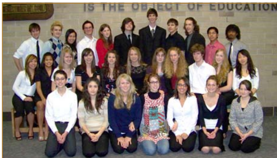
The Andrews Academy chapter of the National Honor Society discovered that each one can make a difference individually, collectively, locally and globally.