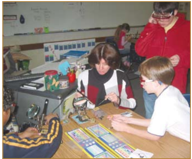
The aeronautics lab director demonstrates how to solder wire.

The director visits our school at the beginning of the day. At times I have wondered if we might make her uncomfortable as we begin the day with the class kneeling while a student and I pray. The director and her assistants always stand and wait for us. This year I thought briefly that perhaps we should