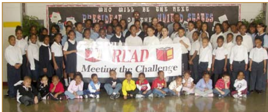
Peterson-Warren Academy students were challenged to read more books during the “READ: Meeting the Challenge” initiative this spring.

A team of finalist judges, which include a top Michigan government official and the sponsoring teachers of last year’s top two statewide winners,