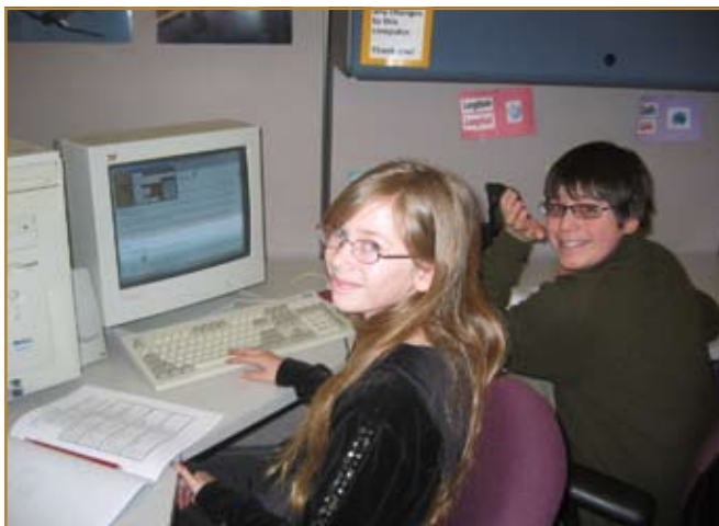
Students design an airplane using a computer at the aeronautics learning laboratory.

Through the years the program has grown, and the experiences have expanded. In recent years, before the