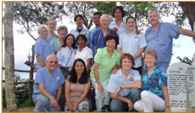
A mission team traveled to the Philippines where they served daily in medical clinics. Villagers were so happy they made the effort to come see them, to offer help and hope.

In Manila, we made it through customs without problems. Praise God! After connecting with dear friends from