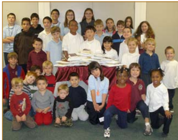
Downers Grove Adventist School students sponsored 30 Bibles to China last year. This year they raised funds to send 150 Bibles to China, in cooperation with the Bibles Unbound initiative sponsored by the Voice of Martyrs ministry.

Last school year the Downers Grove Adventist School students sponsored 30 Bibles to China. This school year the students committed to raise $300 dollars to send 50 Bibles again to China. With their commitment to this project and the generous gifts of family, friends, the students' home churches and the Downers Grove Church, the Lord helped