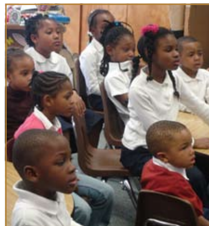
Elementary students listen attentively to the electrician’s presentation.