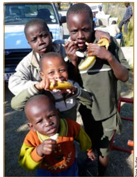
The young boys enjoyed a banana, made possible from donations to the Nhlengelo Community Center. For most orphans, the meal provided at the center is the only one they receive daily.