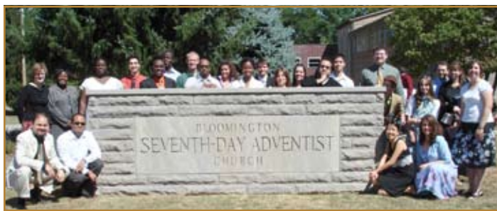
In February, the Adventist Students for Christ (AS4C) group from the Bloomington Church presented a week-long evangelistic series at Indiana University-Bloomington. The meetings were attended by more than 120 non-Adventist students, most of which were atheists or agnostics.

At the end of the first meeting when the speaker asked, "How many of you were challenged by tonight's presentation that it made you reconsider your belief on God's existence?" a handful of people raised their hands. Each night, the meeting became more intense in its subject and content with presentations on Jesus as