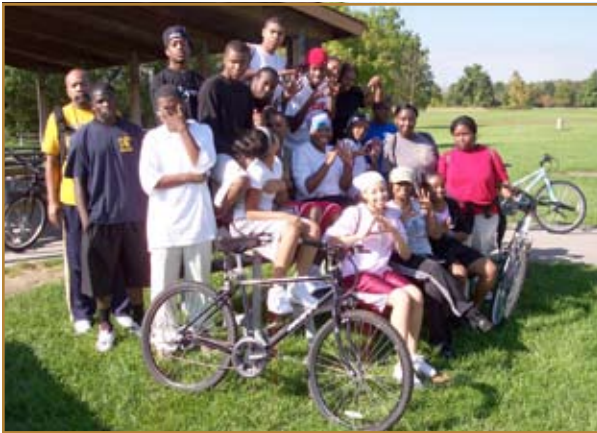
Students made a deserved pit stop at a shelter.