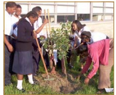
Peterson-Warren Academy eighth graders plant a tree in front of their school.