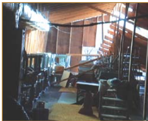
When the windstorm caused a large section of the room to collapse at Indianapolis Junior Academy, four classrooms were damaged by rainwater.

The building inspector from the City of Indianapolis declared the entire building was unsafe to use as a result of the storm damage. This presented a major challenge of where to conduct classes while the reconstruction work was underway. The problem was solved when the Glendale Church Board approved the temporary use of Sabbath school rooms in the basement of the church.