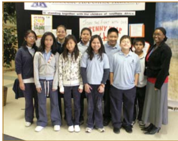
The sixth grade class is the smallest class at Hinsdale Adventist Academy, but they raised the most money ($701.25) to benefit the orphans helped by the Nhlengelo Community Center. In total, HAA students raised $4,000 in the Penny War challenge.

for the children of Nhlengelo, and had a great time doing it. As a reward, all classes which reached their goal of raising $5 per student (11 out of 13) were given a "No Uniform Day," and the entire school received ice cream (thanks to our friends at Culver's). It's important to note that the 6th grade class raised the most money, $701.25. This class happens to be the smallest class in the school! It just goes to show that good things