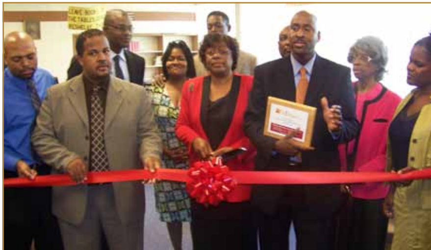
A ribbon-cutting ceremony was held for the newly-refurbished Peterson-Warren Academy library.