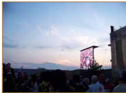
Nubes en forma de cruz en Oshkosh,

“Durante el Camporee recibimos noticias trágicas en nuestra familia. Mi abuelo había fallecido el martes