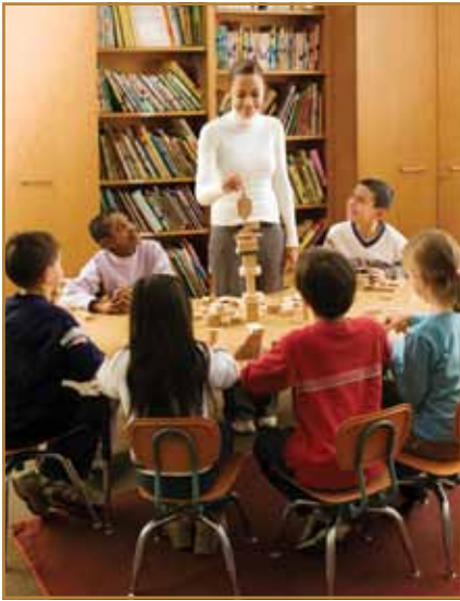
Students who are educated in the exemplary Teacher Preparation Program at Andrews University graduate with confidence they are a product of a top-notch institution.