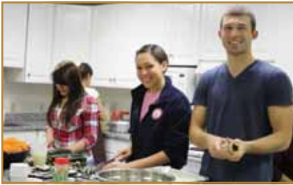
Many volunteer hours helped make the event a success.