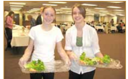
The Jackson Church young people were front and center serving food to the seminar guests.