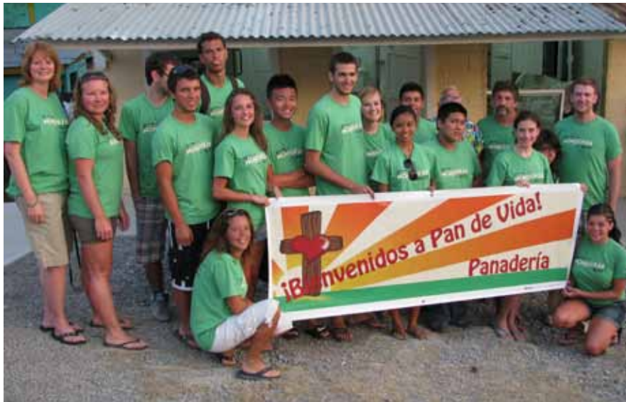
Reflecting on their mission trip to Roatan, the seniors were touched by the resilient children they met who overcame their discouraging circumstances in order to enjoy childhood.