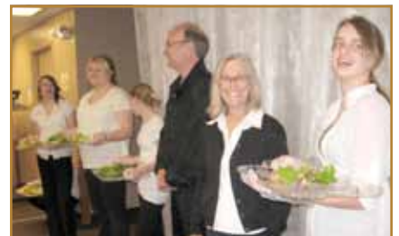
The seminar’s success was due in part to the many volunteers who donated their time, talents and resources.