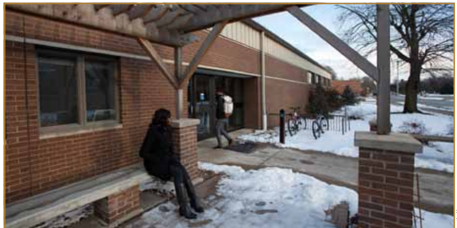
Students interested in studying at the Andrews University School of Architecture now have two new programs to choose from: Construction Management and Interior Design.