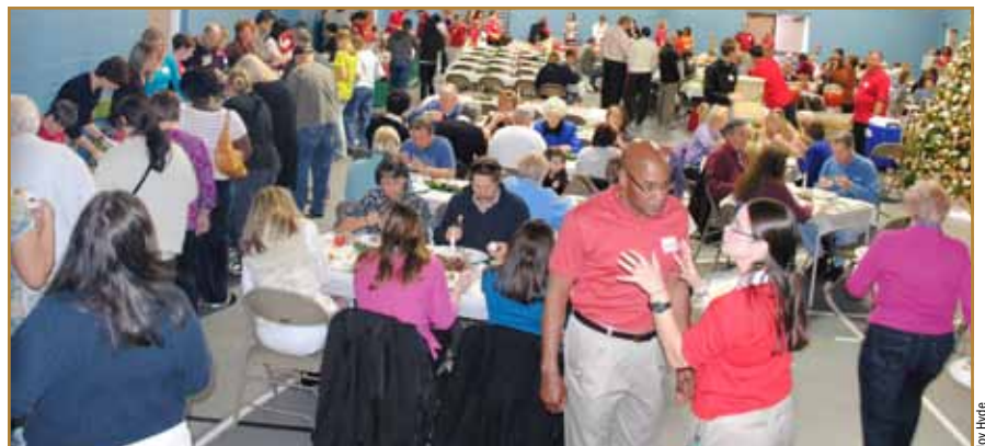
In November 2011, 31 cooks provided 57 delicious dishes that were enjoyed by approximately 550 guests at the 24th Annual Holiday Tasting Extravaganza held at Metropolitan Junior Academy in Plymouth, Mich.