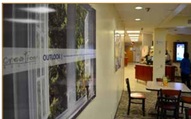
Artwork in the Adventist GlenOaks Hospital cafeteria tells the story of the eight guiding principles of CREATION Health.

One approach all four hospitals are taking to accomplish this is through the "Healthy You" program, a four-month wellness