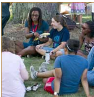
Each summer, Adventist Midwest Health provides financial support to employees who wish to send their children to Camp Akita in Illinois.

Ever since that first summer, Camp Akita has become a part of the fabric of her daughter’s life. One summer,