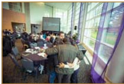
Hermanos que se unen en oración en el evento “Jesús. Todo.” en la Universidad Andrews.

La respuesta es que en ese momento la iglesia Adventista hacía frente al problema de la teología panteísta del renombrado líder de la obra médica, el Dr. John Harvey Kellogg. Dicha controversia causó mucha tensión a los administradores de la iglesia. Elena de White vio que no sólo la teología estaba equivocada sino que la actitud de los que discutían estaba también equivocada porque carecían de amor. Durante una reunión en la que estuvieron presentes los administradores de la iglesia y Elena de White, ella relató una visión en la que había visto a algunos hombres hablando de las faltas de otros y que el ángel le había dicho que estaban siendo guiados por otro espíritu. En la página 253 del tomo mencionado arriba ella resume la atmósfera de su tiempo con estas palabras sencillas: “Hay hoy una gran necesidad de amor fraternal en la iglesia de Dios”. Es evidente que la obra sí crecía en