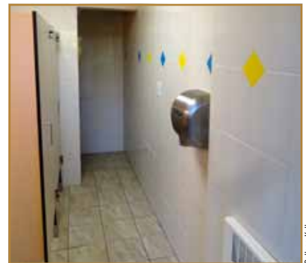
Some estate gifts helped fund bathroom renovations at the school.