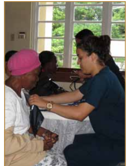
Nursing students work with local clinics to provide preventive and basic care for local community members while on Cruise with a Mission to the Caribbean in December 2014.