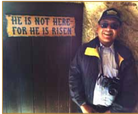
En Jerusalén frente a la tumba donde reposó el cuerpo de nuestro Señor.

Por muchos años tuve el deseo de visitar la Tierra Santa pero no lo puse como una prioridad. Hace tres años mi esposa y yo fuimos a Alemania para visitar los lugares históricos de la reforma protestante en un gira auspiciada por la División Norteamericana. Al concluir ese viaje surgió la idea de ir también a la Tierra Santa. Gracias a Dios después de mucha preparación y oración ese viaje se hizo realidad en el mes de diciembre del año pasado.