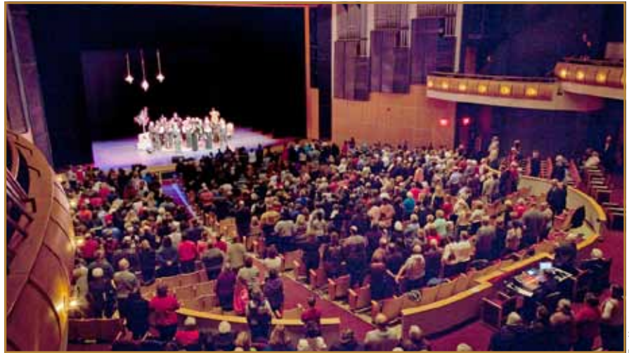
More than 1,300 people attended the concert offered by seven Green Bay area Adventist Churches on Dec. 7, 2014. It was held at the impressive Weider Center for the Performing Arts.

The response from the community was enormous. People sent cards and called the churches to say "thank you," and to say how grateful they were for the spiritual emphasis of the concert. WRVM, the local Christian radio station in Green Bay, helped promote the concert, and the day following the concert, broadcasters spoke very favorably, on air, about the concert and artists. One member of the Green Bay Church remarked it was easier to invite her co-workers to an event like this. She said, "Everyone was talking about