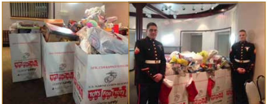
Concert-goers brought gifts for the Toys for Tots organization. Marines received the gifts, and the collection boxes soon overflowed.