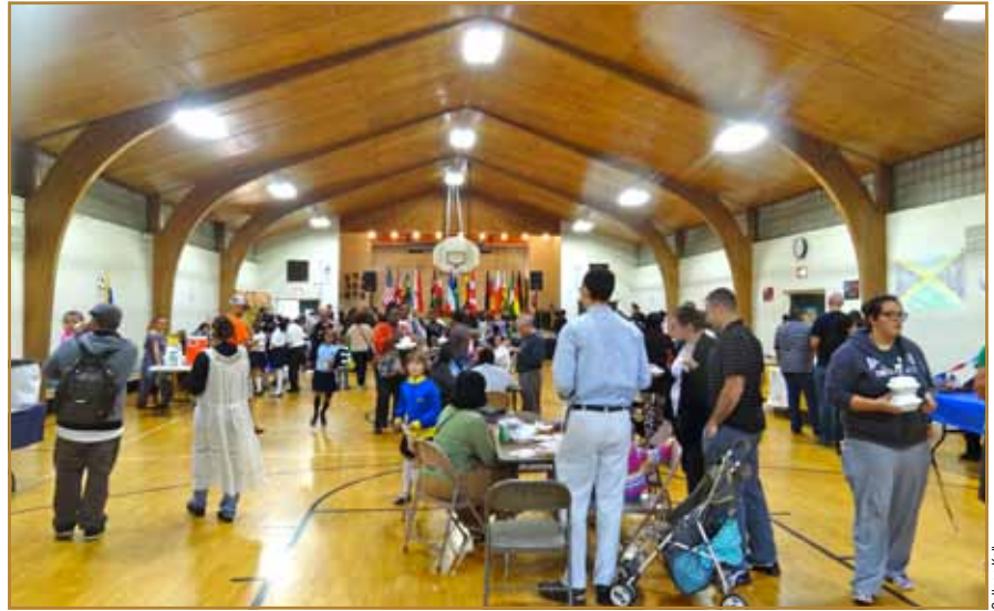
The International Food Fair was held in the newly-renovated gymnasium at South Bend Junior Academy in November 2014.

Instead of settling into a new house as she assumed her new role as principal, Nudd spent July and August in 2013 cleaning out school storage rooms and sending old materials and furniture to Goodwill, libraries and whomever could use what the school no longer wanted or needed.