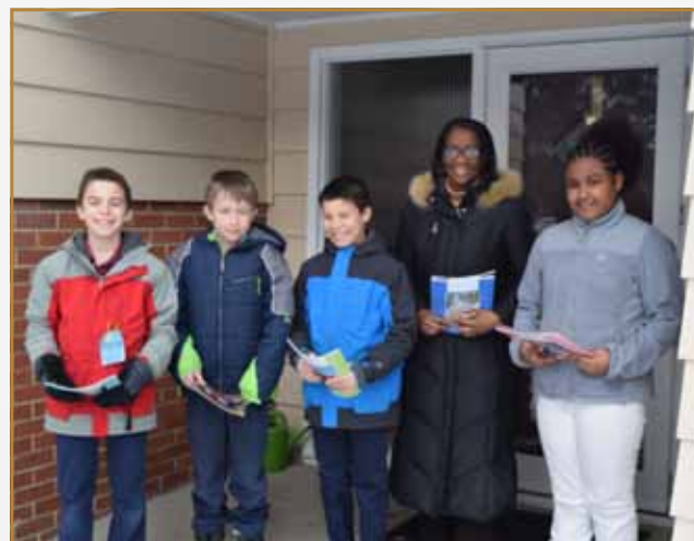
My students may have missed the instructional breakthrough I had planned that morning, but God had other plans — he gave us a spiritual breakthrough.