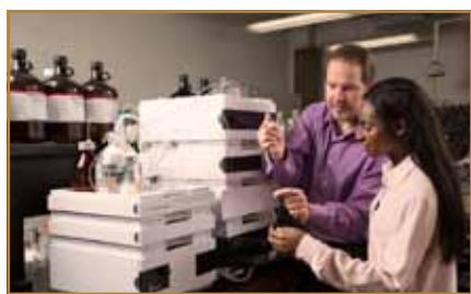
The biotechnology program professors aim to produce professionals who have not only knowledge in the field of biotechnology but also skills in communication technology, interdisciplinary teamwork and ethical use of biotechnology information and techniques.