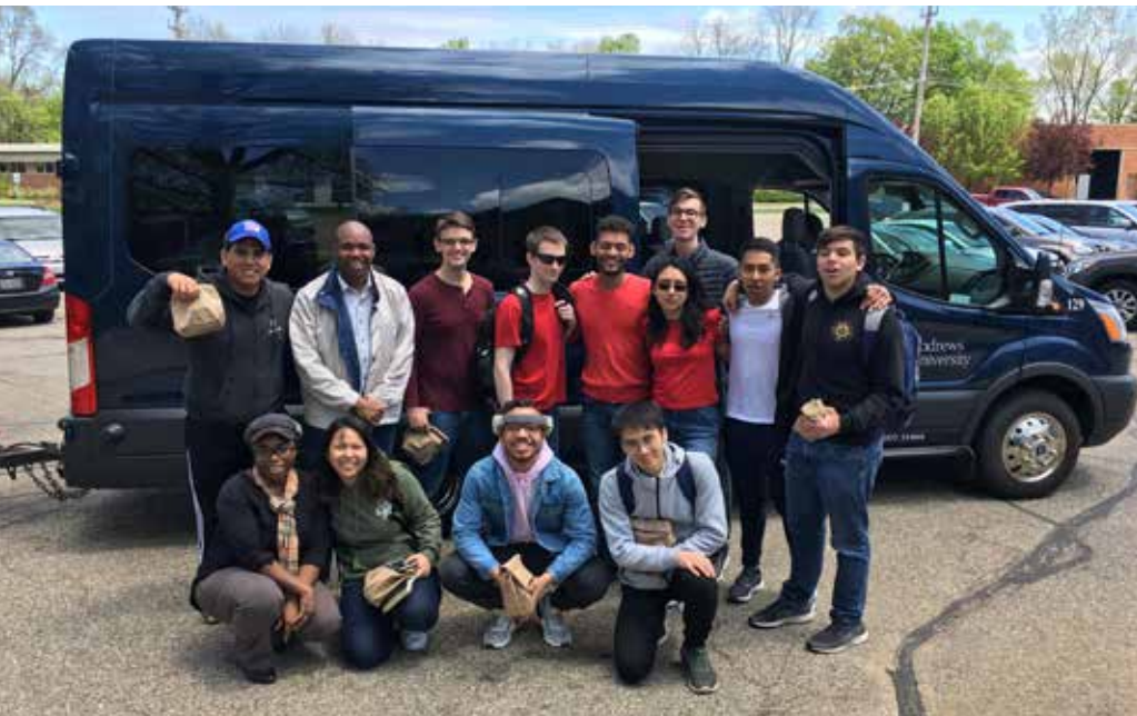
▲ Team before leaving Andrews University campus