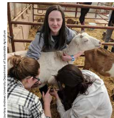
▲ The finished site is proposed to eventually include seeded, fenced pastures for rotational grazing; small animal and calf barns; greenhouses; a classroom; an Animal Science Complex to house sheep, goats, llamas/alpacas, yearling cattle, horses and miniature horses; among other items.