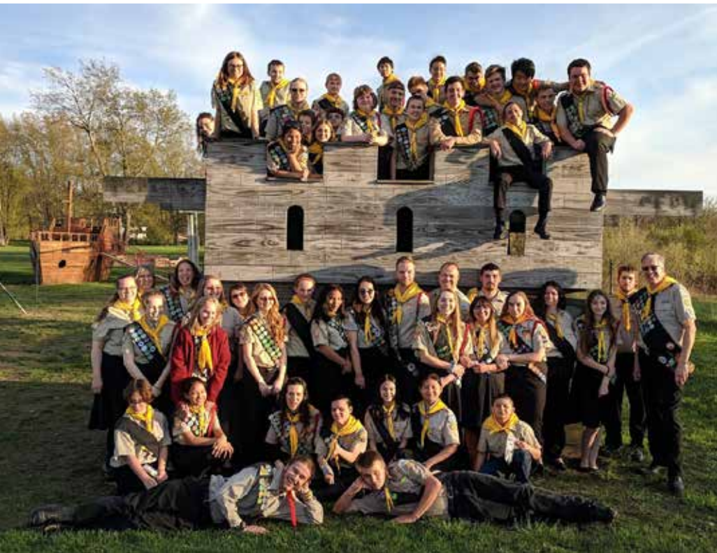
▲ More Michigan Pathfinders are choosing to remain in the Teens in Leadership Training (TLT) program. Pictured here are some members of Eau Claire Critters, a club that retains the most third- and fourth-year teens.