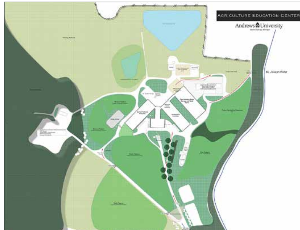
▲ The proposed site plan for the Agriculture Education Center