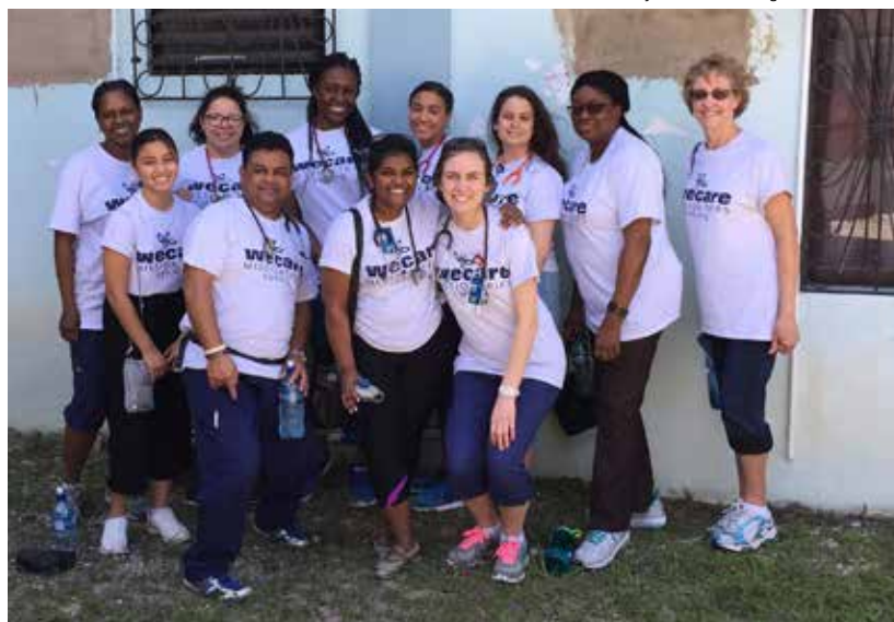
▲ The Nursing mission team gets ready to assist in a union-organized community blood drive.