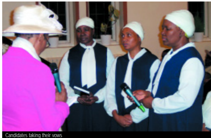
Candidates taking their vows

Jesus had great faith in them. He looked at their qualities, not at who they were, but for who they could become if they followed him.