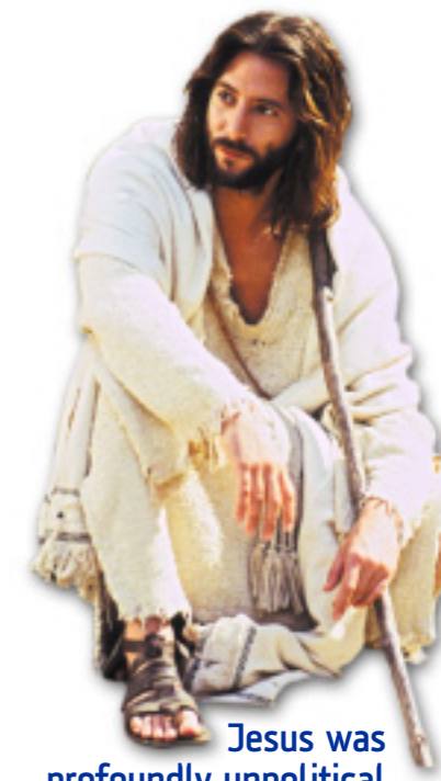
Jesus was profoundly unpolitical

* This editorial is based on Philip Yancey's What's So Amazing About Grace? published by Zondervan. It costs £8.99 and is available through your Adventist Book Centre or from your local Christian bookshop.