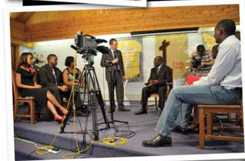
Below right: The Sabbath morning congregation