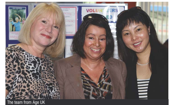
The team from Age UK

success, but also to: the British Heart Foundation, the Stroke Association, HealthWatch, the Terrence Higgins Trust, Age UK, and the other organisations who exhibited with us in Telford on Sunday.