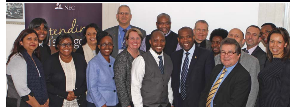
Team with NEC office staff