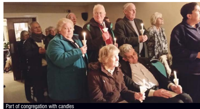
Part of congregation with candles