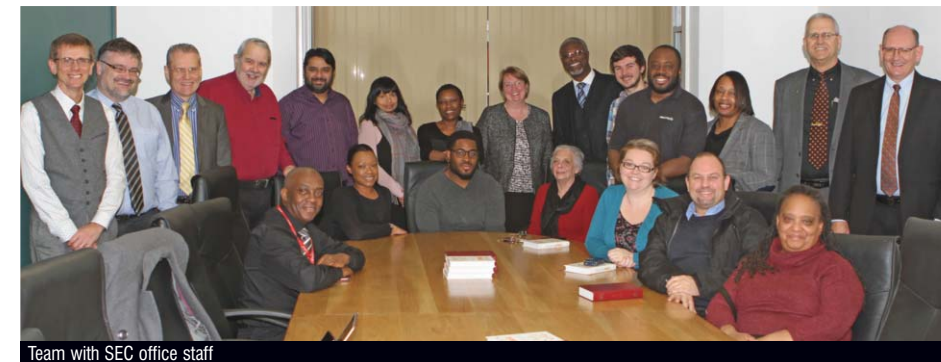
Team with SEC office staff