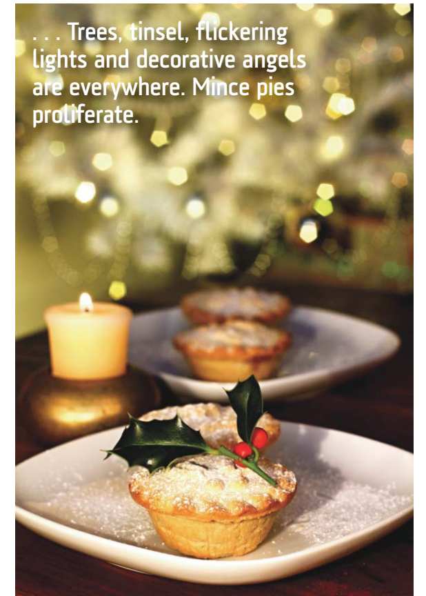
... Trees, tinsel, flickering lights and decorative angels are everywhere. Mince pies proliferate.

Perhaps Milton was suggesting the very thing we see epitomised in the attitude of the shepherds: that the spirit of humble, grateful worship is the primary gift we can give our Saviour. Whether in private or public, authentic worship trumps all other gifts fit for the King of Kings . The same emphasis is also seen in the visit of the magi: 'And when they had come into the house, they saw the