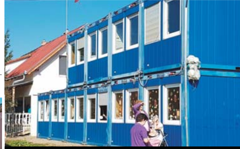
School in Vaidei

So this quest is now finished! We never imagined that we would raise £6,700 when we started in June. The majority of the money went to the school – besides the wood, we were able to help pay overdue salaries and tax bills, which has helped ease some financial worries for now.