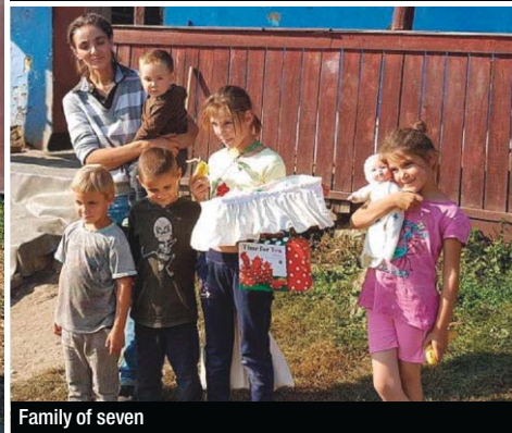
Family of seven

We are so grateful and thankful to everyone who contributed to this project. You have all helped to make a difference in the lives of the children. We got to visit and experience it first-hand, but you all helped to make it possible.* Thanks again!