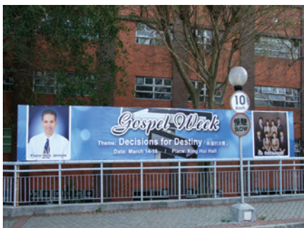
Banner for the Gospel Week