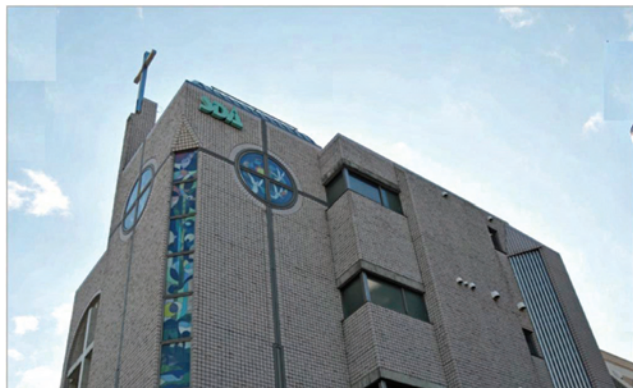
Chinese Mission Center

A new setting can be seen at Tachikawa East Japan Union Conference office. A new plaque was installed at the entrance of the Seventh-day Adventist Chinese Mission office. After seeing the needs of the PMM work being done in Japan in 2007 and as a result of the 13th Sabbath School offering being approved in 2007 to be set aside for Japan Union Conference in 2008, a special committee board began the first steps