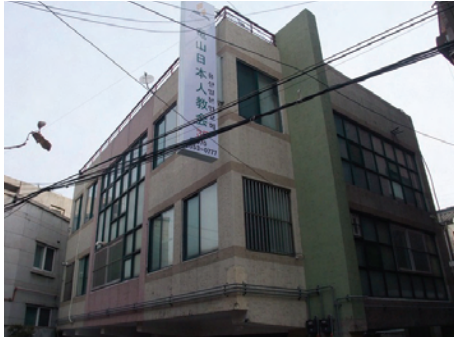
Yongsan Japanese Adventist Church

The Seventh-day Adventist Yongsan Japanese Church celebrated its official opening in Yongsan, Seoul, Korea