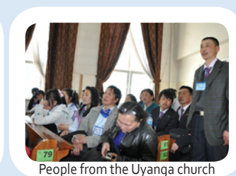
People from the Uyanga church