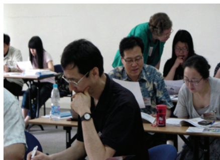
Participants study hard