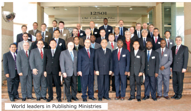
World leaders in Publishing Ministries