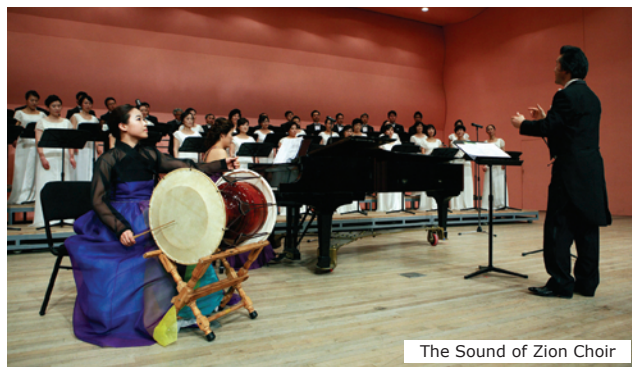
The Sound of Zion Choir

She hosted a string of other mission concerts to promote and support various mission projects of the NSD such as the 1000 Missionary Movement and HisHands Mission Movement. The last concert was held in aid of the construction of the Mongolian