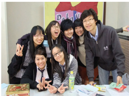
Booth activity with Golden Angels