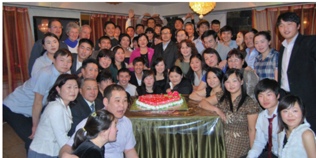
Couples and speakers at Valentines Day dinner