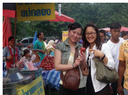
At a market