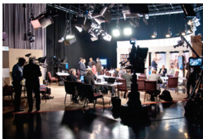
Hope Channel Advisory