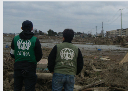
ADRA Japan participates in earthquake recovery work