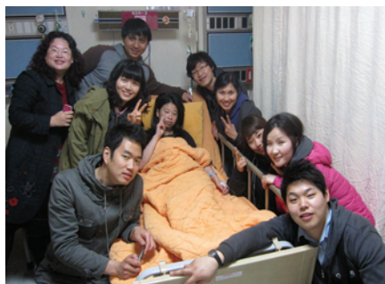
Mission work in Yilan, Taiwan