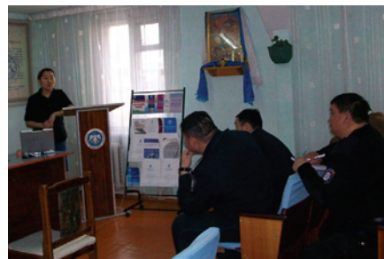
Lectures at the Police Department

A NEWSTART program was conducted for the church members of Hutul. Ten people were trained to give stop smoking seminars. After all the activities of the week, Sabbath was one of the happiest and memorable moments for both our “Youth Alive” young people’s group as well as for the local church leader and members.