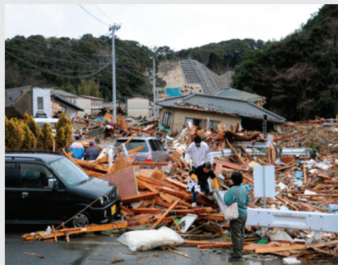
A powerful earthquake collapses houses