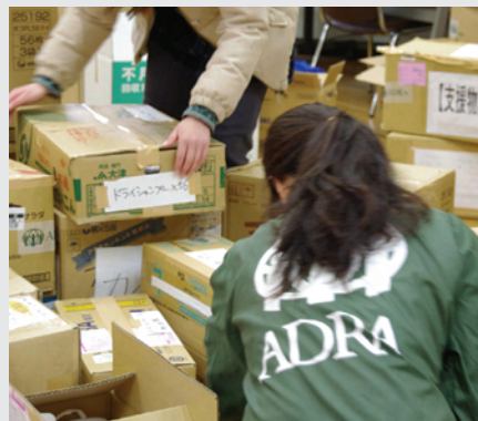
ADRA Japan delivers relief to earthquake victims