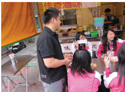
GA invites students to their concert in Chiayi, Taiwan

We hope and pray the seeds of faith that we have planted will grow and soon bring a great harvest.