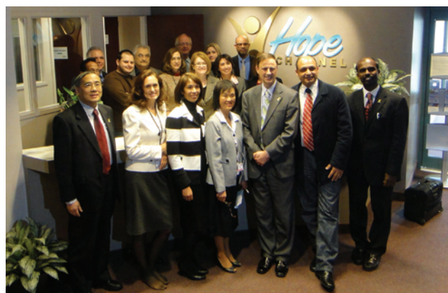
Hope Channel Advisory participants