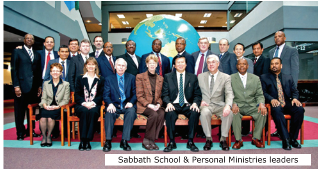
Sabbath School & Personal Ministries leaders

The Advisory of the Sabbath School & Personal Ministries department was held from March 21 to 25, in conjunction with the World Sabbath School Curriculum Committee from March 28 to 31 at the church headquarters in Washington, D.C. Although church members may know that the SS/PM department plays a major role in the educating and training of members for the mission of our church, many people don't know about the vast scope of its work. The Sabbath School department is responsible for developing all the lesson study guides for all age groups, from babies (Beginners), through students (Primary) and young adults, till the elderly, including Bible Correspondence School lessons, materials for teachers and for the sight impaired. Among the many agenda items discussed at the Advisory, I, personally, was thrilled at the many items that were voted concerning our Children's Ministries. As our church body is growing globally, many of our delegates sensed a greater need for translations of our materials into other languages from the original English. Somehow we need to develop a way for