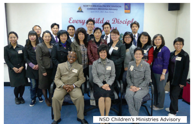
NSD Children's Ministries Advisory

alarming and unless stemmed, will cause serious leadership issues in the next decade or so, particularly in congregations with an aging population. It is our hope and prayer that the agenda of the Lord will be sought at this Advisory and that we will be moving forward with lots of prayer and a commitment to doing His will.