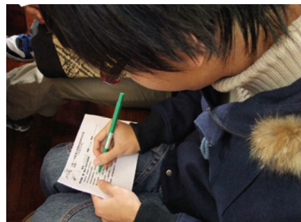
Students request Bible studies