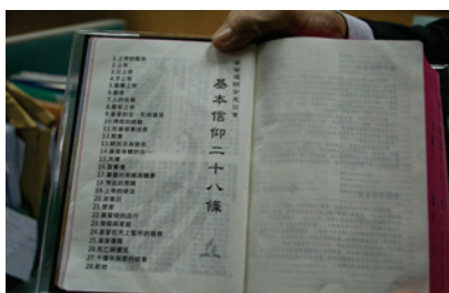
Newly published Chinese Bible