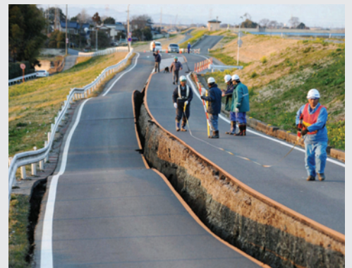
Due to an earthquake the road caved in