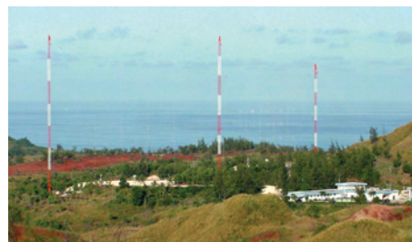
AWR Shortwave Station in Guam

strength, at the right frequency, to adequately reach listeners in northern China, Mongolia, Siberia, and beyond. Adding a fifth antenna will enable AWR to broadcast a strong signal to these areas during prime listening hours, as well as simultaneously transmit additional programs in more languages.