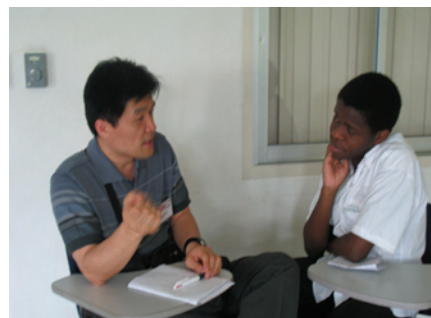
Turn to your neighbor