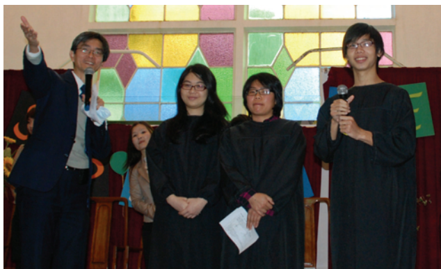
After the Gospel Week, three students were baptized

When I was small, I studied at a Catholic primary school and went to Church, so I knew something about God and I loved God at that time. I left the Church finally because I could not find meaning in going to Church. I think my life was really terrible after that, I went into depression and even attempted suicide during the time.