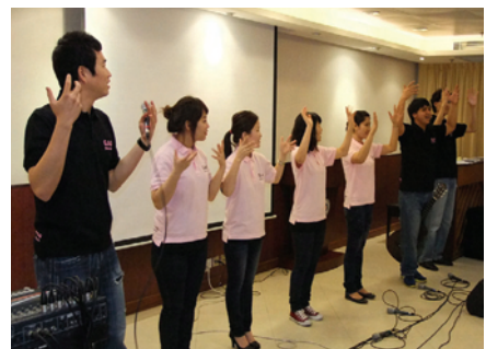
Ministry in HKAC