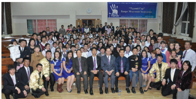
Newly dedicated HisHands missionaries