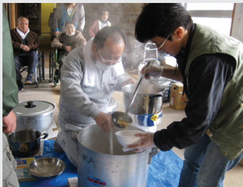
ADRA Japan works hard to relieve the earthquake victims