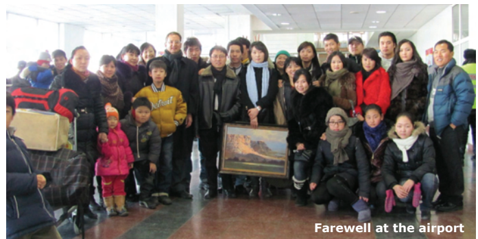
Farewell at the airport

Hardships they endured and overcame included the harsh climate in Mongolia, food that is very different from Korea, health problems, a difficult regulatory environment and of course, learning a new language. Despite these obstacles, the Maranatha church has an average attendance of sixty-five people each Sabbath. The strength of the church is that the members have been trained to care for each other and contact each other if someone is missing on a given Sabbath. A unique feature of the Maranatha church is that people tend to join it through word of mouth from relatives and friends. They come to the various clubs and activities the church offers rather than just