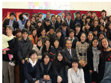
Together with students