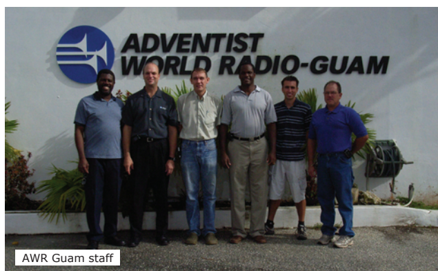
AWR Guam staff

AWR hopes that the installation of the new tower and antenna can be completed by the end of 2012, which is the Guam station's 25th anniversary year.