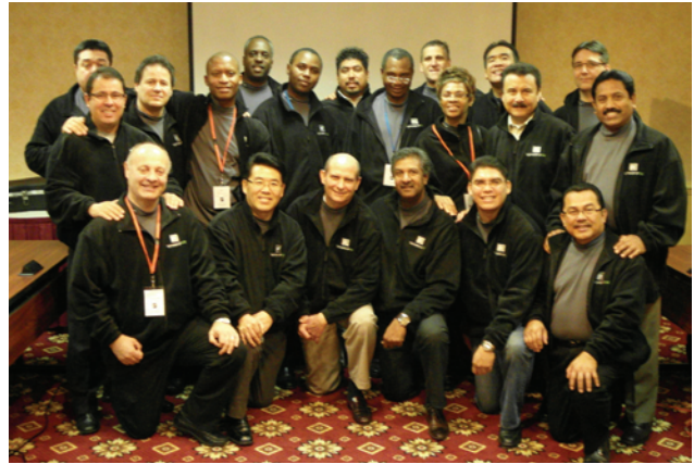
World Youth leaders

The Youth departments of the world church reconfirmed our mission calling and reestablished the obvious goals of concrete visions and practical activities for our ministries. The in-depth seminars about "Youth ministry in the time of post-modernism" with specialists of different fields for youth ministries helped reassure all the participants of the "Power of One". Reports from the 13 Divisions, presentations on "Professional Master Guide fostering plans," the introduction to the "Mission