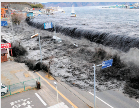
Roads and buildings are swept away by a tsunami