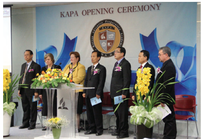
KAPA Opening Ceremony

The climax of the ceremony was the unveiling of the school's name and logo accompanied by a loud fireworks display. Later, in the office of the principal, a short ceremony together with the signing of a contract between GIA and AU, the new owner of GIA/GU and the president of Yangpyeong English Village.