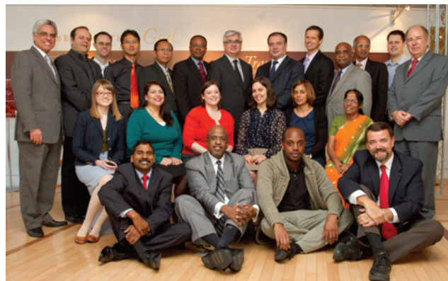
GC Communication staff and 13 division directors