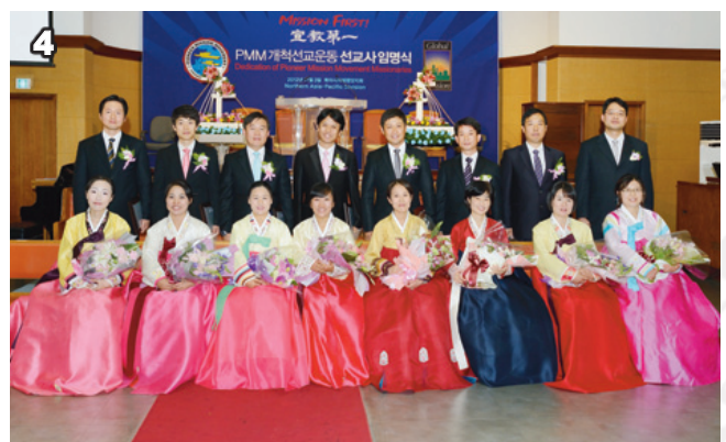
1. 11th Batch PMM Missionaries during the Ceremony 3. GC & NSD Leaders pray for the Missionary couples