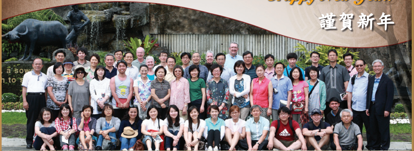
Northern Asia-Pacific Division Staff and Families