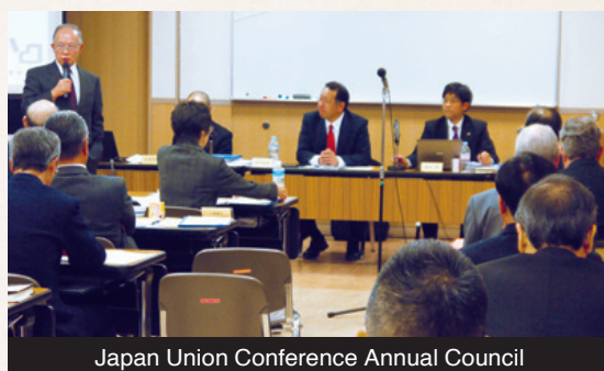
Japan Union Conference Annual Council