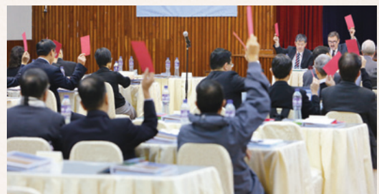
Participants vote during the Session