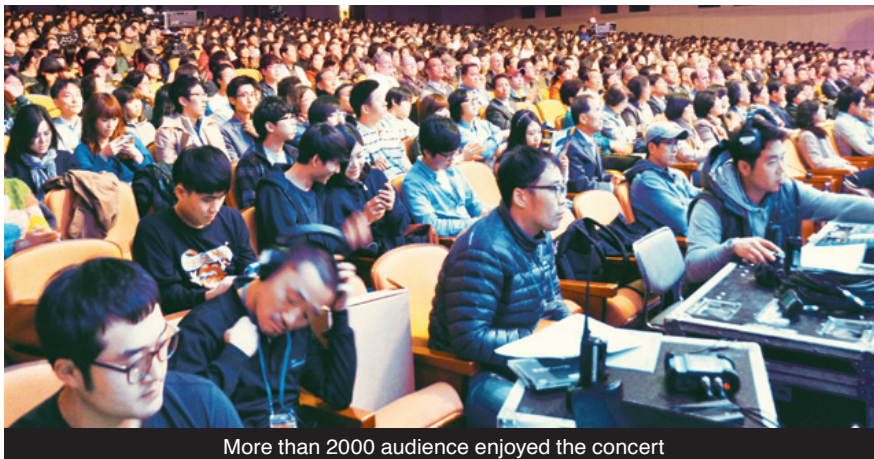
More than 2000 audience enjoyed the concert