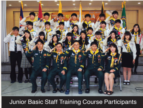
Junior Basic Staff Training Course Participants

The JBSTC is the Korean version of Teen Leadership Training (TLT) which was created by the General Conference (GC) for teenagers. The JBSTC has changed