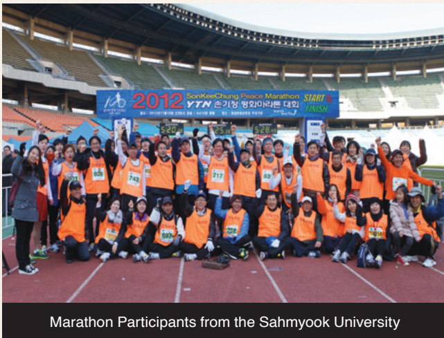
Marathon Participants from the Sahmyook University