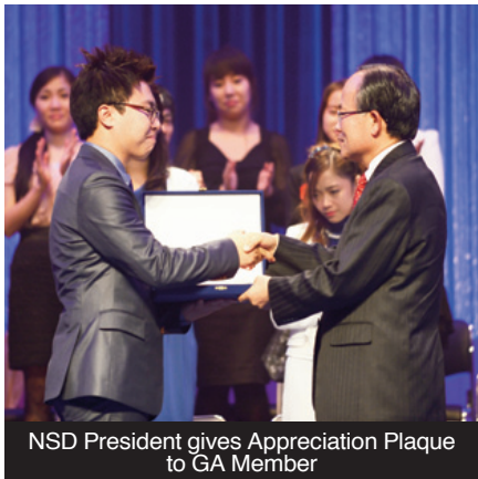
NSD President gives Appreciation Plaque to GA Member