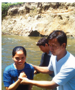
A newly baptized member by the efforts of the Indonesian 1000MM