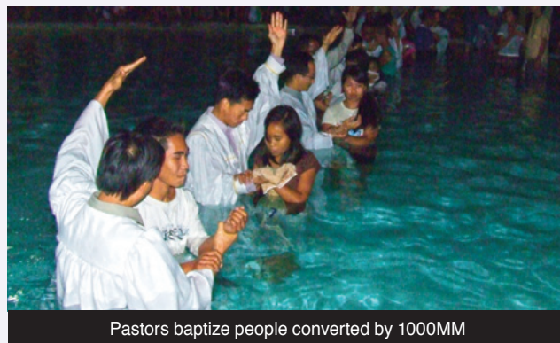
Pastors baptize people converted by 1000MM

Missionaries: Korean churches and brethren can write encouraging letters to our missionaries.