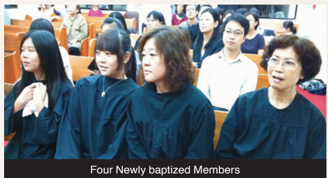
Four Newly baptized Members

member or a friend. While we struggle with the attacks of Satan on our homes, we can surely trust that if we believe in Him, God will lead us to the ideal home of all homes—the new heaven and new earth. These topics were well received as the approach to evangelism was new to them.