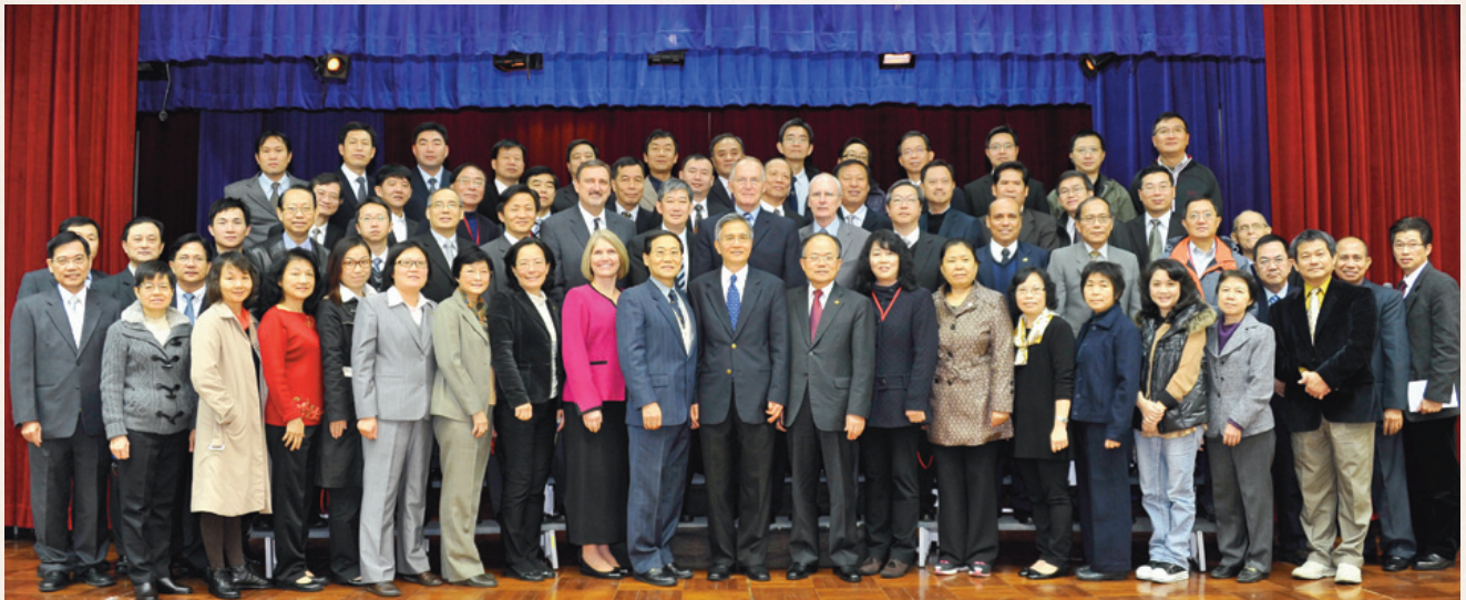
2012 Chinese Union Mission Special Session Participants