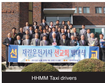
HHMM Taxi drivers