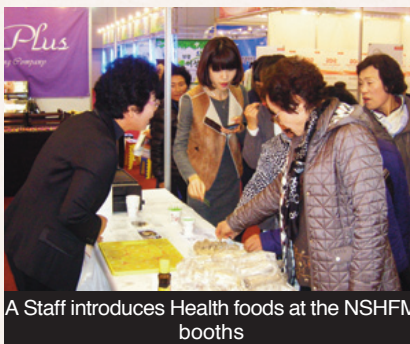
A Staff introduces Health foods at the NSHF booths