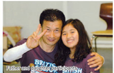
Father and daughter participants