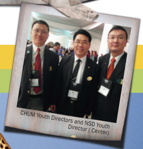
CHUM Youth Directors and NSD Youth Director (Center)