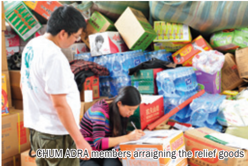
CHUM ADRA members arranging the relief goods

The Lushan earthquake occurred on April 20, 2013. 22 church members in Lushan Church experienced the earthquake. But by God's grace, they are all safe and sound. However their houses and two meeting grounds collapsed.