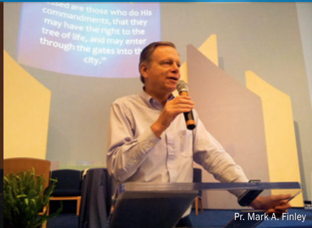
Pr. Mark A. Finley