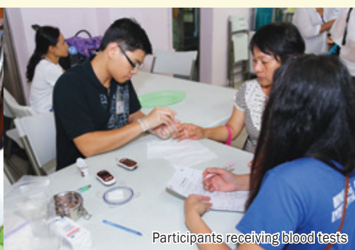
Participants receiving blood tests