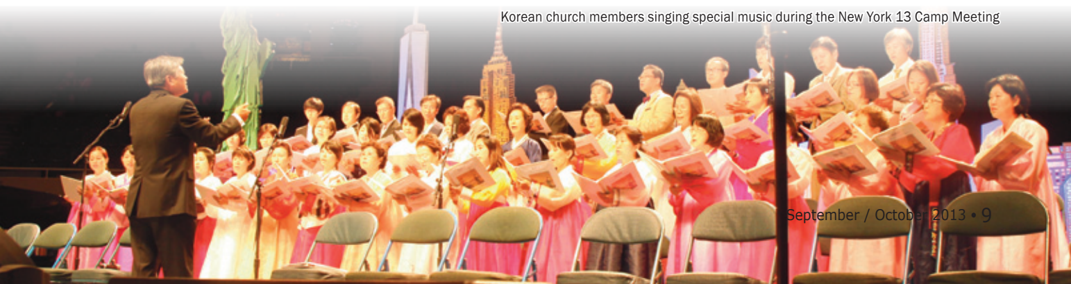
Korean church members singing special music during the New York 13 Camp Meeting

To catch more fish, we need to go to the sea. To win more souls for the kingdom of God, we must strengthen our work in the cities. While we do our public evangelisms in the cities, we need to continue our ongoing activities such as community services, centers of influence, door-to-door visitations, integrated media outreach, health seminars, and all kinds of methods as much as we can to expand His kingdom and hasten His soon return.