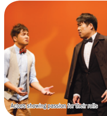
Actors showing passion for their rolls

The Mission Theatre Company (MTC), a performing arts group organized by Adventist youths in Hong Kong, presented to the public an excellent musical on June 8th and 9th at the Sai Wan Ho Civic Centre in Hong Kong. The group is affiliated with the Pioneer Memorial Church under the Hong Kong-Macao Conference. The musical was titled Count Down , which uses the Great Controversy as theme to call the people to take side with God as the history of the earth is winding down quickly.