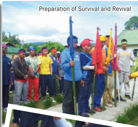
Preparation of Survival and Revival