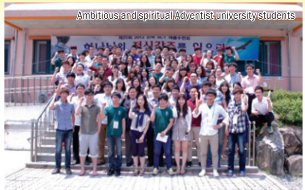
Ambitious and spiritual Adventist university students

Small group meetings continued throughout every lecture to help attendees think of the word of God again and apply it to their lives. Golden Angels held a touching concert for 2 hours and the students shared their testimonies during campfire. ACT, which was initiated in 1967 to raise leaders for campus ministry, emphasizes passion and vision into Adventist collegians and takes important roles in academic study and evangelistic mission.