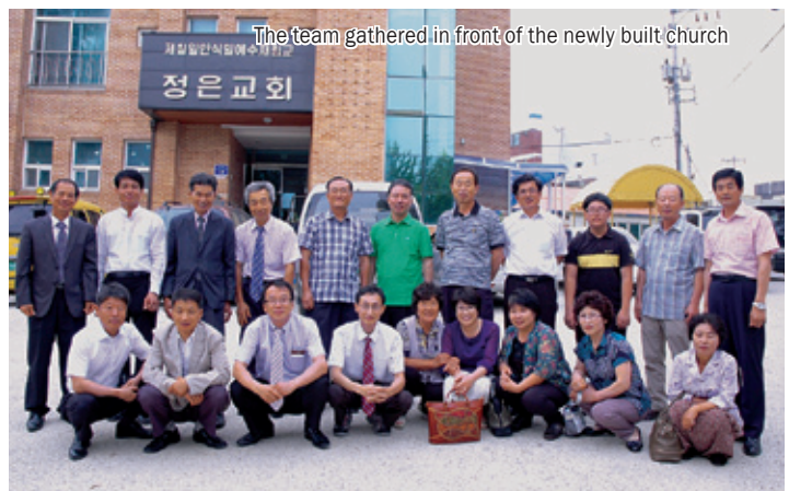
The team gathered in front of the newly built church