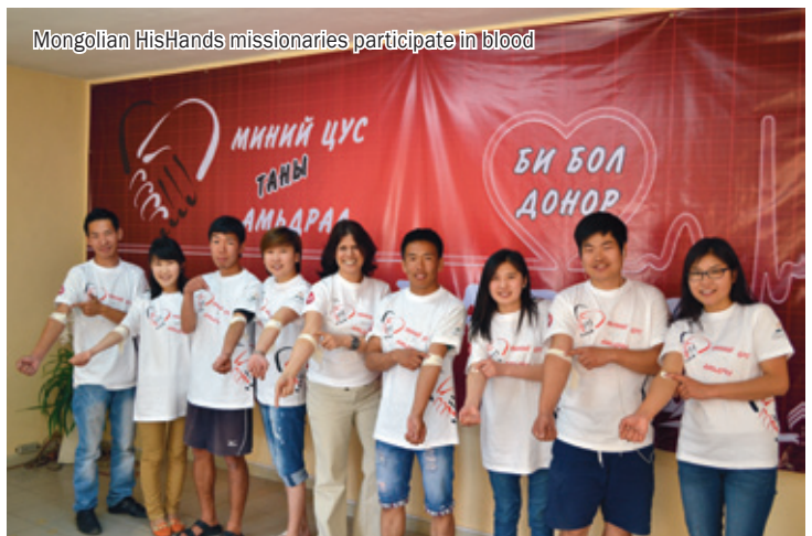
Mongolian HisHands missionaries participate in blood

Blood Donation is an activity proven beneficial for health. It is the first time for MM to hold this program, and everyone is happy to promote the good cause especially when it can be an avenue to advertise healthy living of the Adventist Community. Hence, it is envisioned that the program will be done on a yearly basis to promote health awareness among the locals. In reflection, Jesus Himself shed His blood to give us eternal life. By a simple gesture of sharing our blood, we, too, can save lives!