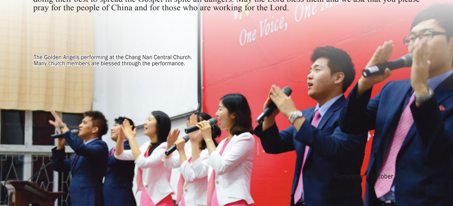
The Golden Angels performing at the Chang Nan Central Church. Many church members are blessed through the performance.

In China, it is still hard to preach the Gospel. However, every church member, pastors, PMM pastors are doing their best to spread the Gospel in spite all dangers. May the Lord bless them and we ask that you please pray for the people of China and for those who are working for the Lord.