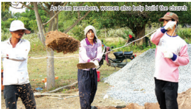
As team members, women also help build the church

Deaconesses also participate in supporting volunteers and workers. When there is an evangelistic meeting, they even prepare food for the meeting.