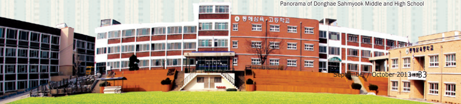
Panorama of Donghae Sahmyook Middle and High School

Therefore, its image is being improved. The school will never stop growing. They have only just begun. Now it is time for us church members to support Donghae Sahmyook Academy.