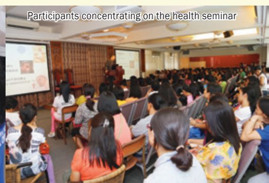
Participants concentrating on the health seminar

TW) in Hong Kong; Hong Kong-Macao Conference; Metro Plus AM 1044; Consulate General of the Philippines. During the health fair, participants were given a chance to enroll in the Bible Correspondence School program (Discover Bible Study Guides). A total of 124 enrolled and 150 people took part in the Spiritual Counseling program (with prayer as a bridge to the gospel). 150 people also participated in the social network service event (Facebook; Twitter). Three seminars ("Reading Food Label"; "Gynaecology Health Promotion and Disease Prevention"; "ADVENTIST") were offered. The medical services offered Blood Pressure Check-up, Weight/Height Measure, Hand Grip, Body Fat, Blood Sugar Test, Health Counseling and Health Age Assessment. During the health fair special exhibitions were displayed for Adventist health messages such as "Healthy Foods," "Stop Smoking," "NEWSTART." 320 copies of "Ministry of Healing," 133 copies of "Steps to Christ," and 280 copies of "Great Hope" were distributed to the interests.