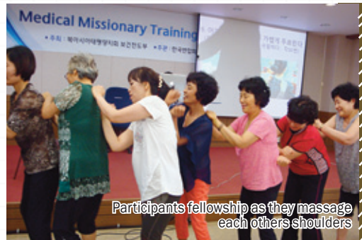
Participants fellowship as they massage each others shoulders