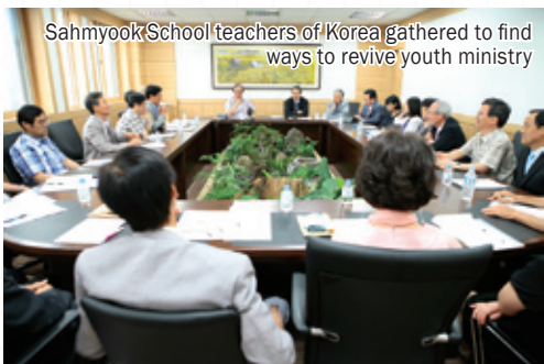
Sahmyook School teachers of Korea gathered to find ways to revive youth ministry

On July 4, 2013, the principals' meeting was held in the KUC headquarter to set up development plans for children and youth ministries. Meaningful conversations went on about the actual conditions of education and effective coping plans.