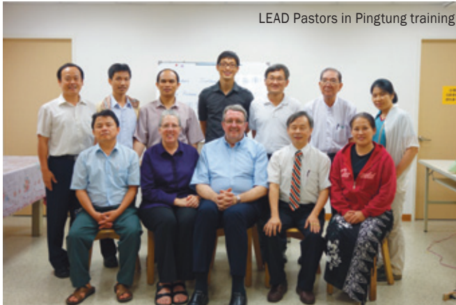
LEAD Pastors in Pingtung training