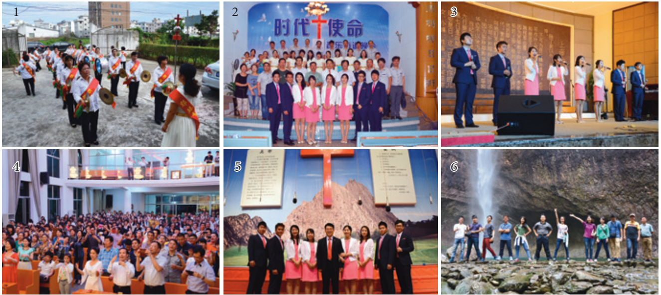
1 : Church members welcome the Golden Angels, 2 : Golden Angels and the local church praise team, 3 : The Golden Angels praising at a church in Wen Zhou, 4 : Church members participate in praise worship, 5 : The Golden Angels, 6 : Retreat after the Golden Angels mission