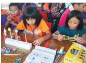
Pathfinders concentrating on booth activities