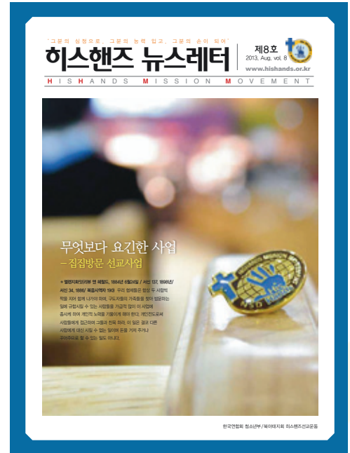
The 8th HisHands News Letter