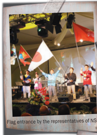
Flag entrance by the representatives of NSD

Over 1000 participants were involved in Community Service Projects starting from Monday, July 1. Korean Union Conference's youth also did their Community Service Project for Riverside SDA Primary School in Cape Town during the first week of July. Because it is a private school, they have a small or no support from the government. With love and devotion, delegates painted walls and refurbished furniture (skimming and varnishing wooden floors). All of the volunteers including youth directors had an attitude of self-sacrificing spirit for this service according to the youth department's motto, "The love of Christ compels us."