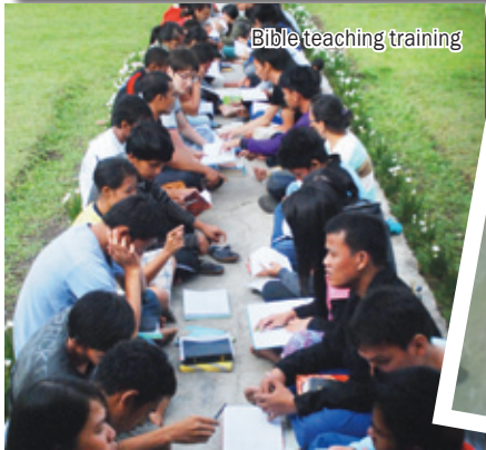
Bible teaching training