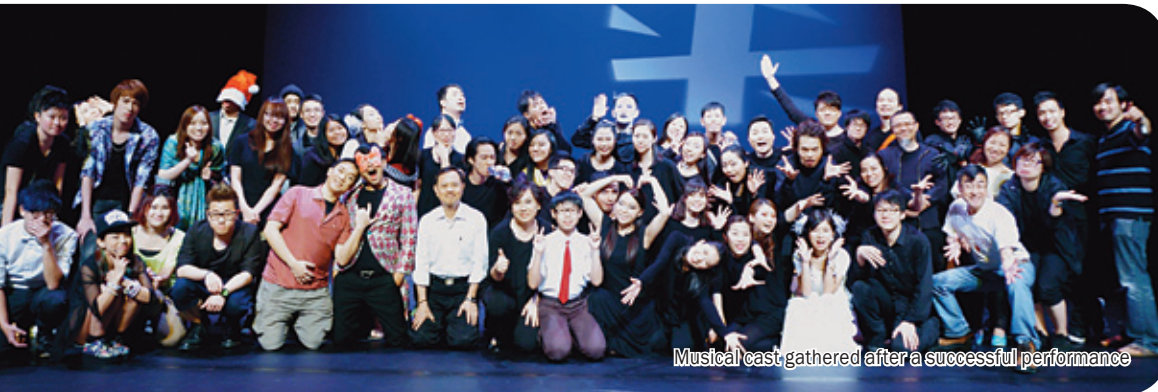
Musical cast gathered after a successful performance