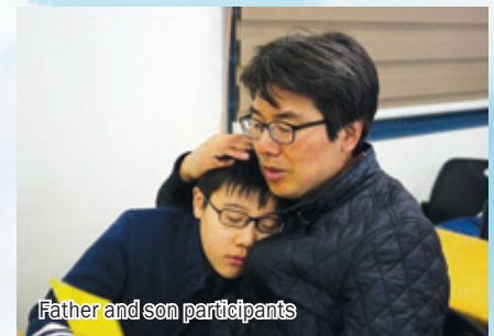
Father and son participants