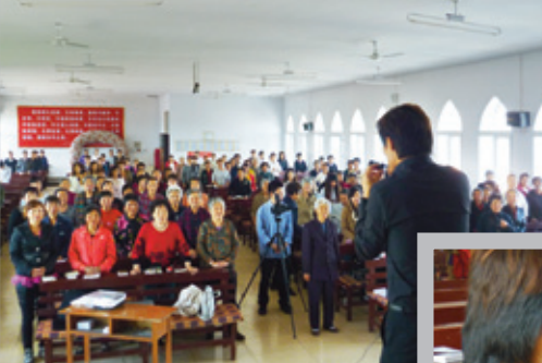
Chinese people participating in the health seminar