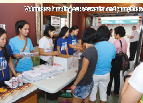
Volunteers handing out souvenirs and pamphlets