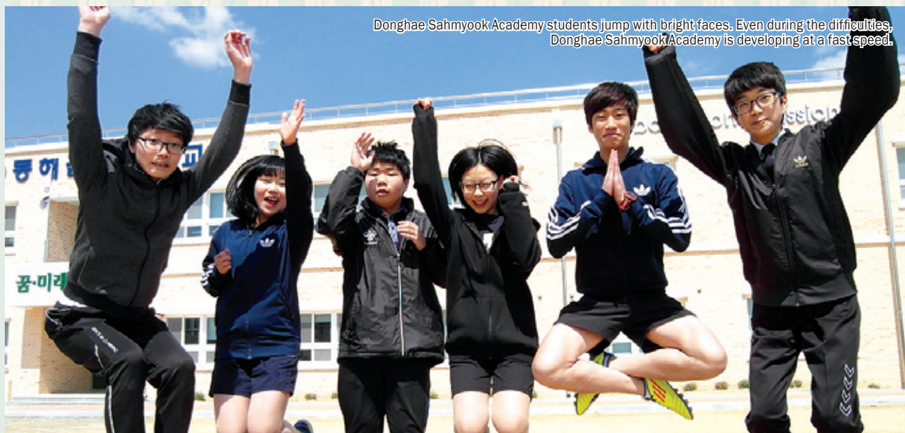
Donghae Sahmyook Academy students jump with bright faces. Even during the difficulties, Donghae Sahmyook Academy is developing at a fast speed.