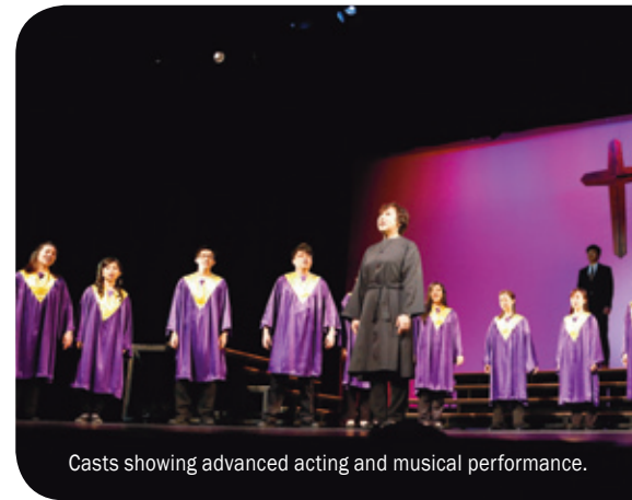
Casts showing advanced acting and musical performance.

MTC was first organized in April of 2012. It has attracted around 60 members in its effort to bring the gospel to its audiences through stage performance. MTC has been working on the musical Count Down since last year. The debut of the group was a success. Nearly ninety percent of the seats on June 8th were sold. MTC members thank God for His blessings and are now in the process of planning another performance for next year.