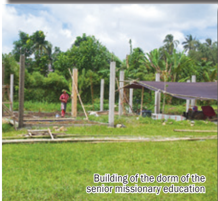
Building of the dorm of the senior missionary education