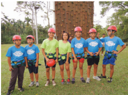
One of many Outdoor Activities, Rock Climbing