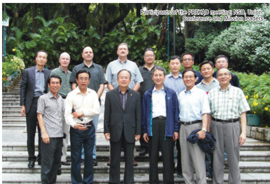
Participants of the PREXAD meeting; NSD, Union, Conference and Mission leaders

The three-day PREXAD meeting was over. The leaders reassured their allegiance to God and His mission with great expectations of International Mission Congress, which will be held on Aug 28, 2013.