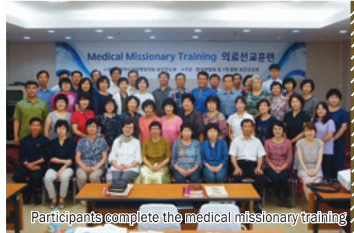
Participants complete the medical missionary training

54 participants from the three conferences joined our program. When we learn-eat-share together through the help of Jesus Christ, we experience unity and to move His work forward. Our target is to train 100 missionaries by the end of this year.