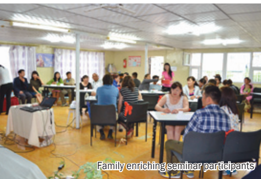
Family enriching seminar participants

Thus, it is hoped that the said twenty couples will impart good influences as they go back to their respective abodes. Every family that is shaped rightly unto Christ will make the home a little heaven on earth!