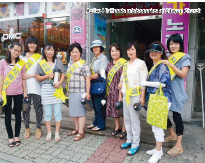
Active HisHands missionaries of Sihwan Church