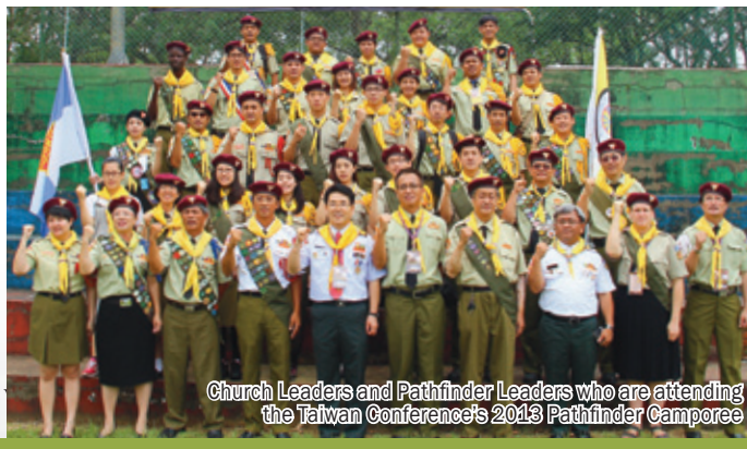
Church Leaders and Pathfinder Leaders who are attending the Taiwan Conference's 2013 Pathfinder Camporee