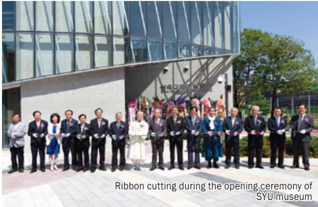
Ribbon cutting during the opening ceremony of SYU museum

Sahmyook University (SYU) had a historical and grand opening of its museum on May 30, 2013. The museum began with its first donated artifacts 13 years ago.