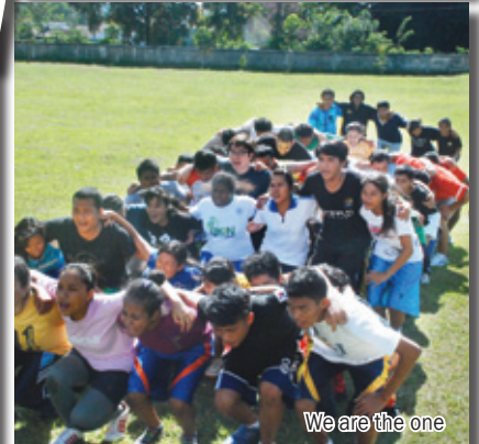
We are the one

promise to rededicate another 1 or 2 years of their lives to the Lord. They repeat the training course and are again sent out to their mission fields. The senior missionaries scattered around Indonesia carry out YPBC (Youth Prayer and Bible Camp) each year in their capital city Jakarta and many other cities YPBC is in the forefront for reviving the faith of young Indonesians.