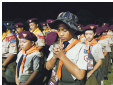
Devotional prayer during the evening worship