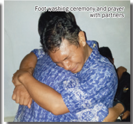
Footwashing ceremony and prayer with partners