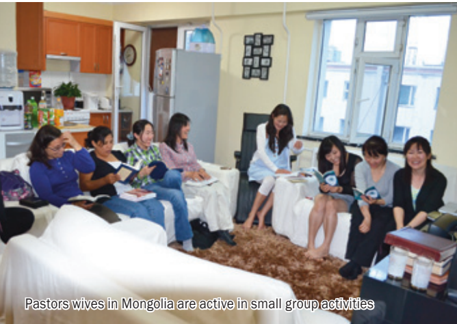
Pastors wives in Mongolia are active in small group activities