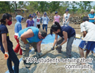
TAPA students serving their community