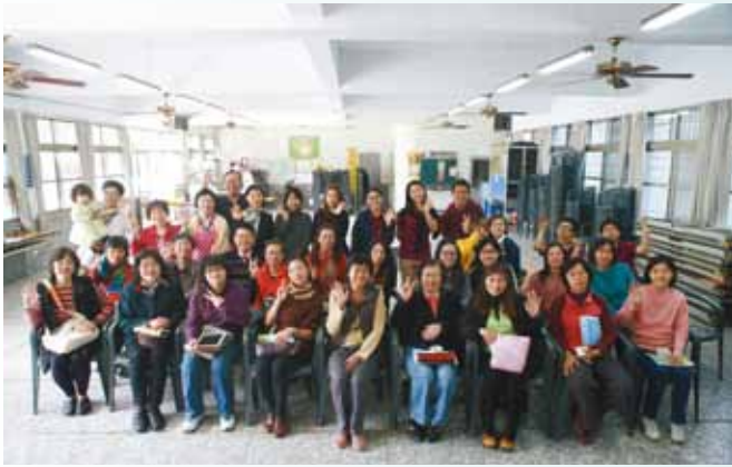
Sintien PMM Church members are thankful to the faithful service of G.A.