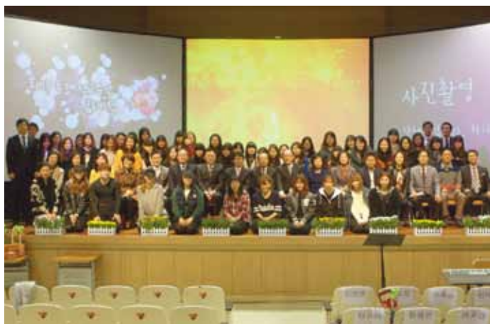
53 students of the Sahmyook Health University College were born again in Christ

S ahmyook Health University College hosted an Autumn Mission Week from October 28 to November 2, 2013. In cooperation with the Korean Union Conference (KUC) Media Center, the college helped students understand the Adventist faith. Every chaplain preached the gospel with a different topic each day. Visual media on books, films, historical events, philosophers’ ideas, and social phenomenon were especially utilized to deliver the message.