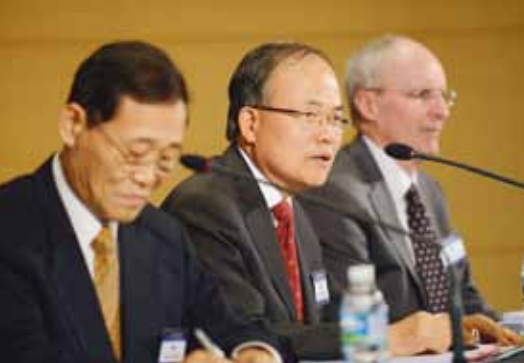
NSD 3 officers on Annual Council Meeting