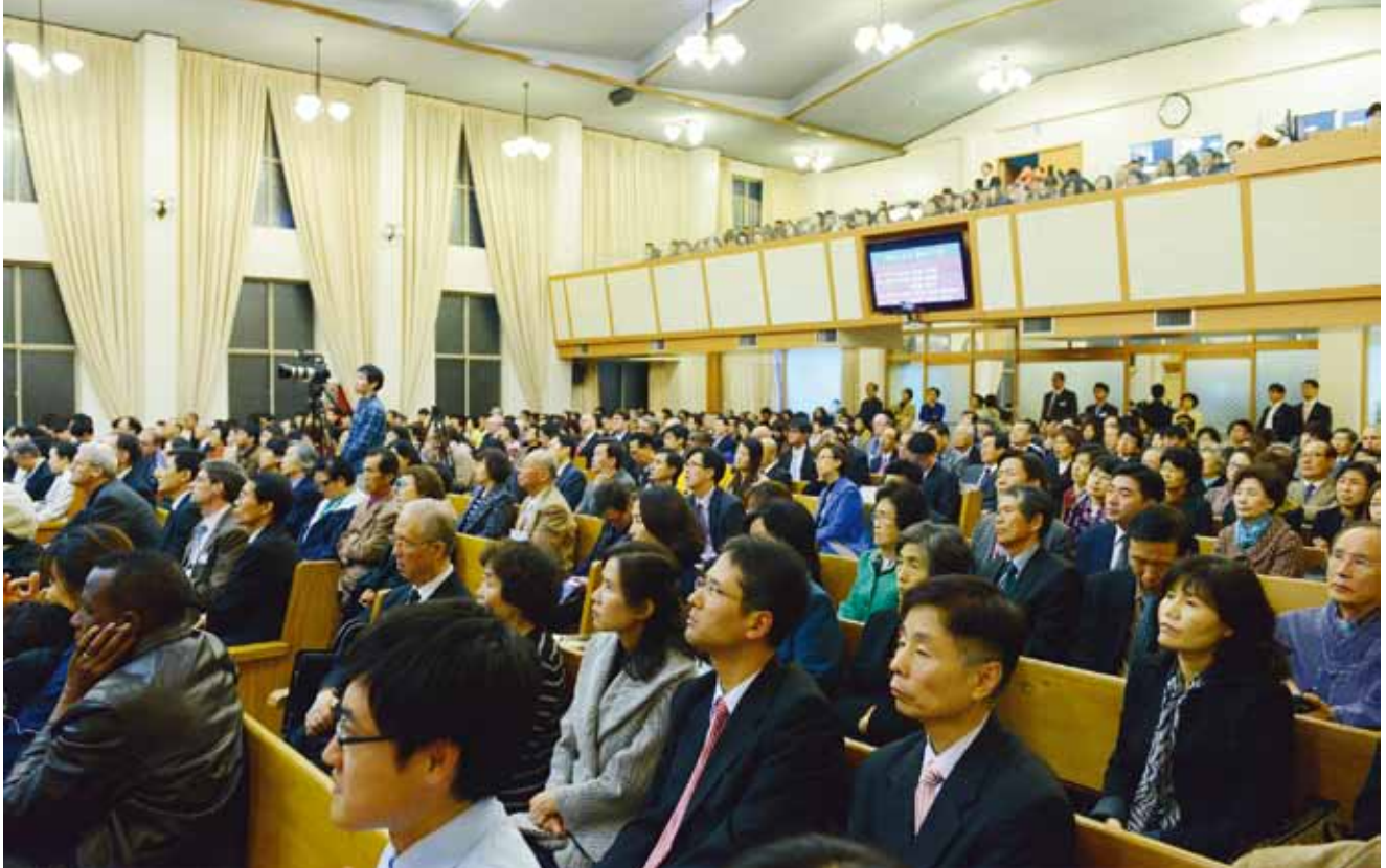
Participants eagerly pay their attention to the messages during the NSD Religious Liberty Conference

The Religious Liberty Conference and Prayer Meeting for Religious Freedom in North Korea was held at Sahmyook Central Church with 400 attendees on October 1, 2013. The Northern Asia-Pacific Division (NSD) Public Affairs and Religious Liberty (PARL) hosted, with the Korean Union Conference (KUC) PARL arranging the event. It was organized to reinforce the importance of religious liberty, and to pray that the door of religious freedom will be opened in North Korea, which is one of the most closed countries in the world.