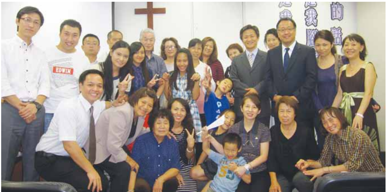
Tokyo Chinese Adventist Church members after the Tokyo 13 mission activities. Four people received Jesus Christ as their personal savior through this effort.