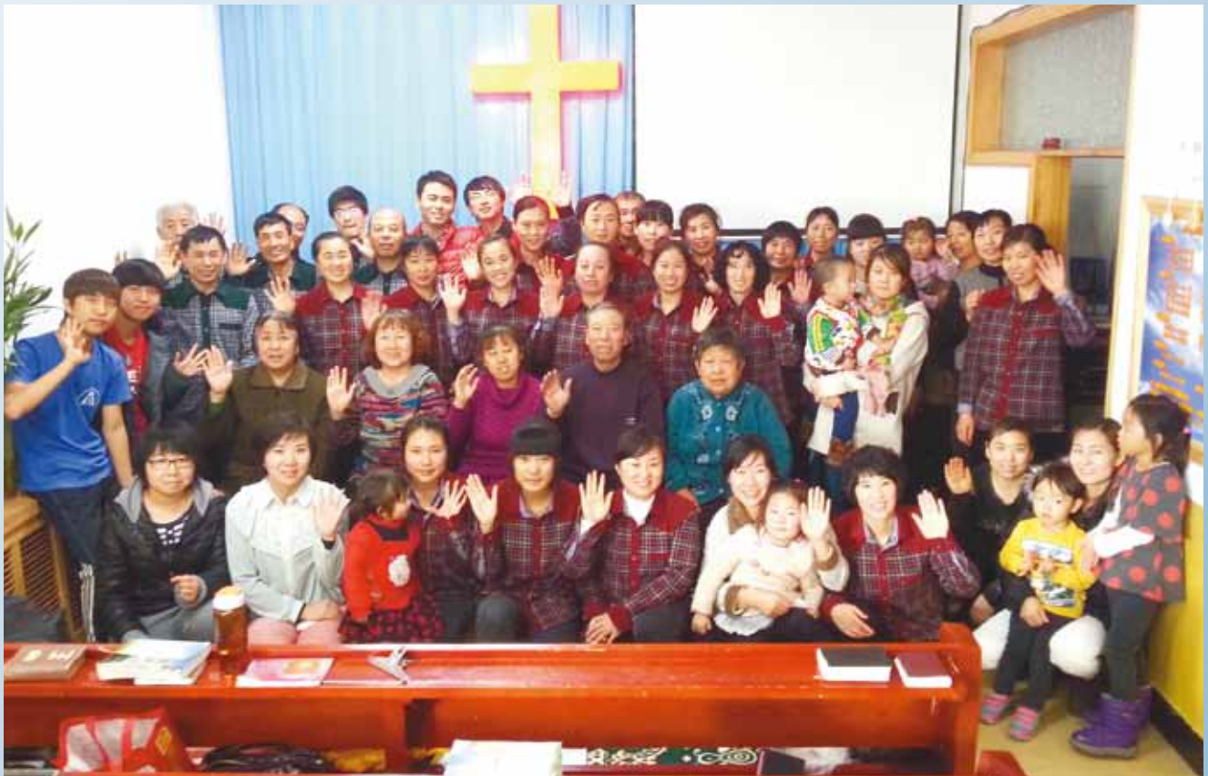
Yanji Chinese Church HisHands members. Three precious souls received baptism through the HisHands activities.

At present, about 50-60 members gather on Sabbath at the Yanji Chinese Church, and the church's four evangelists go to nearby small churches and meeting places.