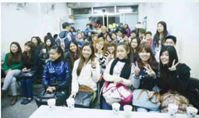
Golden Angels' concert is almost packed with many young people.