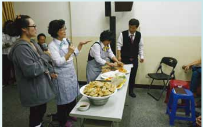
Korean Food Class is a fascinating part of the mission activities.