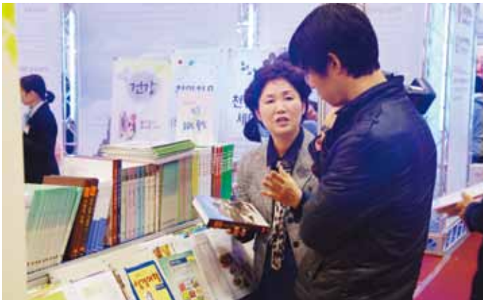
One of staff introduces the Spirit of Prophecy books