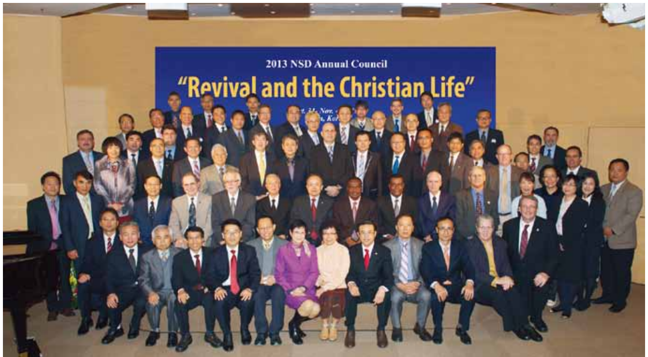
2013 NSD Annual Council delegates. 80 church administrators and leaders participated this meeting.

During the year-end meetings, the reports from departments, institutions, and special mission projects were presented to the delegates, and they voted for approving annual budgets, policy changes, the appointment of three officers for the Mongolia Mission (MM),