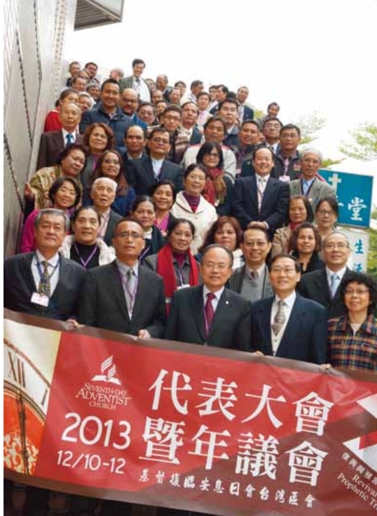
Delegates of the 2013 Taiwan Conference Annual Council