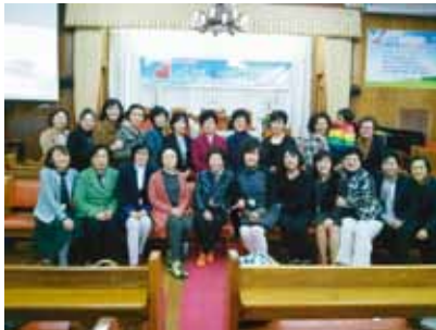
Happy Family Seminar participants

Director of NSD Women's/ Children's/ Family Ministries