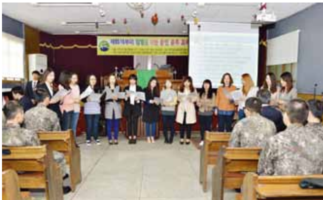
A group of Adventist Youth praise God in a military camp