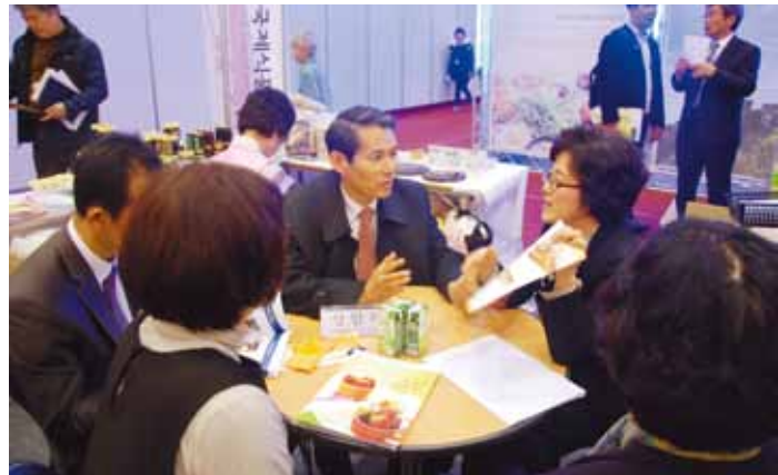
Giving Counsel on Health and Diet