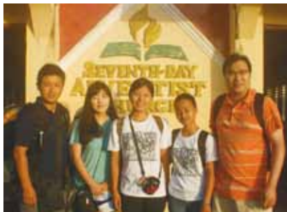
Pastors' visit 1000MM missionaries at the Typhoon stricken areas