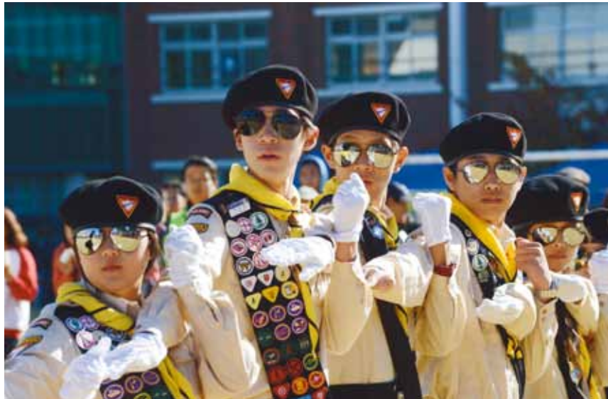
A group of Korean Pathfinder performs drill and marching.

"As I see American Pathfinders, I thought it may take more than 10 years for Korean Pathfinders to be developed like them. But I feel that we made