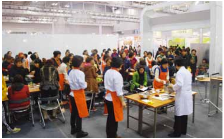
A group of Adventist Youth praise God in a military camp