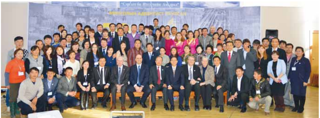
Delegates of the first Constituency Meeting of the Mongolia Mission