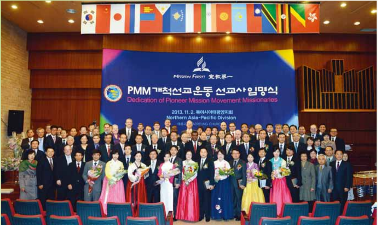
Newly dedicated PMM missionaries with the NSD Annual Council delegates. On this day eight new missionary families dedicated their 6 years for mission.