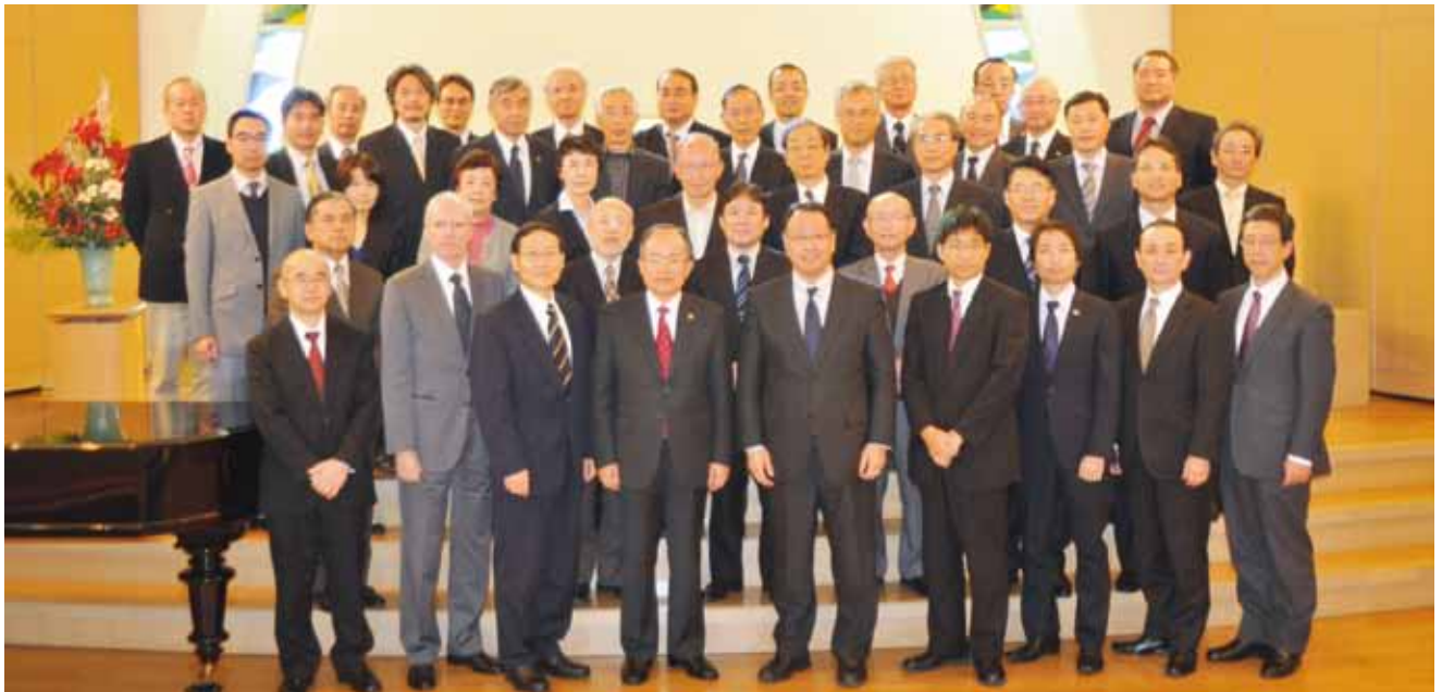
Delegates of the 2013 Japan Union Conference Annual Council

The result of Tokyo 13 was reported, saying that the baptismal goal of 100 will be highly possible to be achieved by God's grace. The report encouraged the delegates very much, and they thanked the Lord. Throughout the session, the priority of evangelism was emphasized, and conferences, missions, and institutions responded positively to the call for mission. The three days of session closed successfully.