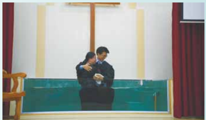
A precious young people join the baptismal service after the evangelistic meeting.