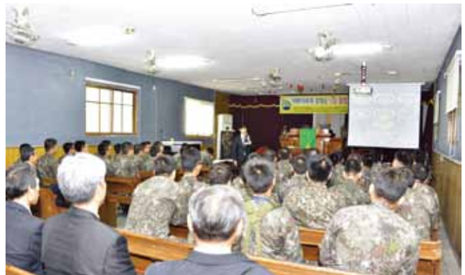
Soldiers pay attention to the smoking and drinking prevention lecture

Toegyewon Church in the West Central Korean Conference, tried to deliver the gospel to a nearby military camp. A smoking and drinking prevention program for soldiers was implemented by the Toegyewon Church at the church, on October 26, 2013. There is about a 15 year relationship between the church and the troops which has brought such a great consequence. As the church and the troops have been using the same access road, it made them naturally closer to each other. The church has given some help on troop organization day, and Christmas for soldiers' welfare. Also, many good Adventist books like the Spirit of Prophecy were donated to the troops through the sponsorship of the Publishing Ministries Department of the East Central Korean Conference.