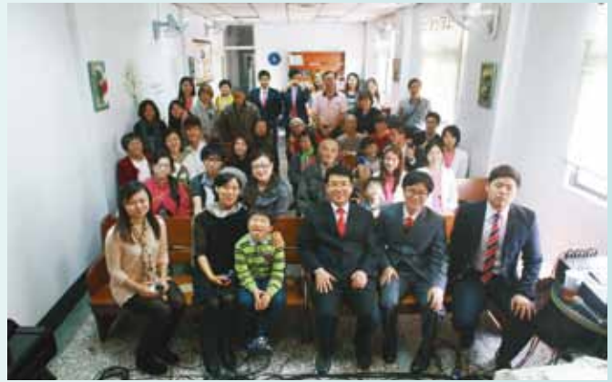
Jiayi PMM Church members with Golden Angels.