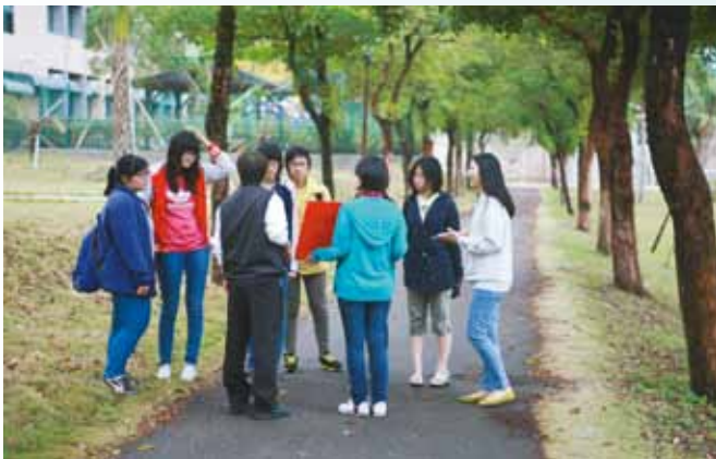
G.A. visit two universities near the Doriou PMM Church and contact students.