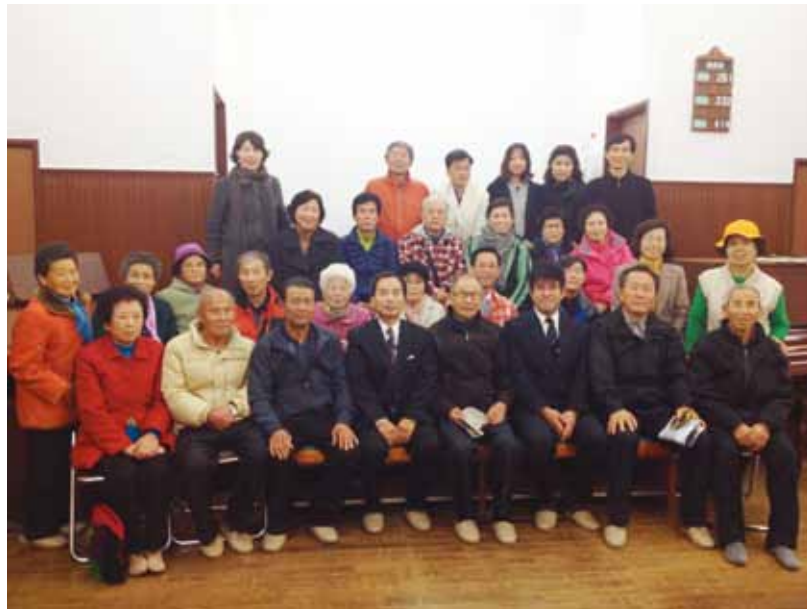
Korean volunteers who distributed 120,000 tracts in Tokyo, Japan

It was a good experience that "in all things God works for the good." Japanese church members warmly welcomed their Korean brethren and provided a nice lunch every day. The church district paid for transportation expenses. The Northern Asia-Pacific Division and the Japan Union Conference gave assistance by printing the tracts. It was a short, but very meaningful opportunity to have evangelistic experience, following Jesus' example.